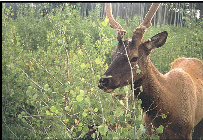
Elk browsing aspen

Aspen plays a fundamental role in facilitating post-disturbance re-establishment of forest communities, but intense browsing by ungulates can be detrimental to aspen establishment and recruitment (Seager et al. 2013). A regional survey of aspen understories across central and southern Utah showed that approximately 40% of aspen stems display evidence of browsing. Incidence and severity of browsing vary, suggesting that there are multiple factors that influence aspen browse susceptibility. However, aspen forests only require 500 to 1,000 suckers per acre to escape herbivory and recruit into the overstory for the stand to persist.