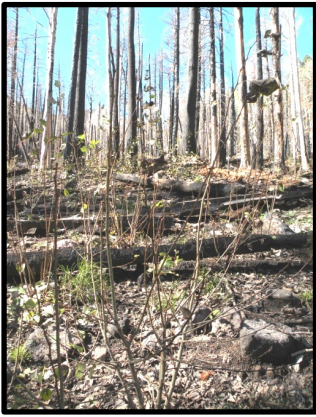
Browsed aspen suckers soon after wildfire in northern Arizona

Regardless of disturbance or aspen type, maintaining aspen resilience is highly dependent on local levels of ungulate herbivory (Seager et al. 2013). In the West, prominent aspen browsers include cattle, sheep, elk, and deer. If great care is not taken to protect post-disturbance and post-treatment stands from