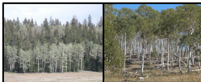
Montane seral (L) and Colorado Plateau stable (R)

use. The elevated level of forest and rangeland burning during this period resulted in many of the mature aspen forests we see today (Kaye 2011).