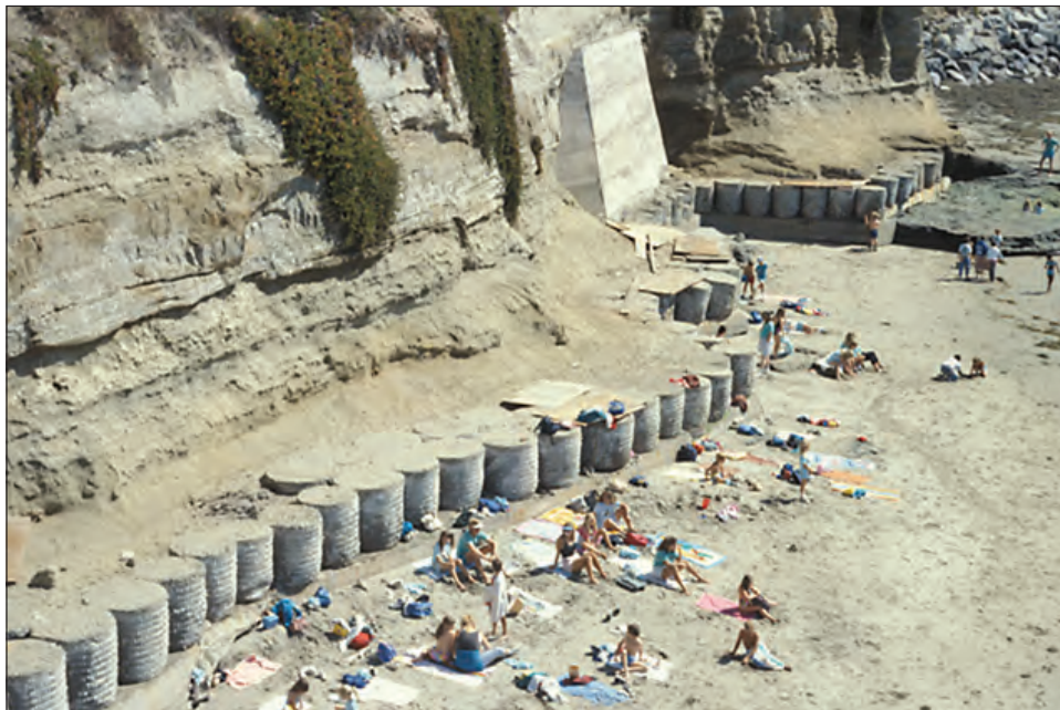
Figure 1. These cliffs in Capitola, California have been protected by a home-made seawall with visual impacts for beach users.

One relatively recent approach in California has been the use of soil nail walls or sprayed concrete, which is colored and textured to match the native rock in the cliffs. Colored and textured gunnite or soil-nail walls have been used to stabilize highway road cuts, but only recently has this approach been applied to coastal protection projects as a way to mitigate the visual impacts. These structures involve anchoring soil nails or tie backs into the bluff materials, and then constructing a steel-reinforcing frame that mimics the shape of the existing bluff. This mesh is then covered with about a foot of gunnite, followed by a second 6- to 12-in. thick layer, which is textured and colored to match the adjacent rock as closely as possible (fig. 2). Weep or drain holes must be built into the structure in order to avoid the buildup of water behind it.