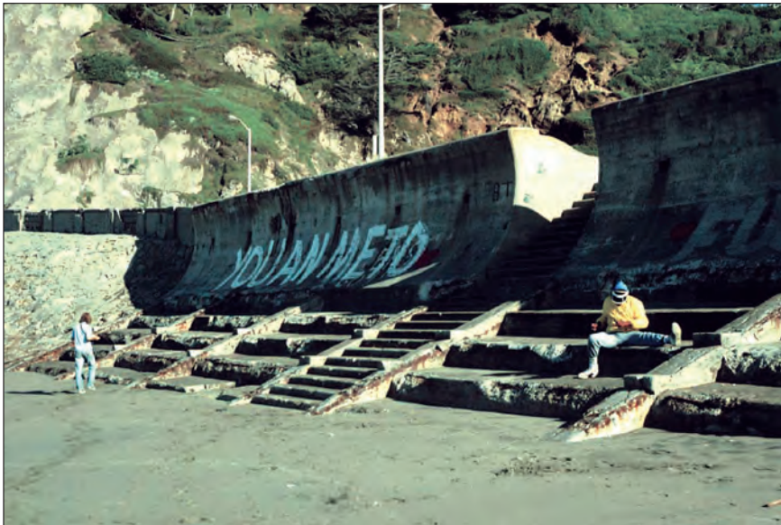
Figure 3. The massive and carefully engineered O'Shaughnessy Seawall in San Francisco was built in 1928 and has stood the test of time.

On the other hand, where riprap or a revetment is placed to protect a bluff, it may reach a height of 15 to 25 ft or more, and extend seaward at a 1.5:1 or 2:1 slope, covering 30 to 50 ft of beach (fig. 4). This placement loss can easily be calculated for any proposed revetment knowing the cross-sectional area and alongshore length, and this impact can then be quantified in relation to how much adjacent or surrounding beach area would still be available. In other words, if the existing beach is very narrow, say 30 ft on average, the riprap may cover the entire beach. Where the beach is wider, riprap may cover only one-third to one-half of the available beach area.