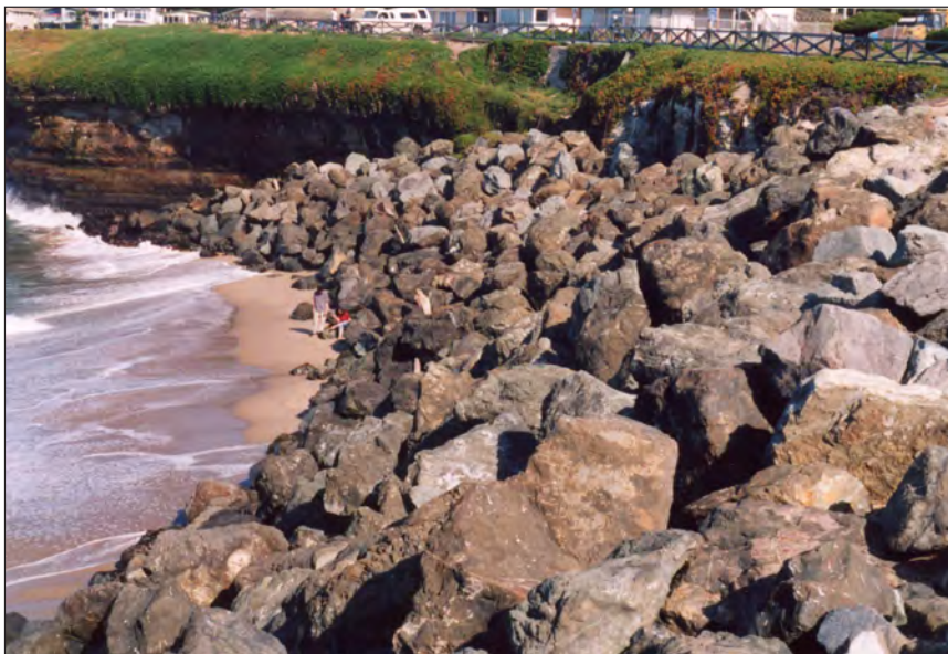
Figure 4. This revetment in the city of Santa Cruz has eliminated the entire beach through placement loss.