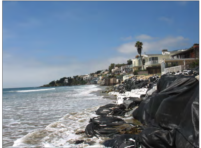
Figure 5. Under winter beach conditions, lateral access is significantly reduced due to the encroachment of these temporary protection structures onto the beach at Malibu.

Coastal armoring has also become an issue as it affects sand supplied to beaches on a regional basis. In California, the great majority (70 to more than 95 percent) of the beach sand delivered to individual littoral cells comes from rivers and streams, with most of the rest coming from eroding cliffs or bluffs (Runyan and Griggs, 2003; Griggs and others, 2005). With a significant reduction in sand transport and delivery due to the construction of more than 500 dams on coastal streams in California (Willis and Griggs, 2003), there is increased concern about the cumulative impacts of additional sand supply reduction.