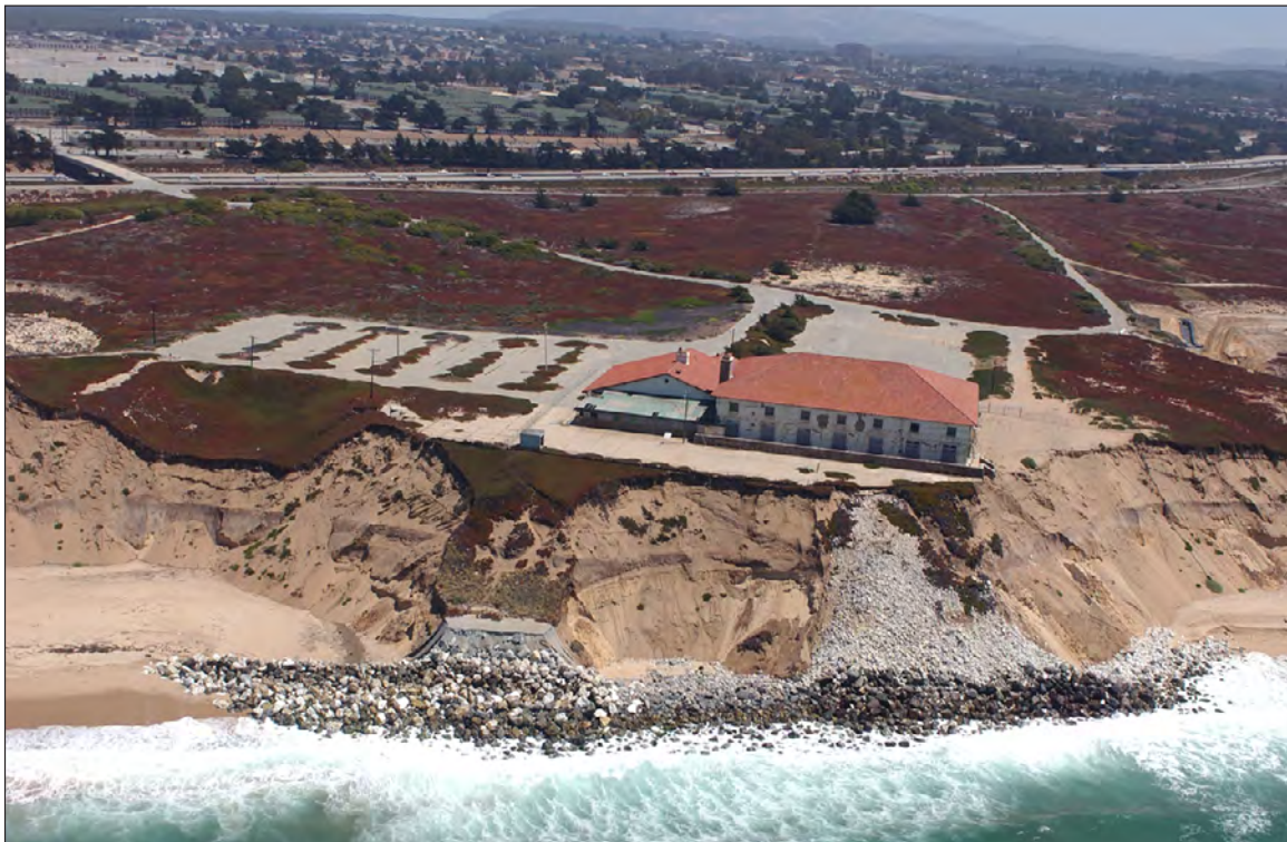
Figure 6. Passive erosion in southern Monterey Bay, California, has eliminated the beach in front of this riprap as the bluffs on either side continue to erode at more than 6 feet per year.

An 8-year field study was carried out along the central coast of California to resolve some of the seawall/beach impact questions (Griggs and others, 1994; Griggs and others, 1997). This is still the only long-term beach-seawall monitoring research that has been reported on in California. The project involved monthly cross-shore surveys of beaches fronting and both up and down coast from several different seawalls and revetments along the shoreline of northern Monterey Bay. The seawall that was monitored for the entire 8-year period was built 75 m seaward of the base of the coastal bluff and is exposed to wave impact every winter. Twelve cross-shore profiles at 60 m spacing were surveyed. These beaches undergo significant seasonal erosion and accretion, but are not experiencing long-term retreat. An additional factor in this area, which may be significant, is the average annual littoral drift rate of about 230,000 m 3 /yr (Best and Griggs, 1991; Patsch and Griggs, 2006).