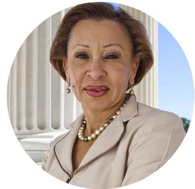
Congresswoman Nydia M. Velazquez

Nydia M. Velazquez represents New York’s 7th district in Congress and serves on the House Small Business Committee. She introduced the Main Street Employee Ownership Act (H.R.5236), which gives the SBA the tools and authority it needs to support small businesses in transitioning to employee ownership and which became law in August 2018. In 2022, seeing limited progress, she then co-sponsored two new bills to increase its impact. The framework of these policies should be studied and built upon by other national, state and local policymakers who are interested in eliminating access to capital barriers plaguing Black business owners who might otherwise embrace employee ownership.