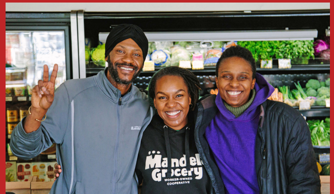
Employee-owners of Mandela Grocery Cooperative