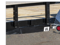
READY RAIL® - CUSTOMIZABLE & ADAPTABLE

Experience the advantage of additional factory-installed fastening solutions, such as D-Rings, Tie-Downs, and Stake Pockets, ensuring versatile and secure cargo management for all your transport needs.