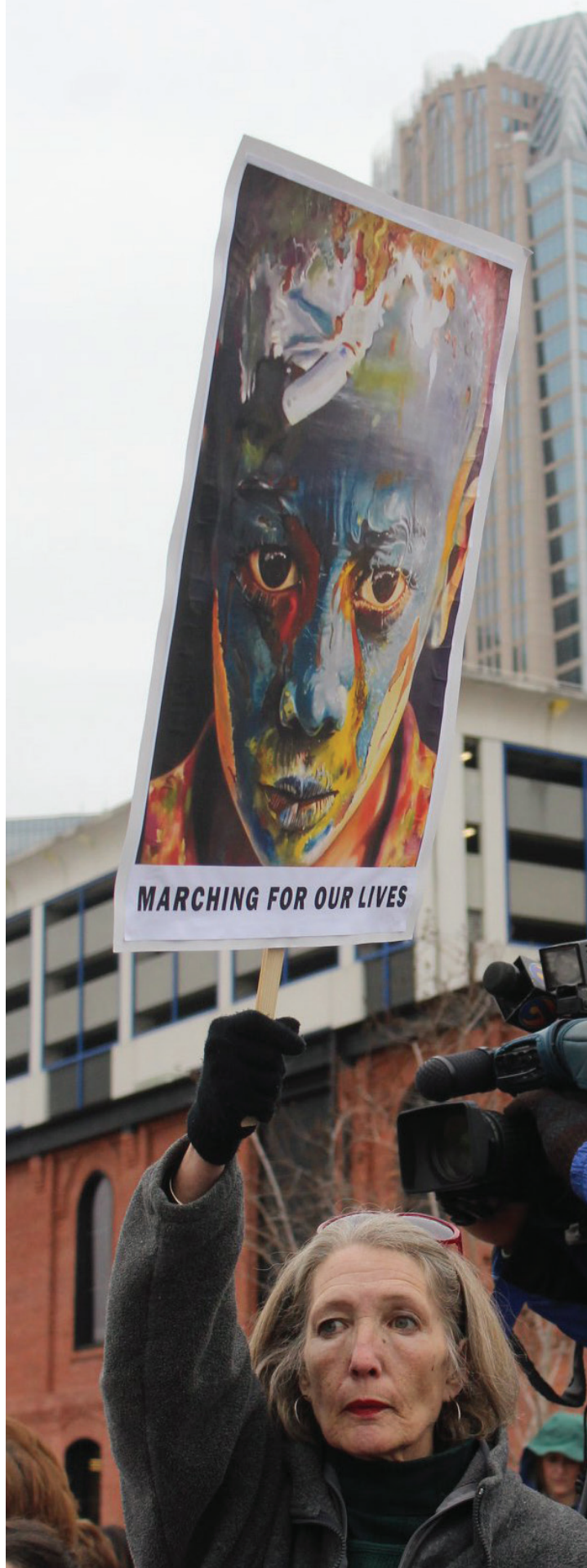
WFAE reporters covered Charlotte's March for Our Lives rally in Uptown on March 24, 2018.