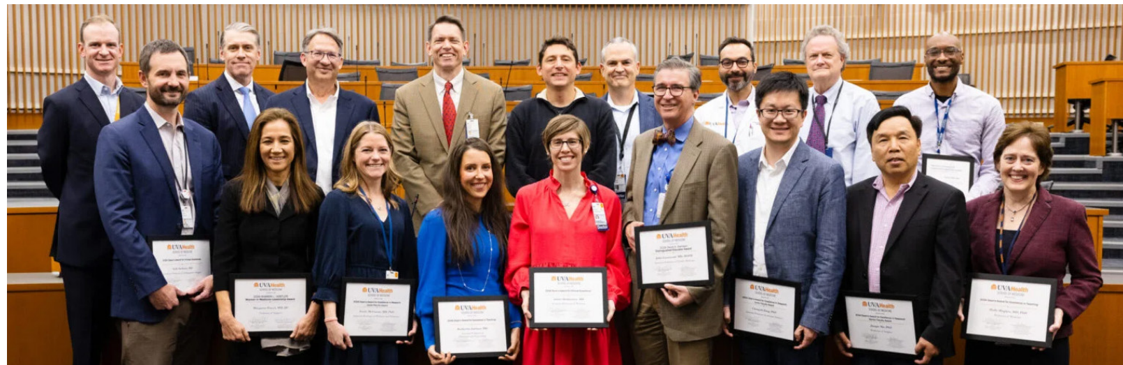
Recipients of 2023-24 School of Medicine Faculty Awards