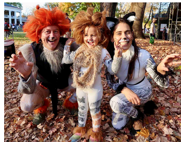
Halloween on the lawn (we are cats from the musical CATS!)