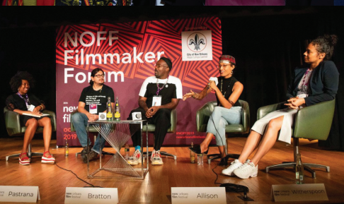
Cherished moments from the 2019 New Orleans Film Festival