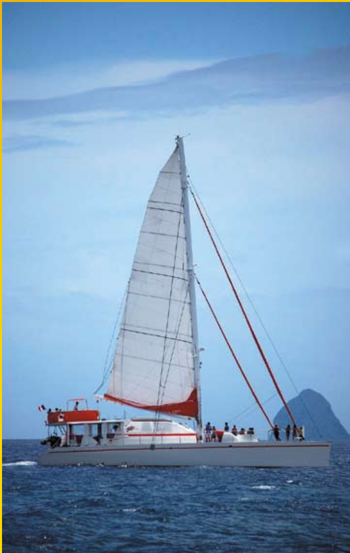
The Catana 50 won "Best Cruising Multihull" in Cruising World Magazine's 2008 Boat of the Year contest for being the best built and most stylish.

Not just for ordinary sailing: the Catana 50 tracks straight through wind and waves.