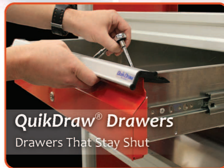
QuikDraw® Drawers Drawers That Stay Shut