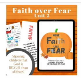
More FAITH Less FEAR: 4-Week Children's Ministry Curriculum (Unit 2 of Faith over Fear) $45