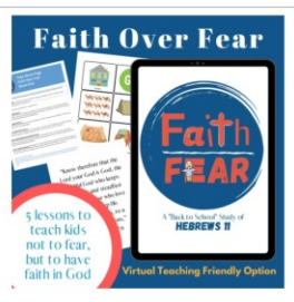
"Faith Over Fear" 5 Lesson Unit for Back-To-School from Hebrews 11