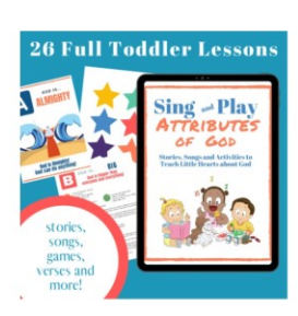
The Ultimate Toddler Bundle: Everything you need to teach age 1-3 about God