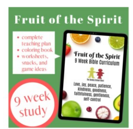
"The Fruit of the Spirit" 9 Unit Curriculum for Kids $57, $90