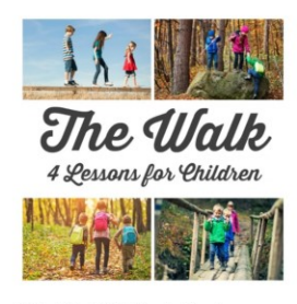
"The Walk" 4 Week Study on Following Jesus $29 $45