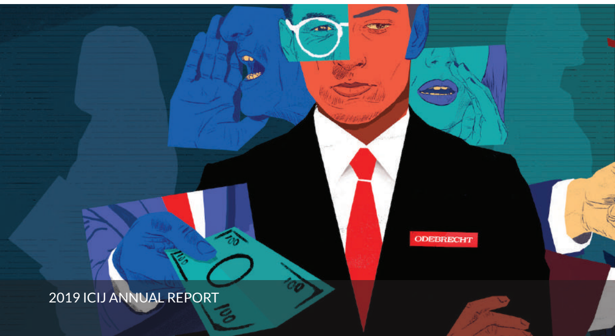
Illustration: Ricardo Weibezahn / ICIJ

ICIJ collaborated with more than 50 journalists across the Americas to examine more than 13,000 Odebrecht documents first leaked to La Posta in Ecuador.