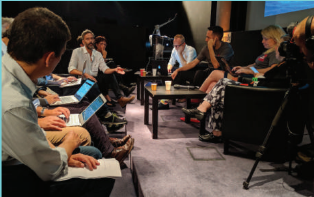
The ICIJ team meets in Paris to discuss an upcoming investigation.