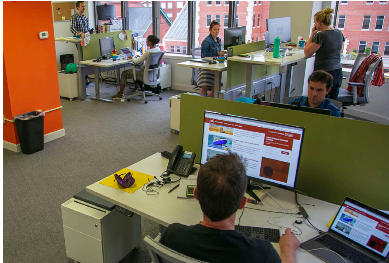
ICIJ's new office in Washington, D.C.

ICIJ's Washington, D.C.-based staff moved into a new office space to accommodate its growing team. Support for the new office was generously provided by the Hollywood Foreign Press Association.