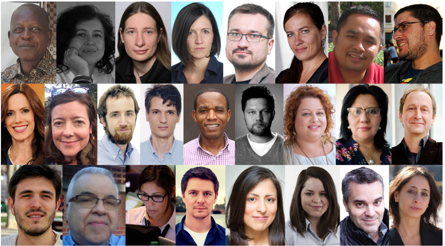
ICIJ added 25 new members to the network in 2017.