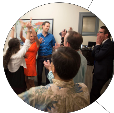
Columbia University announced ICIJ won the Pulitzer in April 2017.

In total, the Panama Papers received 20 major international prizes .