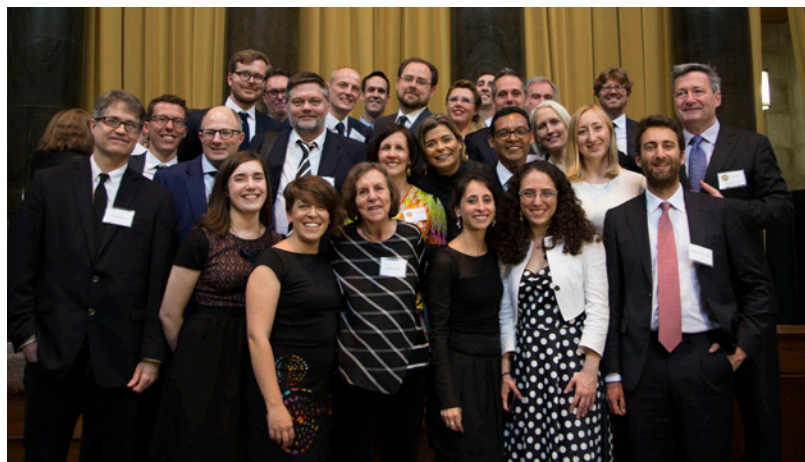
ICIJ staff and partners gather to accept Pulitzer Prize for the Panama Papers investigation.