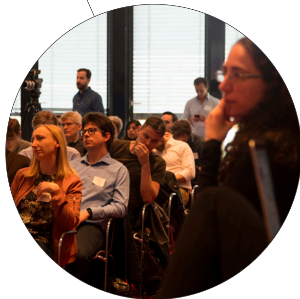
ICIJ team and reporting partners gather in Munich to discuss the Paradise Papers project.