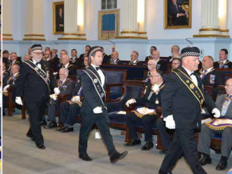
The Color Guard, Brothers of the Knights of St. Andrew, duties completed, exit the lodge room.