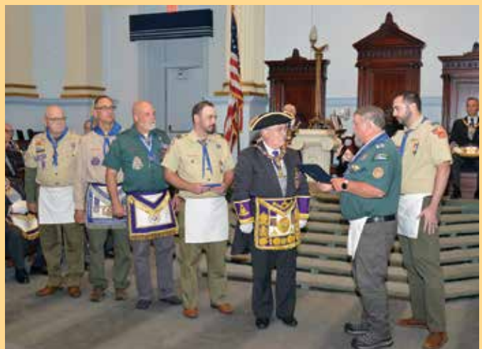
Members of the Scouters Lodge presented the Grand Master with his Daniel Carter Beard Masonic Scouter Award and medal.