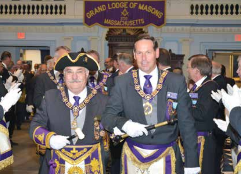
The Grand Marshal escorts the Grand Master into the lodge room.