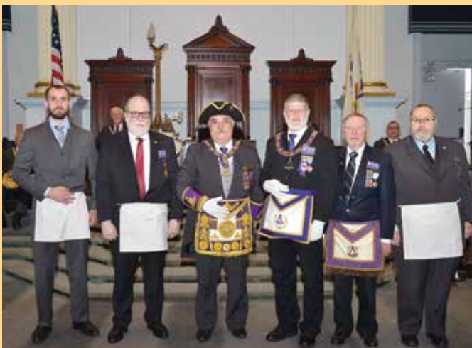
Representatives for the 15th Masonic District donated proceeds from waffle sales at the Family Fun Day to the Brotherhood Fund.