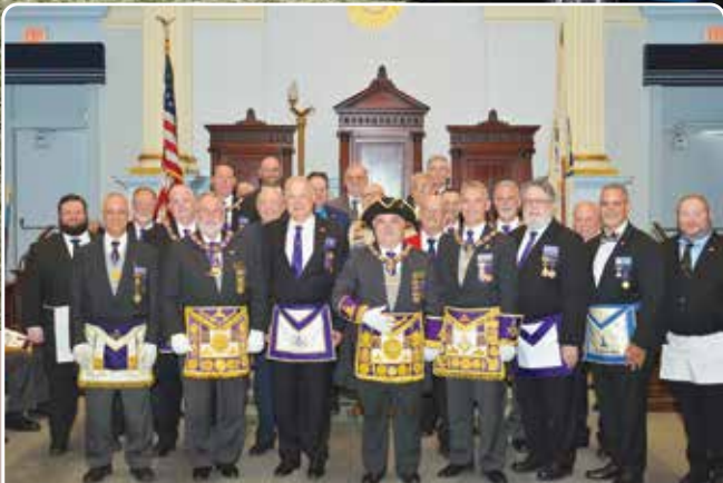
The Committee and Volunteers for Family Fun Day.