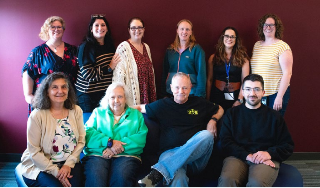
STEM educators who attended the Manchester Tech for Teachers Institute, pictured with program leaders.