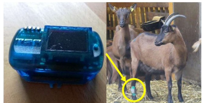
Accelerometer for automatic recording of behaviour.