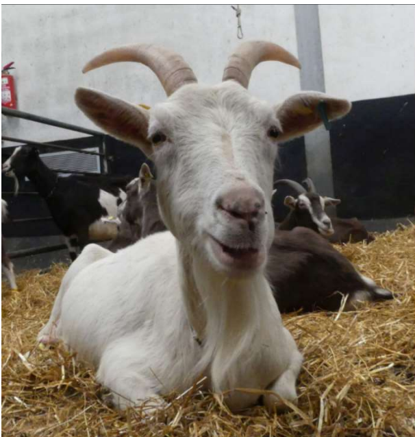
Horned dairy goat in a loose housing system.

The data collection was initially carried out without a concentrate feeder in order to be able to carry out a sequential comparison based on the behavioural data with and without a concentrate feeder. An experimental set-up with a classical case-control design, as is common on experimental farms, was not possible under practical farming conditions.