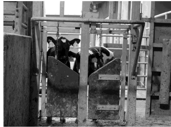
Fig. 1. An automated gate controls the access of calves to the cows.

This system, which is less studied than the free contact and the restricted suckling contact systems, lies in between the two and implies that cow and calf are kept together for around 12 h/d. It was first studied by Veissier et al. (2013) who compared two contact systems; free contact and part time contact during daytime only, hereafter referred to as half day contact. The authors showed that the calves in a half day contact system had high weight gains not only pre-weaning, but also post-weaning (0.95 kg/d). The positive effects on growth during and after weaning were attributed to the fact that calves in the half day contact system were accustomed to being separated from the dam and were less dependent on the dam. When integrating a milk feeder into a half day contact system, calves that were trained to use the feeder during the suckling period continued to use it once they were separated from the dam (Johnsen et al., 2015a). As a result, these calves were nutritionally more independent from the dam at separation such that the calves maintained very good weight gains during separation and weaning.