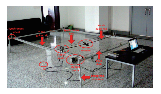
Fig. 1. The prototype system.