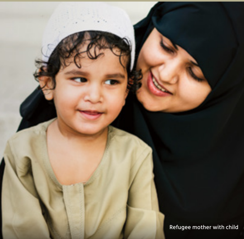
Refugee mother with child

guided by strict safety protocols. With great team effort, we pivoted rapidly to use more technology tools including Zoom videoconferencing for individual case management and orientation; DocuSign for intakes and documentation; YouTube channels for module learning; and Xavus CRM active center for client engagement, communication and follow-up.