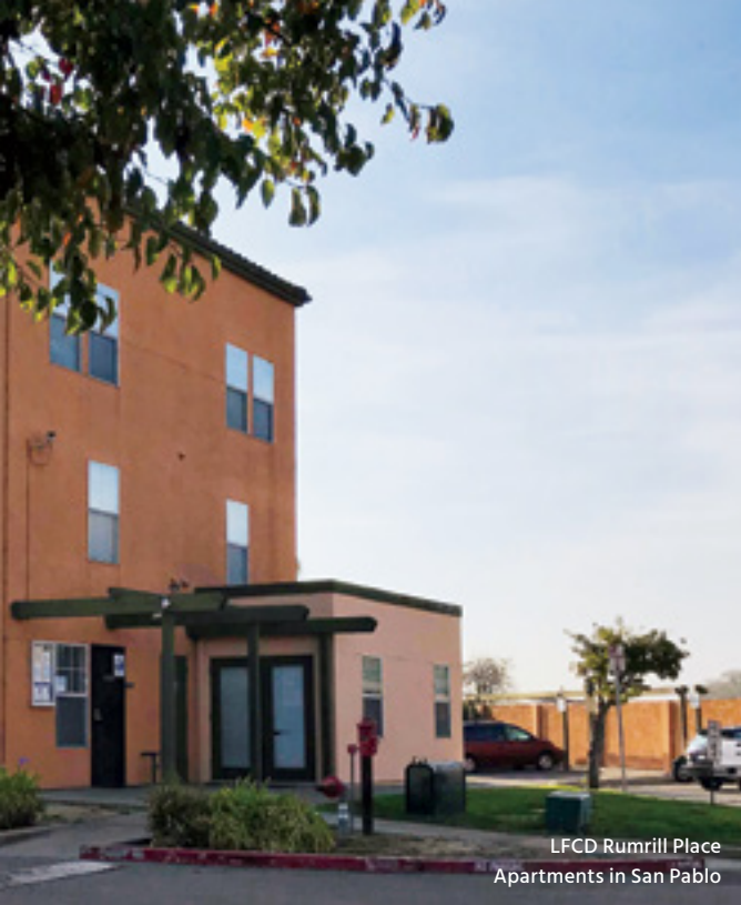
LFCD Rumrill Place Apartments in San Pablo