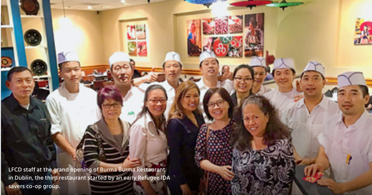
LFCD staff at the grand opening of Burma Burma Restaurant in Dublin, the third restaurant started by an early Refugee IDA savers co-op group.

homeowners weathered the financial crisis even as many of their neighbors were losing their homes.