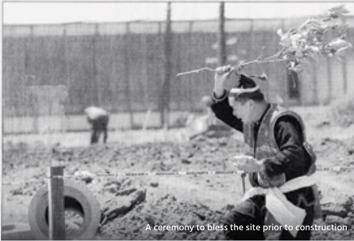
A ceremony to bless the site prior to construction