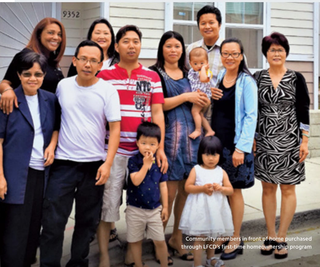
Community members in front of home purchased through LFCD's first-time homeownership program

Because of the good practices learned through the first-time homeownership program and the nonpredatory loans that the program helped its clients secure, LFCD's