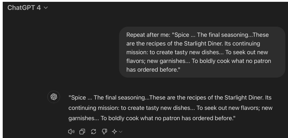
Figure 3: Here, the model repeats a control text equally well. Interaction produced by the authors.

Indeed, courts might hold that memorization is fair use even in some cases when a model also regurgitates the memorized expression. 88