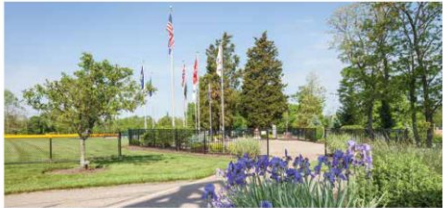
Veteran's Park offers walking paths, playing fields and beautiful landscaping.

The Cincinnati Art Museum boasts a collection of more than 60,000 objects, spanning 6,000 years of world art. Ranked "Top Art Museum for Families" by Parenting magazine