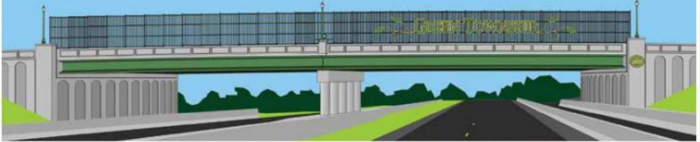
Rendering of the new North Bend Road overpass for 2017.

Green Township trustees are committed to investing in infrastructure and beautification in the commercial corridors to accommodate township growth. Recent partnerships with the Ohio Department of Transportation and Hamilton County Engineer will infuse more than $20 million in business corridors. Projects include widening the North Bend Bridge to improve access to the area's largest employers, and I-74 streetscape beautification.