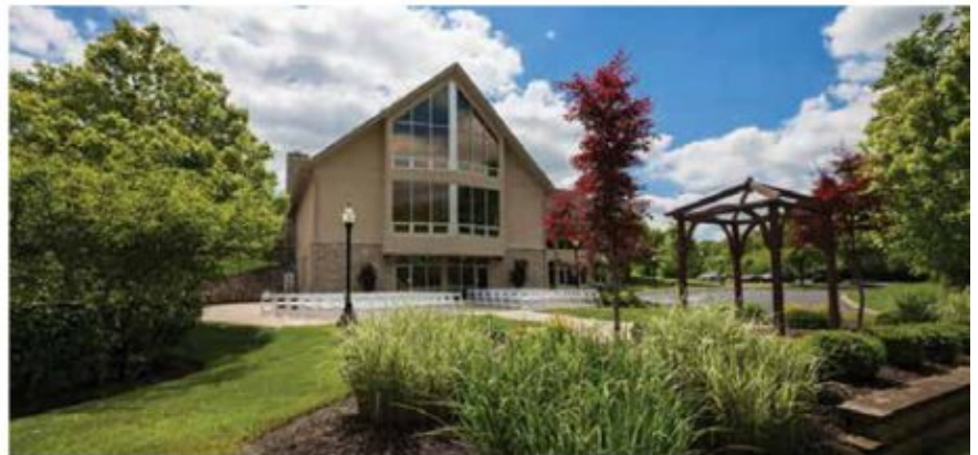
Nathanael Greene Lodge and Reception Hall is the perfect site to host your next event.