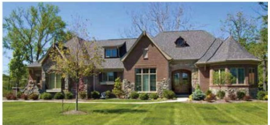
Greenshire Commons Estate Homes