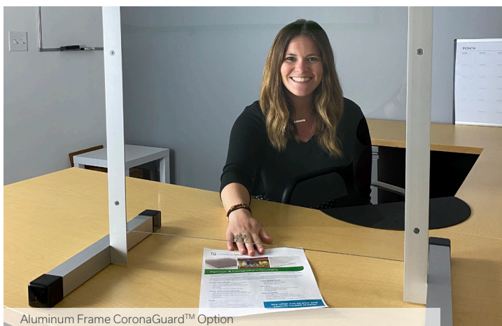
Aluminum Frame CoronaGuard™ Option