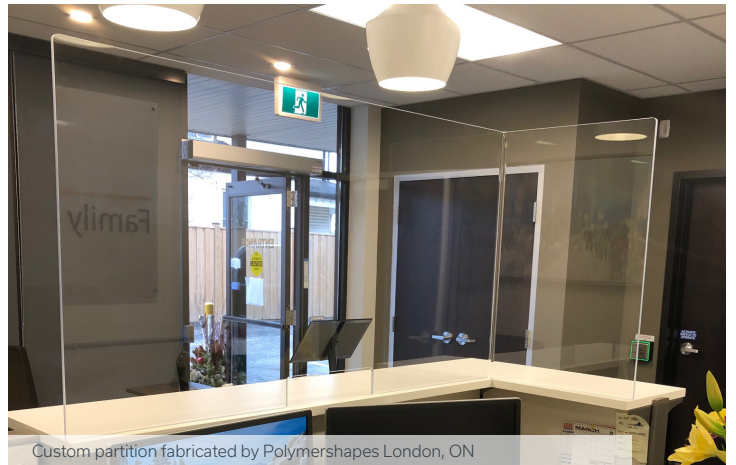
Custom partition fabricated by Polymershapes London, ON