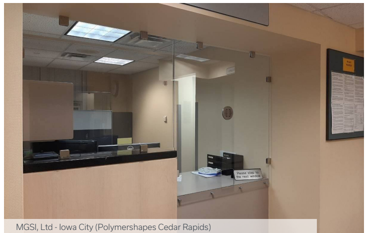
MGSI, Ltd - Iowa City (Polymershapes Cedar Rapids)