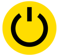
ENERGIAN- SÄÄSTÖ VKO