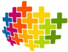
ENERGY EFFICIENCY agreements