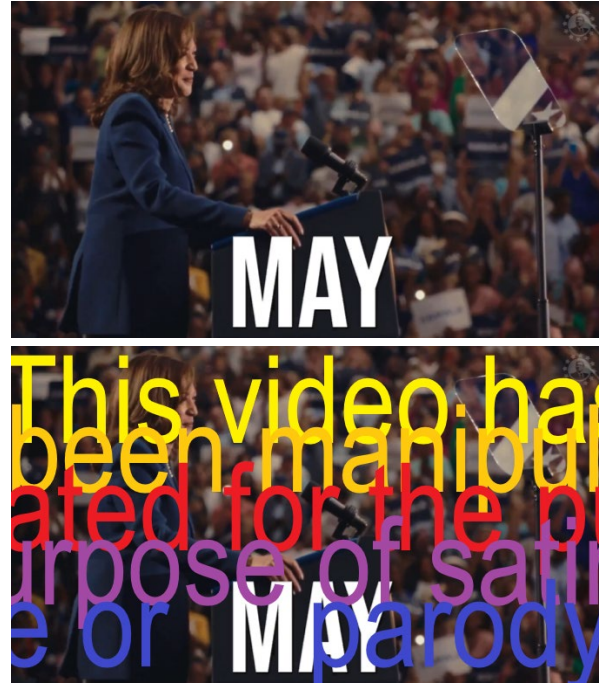
Figs. 1 & 2: A still image from Plaintiff’s video and an illustrative effort to include the mandatory labelling.

1 98. The only possible defense for the 2 Plaintiff under AB 2839—the labeling safe 3 harbor—only applies when the disclosure text 4 “appear[s] for the duration of the video” using a 5 font size “no smaller than the largest font size of 6 other text appearing in the visual media.” Even if 7 Kohls were willing to submit to California’s 8 attempt to compel his speech (he’s not), it would 9 be literally impossible to include such a disclaimer 10 in the video demonized by Gov. Newsom. The text 11 Kohls included in the video—necessary to allow 12 followers to enjoy his video from their cellphones 13 even without sound—would require the disclaimer 14 text to be so large that it could not fit on the screen.