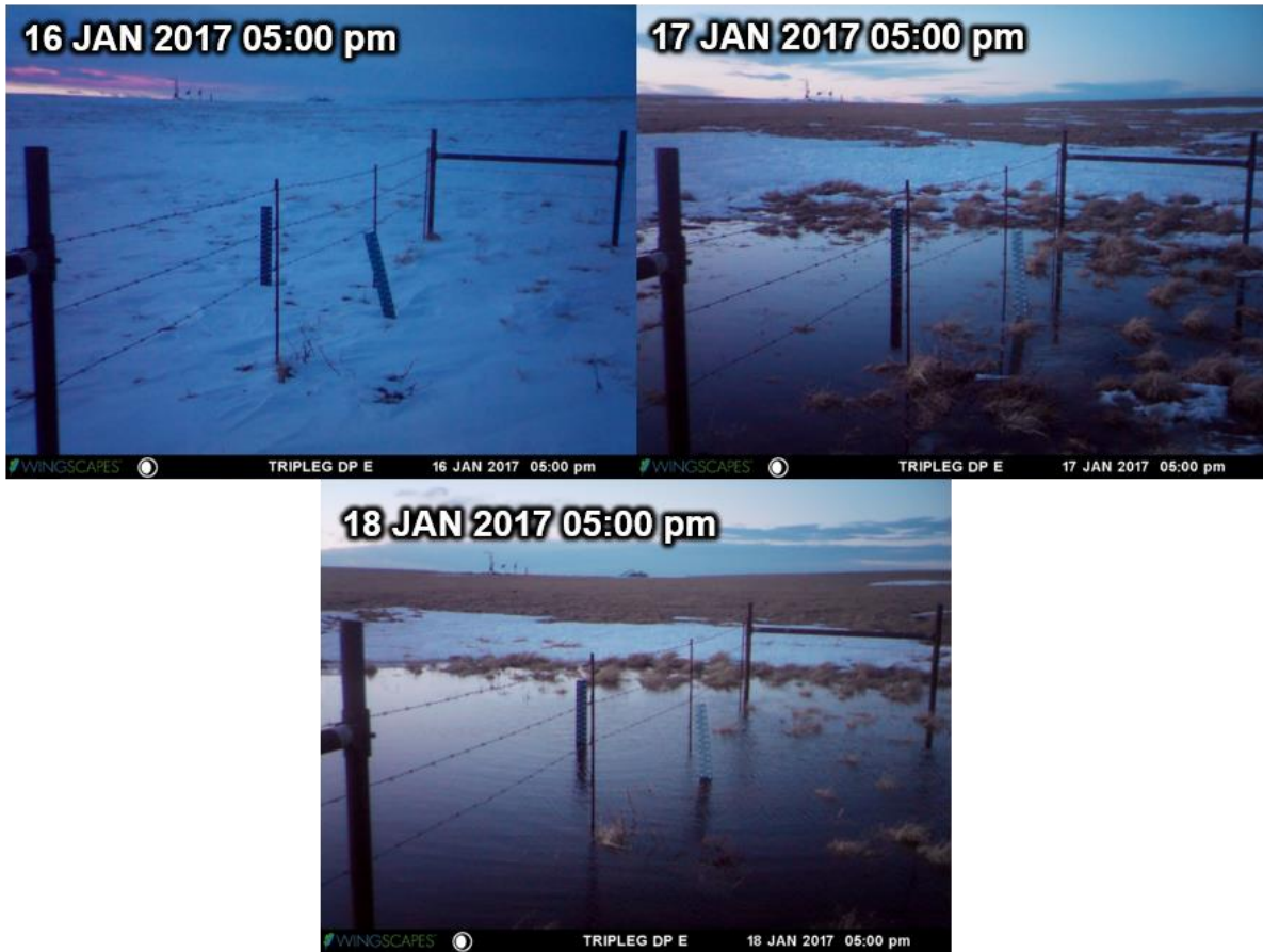
Figure S.1 – Time-lapse photos showing snowcover depletion and only lower parts of the slopes retained snow by January 17 while ponding and water inputs continued throughout January 18 despite limited amount of snow left.