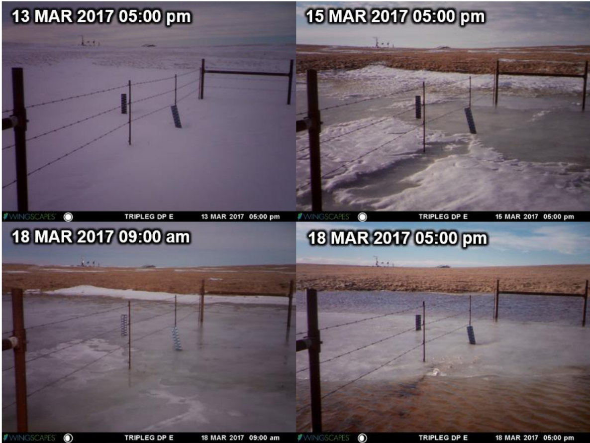
Figure S.3 – Time-lapse photos showing snowcover depletion and most of snowcover disappeared on March 14-15 while pond level increases throughout March 18 despite little snowcover left.