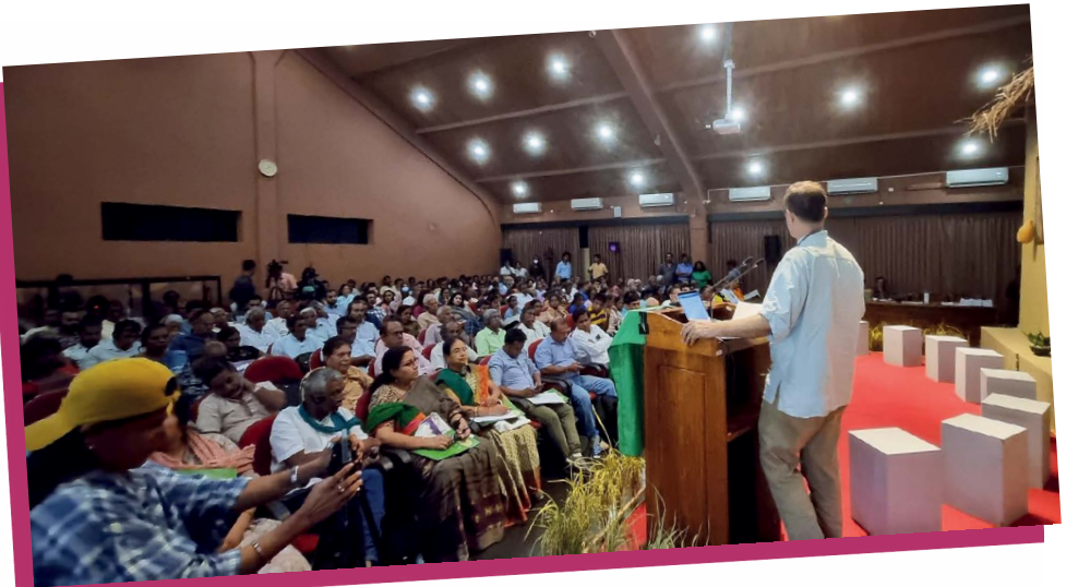
GRAIN staff presents at the MONLAR National agroecology forum, Sri Lanka