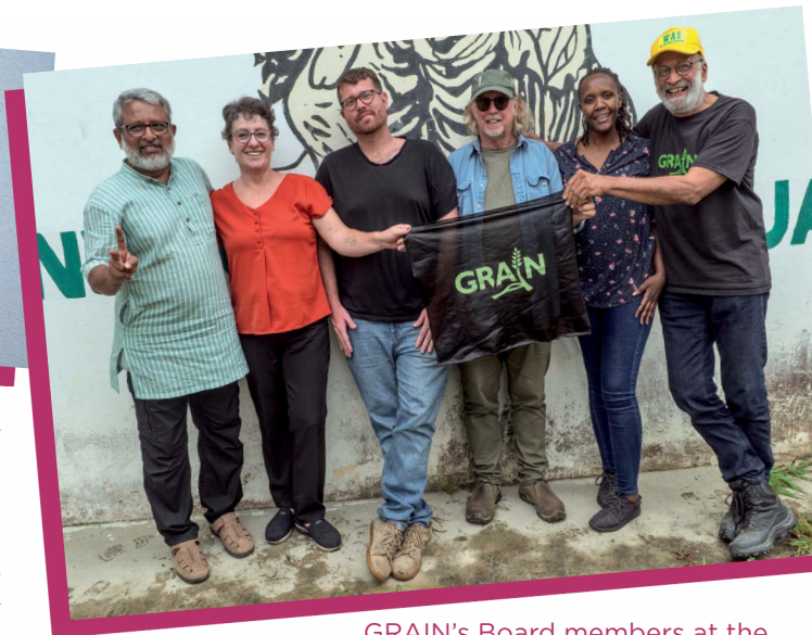
GRAIN's Board members at the Instituto Agroecológico Latinoamericano María Cano in Colombia.