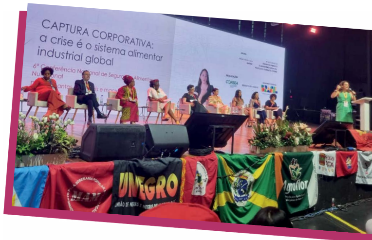
GRAIN staff speaking at the National conference on food and nutritional security, Brazil

Another area of growing corporate control is industrial animal farming. This past year, we got more involved in the Stop Financing Factory Farming (S3F) campaign in Latin America as well as an informal regional collective of communities affected by intensive livestock. We published an article on Asia’s pig pandemic , contributed to cases in Ecuador and featured this topic in the issue of the Nyeleni newsletter on emerging diseases and factory farming .