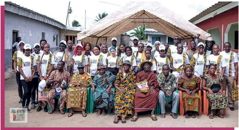
Field visit by ACJC members in Taboth, Ivory Coast