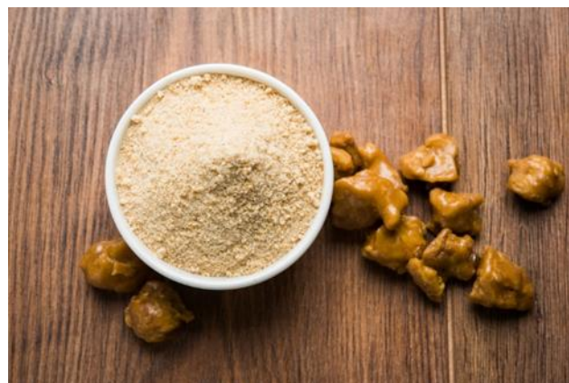
Figure 1 Ferula asafetida (Hing)

family. 4 Hing is derived mainly from the Ferula asafetida and F. alliacea species of the genus Ferula .