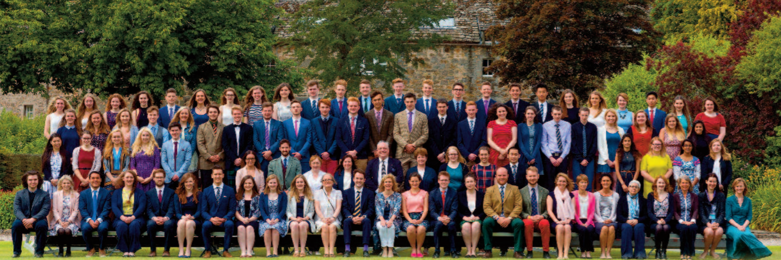
Gordonstoun International Summer School Staff. Our excellent staffing ratio ensures careful attention across the wide range of activities.