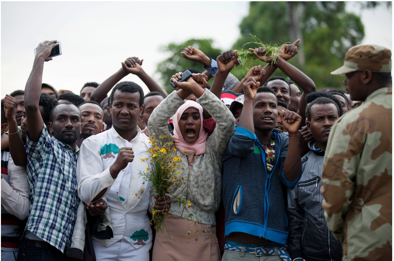
Residents of Bishoftu crossed their wrists above their heads as a symbol for the Oromo anti-government protesting movement during the Oromo new year holiday Irreechaa in Bishoftu on October 2, 2016.

The boundary between diasporas and in-country activists is often blurry. In many cases, the activists must flee the country when their freedom or life is in danger and join the diaspora. In some cases, we also observed the opposite: diaspora members traveling to their country of origin to support the movement, as they did in Congo-Brazzaville and Sudan. Generally, a close connection between the diaspora and in-country activists is beneficial for the movement as their resources are complementary: diasporas have more money and freedom of expression; in-country activists are usually seen as more authentic and connected to the population, but they face a much higher risk of repression. Combining the advantages of both, as the activists did in Ethiopia and Sudan, can have a significant effect on movement growth. At the same time, diasporas that have weak connections to activists inside the country have little to no influence on the events there. This is the case in many of the formerly communist countries in our study where members of the diaspora are only recently developing a sense of their potential for collective action.