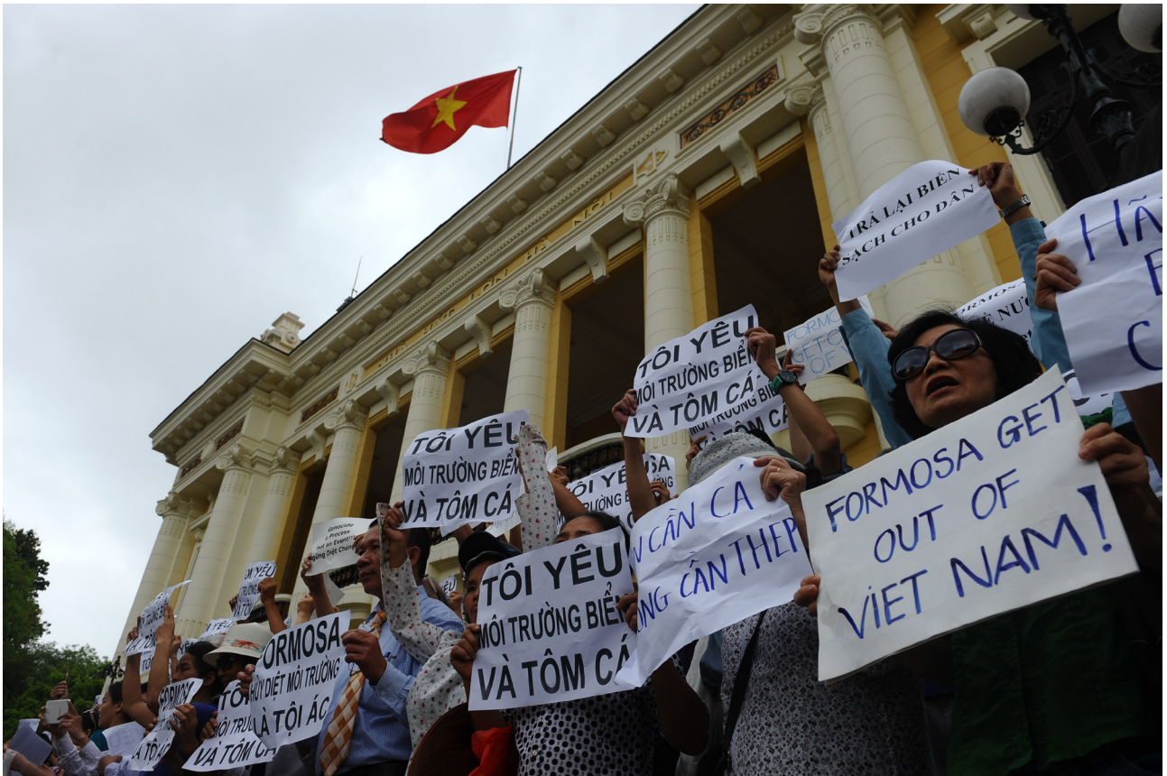
Vietnamese protesters demonstrate against Taiwanese conglomerate Formosa during a rally in downtown Hanoi on May 1, 2016.

own laws was useful in furthering the mobilization. In places where civic and political organizations are heavily regulated (Belarus, Kazakhstan, and Russia), working within the system meant attempting to register parties and candidates only to be denied on procedural grounds. In countries like Eswatini where there is a tradition of state institutions being responsive to petitions, attacks on those delivering petitions fueled public anger. In these cases, the attempts to work within the system took place when the mobilization had already begun to scale up and the state's actions seem to have increased public perceptions of government hypocrisy and aided movement organizers' framing efforts. Procedural repression when the public is paying attention is particularly problematic because it demonstrates that the system is rigged.