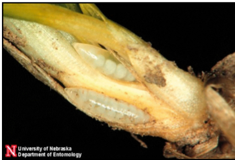
Figure 22.4. Larval Hessian flies.