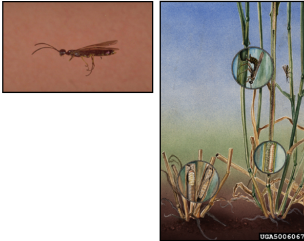
Figure 22.1. Wheat Stem Sawfly. (Illustration courtesy of Art Cushman, USDA. Property of the Smithsonian Institution, Dept. of Entomology, Bugwood.org )

Early USDA-ARS surveys detected sawfly in western South Dakota at ~10%; however, more recent surveys have found infestations up to 60% in Northwestern South Dakota. Grower surveys in Montana in the mid 1990s estimated the economic impact of wheat stem sawfly at $25 million per year. In North Dakota, a 2009 survey found crop loss due to wheat stem sawfly ranged from 10 to 25%; estimated crop losses between $25 to $70 million dollars. Wheat stem sawfly is a damaging pest of wheat affecting both yield and quality. Increased incidence of this pest in South Dakota is of concern.