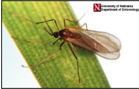
Figure 22.3. A Hessian fly on a leaf.

Hessian fly has been increasing in many Midwest states and has been found in South Dakota, though damaging populations are not common (Fig. 22.3 and 22.4). It is thought that recent population increases are related to increased adoption of no till.