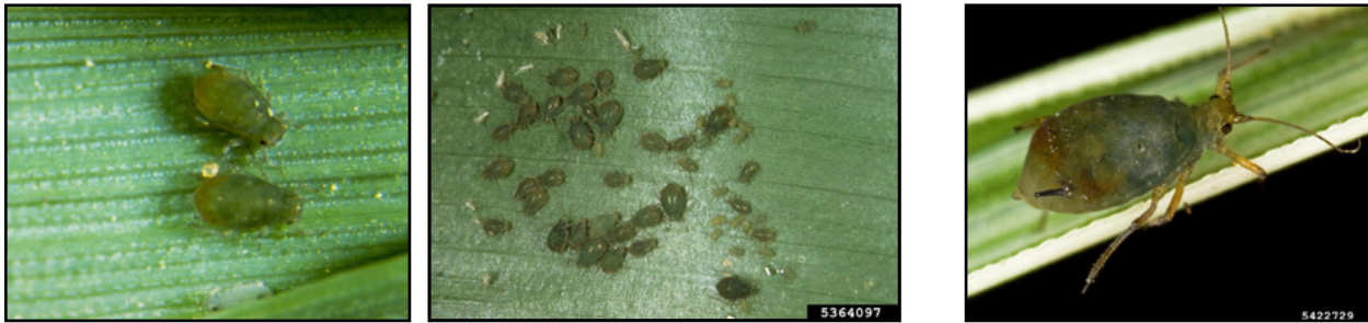
Figure 22.7. Bird Cherry Oat Aphid.

This species is one of the most common and damaging species in South Dakota and the vector of the barley yellow dwarf virus. Additional information about this disease is available in Chapter 23.