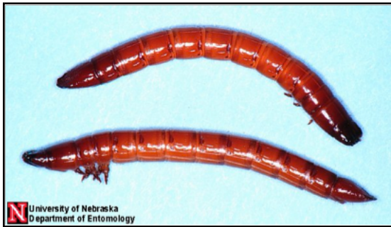
Figure 22.6. Wireworms, larvae of elaterids.

Wireworms may require several years to complete their life cycle and are the larval stage of the click beetles.