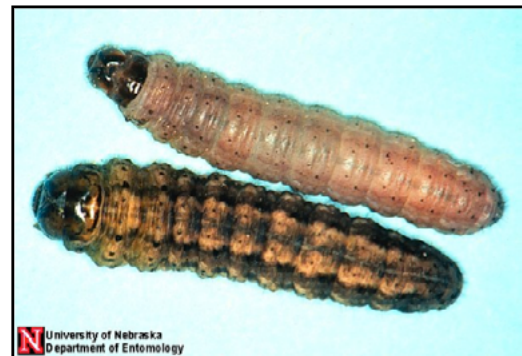
Figure 22.2. Pale western cutworm, top and Army cutworm, bottom.

Pale western cutworm larvae begin feeding later in the spring than the army cutworm and are therefore primarily a pest of spring wheat. Dry weather favors the successful development of the pale western cutworm. However, spring rains are unfavorable to newly-hatched pale western cutworm larvae. The risk of an outbreak decreases with increasing number of wet days, > 0.25 inch of precipitation (Hein et al. 2006). If May and June have fewer than 10 days with 1/4" or more of rainfall, then pale western cutworm populations can be expected to increase. If May and June have more than 15 'wet' days, then cutworms will almost totally disappear. Rainfall events of more than 1/4" tend to drive the cutworms to the soil surface, which exposes them to predation and parasitism.