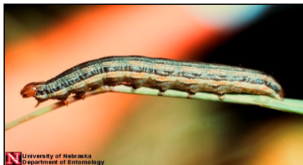
Figure 22.5. Armyworm larva.

The armyworm is unable to survive South Dakota winters. They overwinter in the southern portion of their range, migrating north in early summer when environmental conditions are favorable. Pheromone traps can be used to monitor the moth's presence. Female moths deposit eggs in rows or clusters on the lower leaves of various grass crops. Dense grassy vegetation is preferred for oviposition.