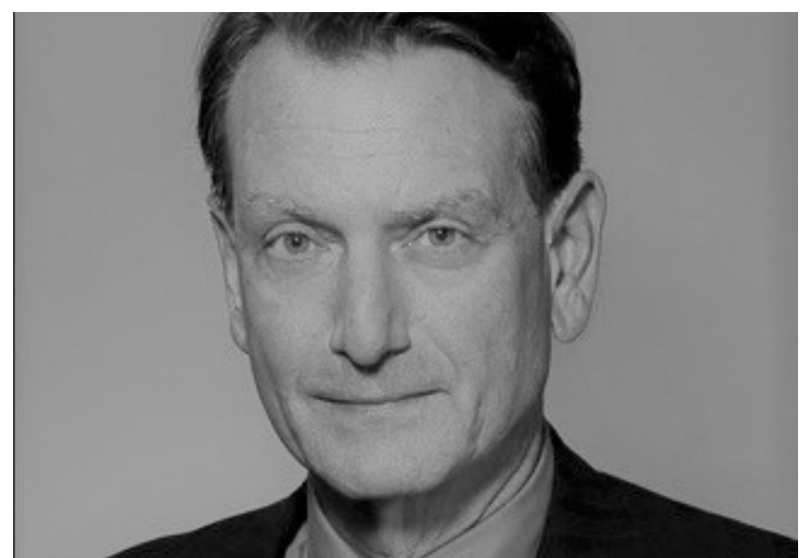
Spotlight Contribution by Marc Rotenberg on the Law of Artificial Intelligence and the Protection of Fundamental Rights: The Role of the ELI Guiding Principles