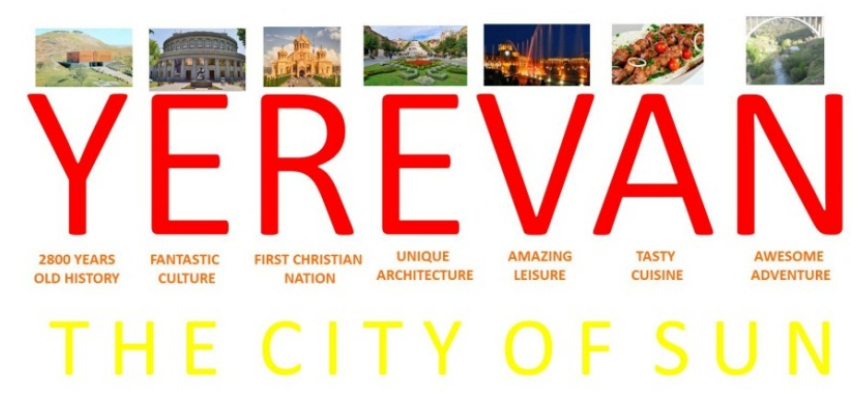
Figure 6. Touristic brand of Yerevan