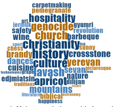
Figure 1. Main associations with Armenia

(44%), biblical land (42%), wine (42%), Edjmiatsin (40%), brandy (39%), Lake Sevan (39%), Gyumri (24%), etc. These words were analysed via Word frequency query of NVivo software, and the results are shown in Figure 1.