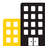
Local Education Agency