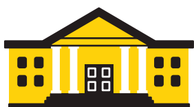
US Department of Education