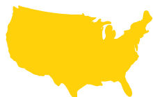
State Education Agency (SEA)