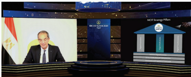
Egypt hosts the sixth annual International Data Corporation (IDC) CIO Summit in September 2020.