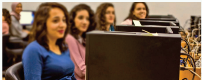
ICT for Women Initiative: MCIT is carrying out capacity building programs to empower Egyptian women and girls to use various technologies in all aspects of life. During the COVID-19 pandemic, MCIT organized two webinars to foster women's online research capabilities.