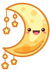
M oo n