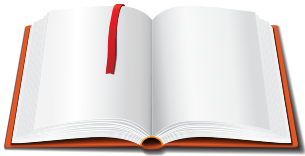
B oo k