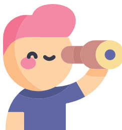
L oo k