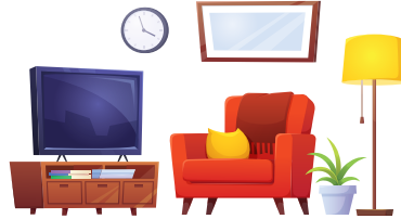
R oo m