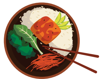
F oo d