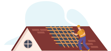
R oo f