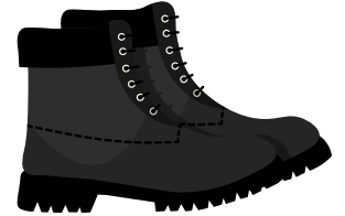
B oo t