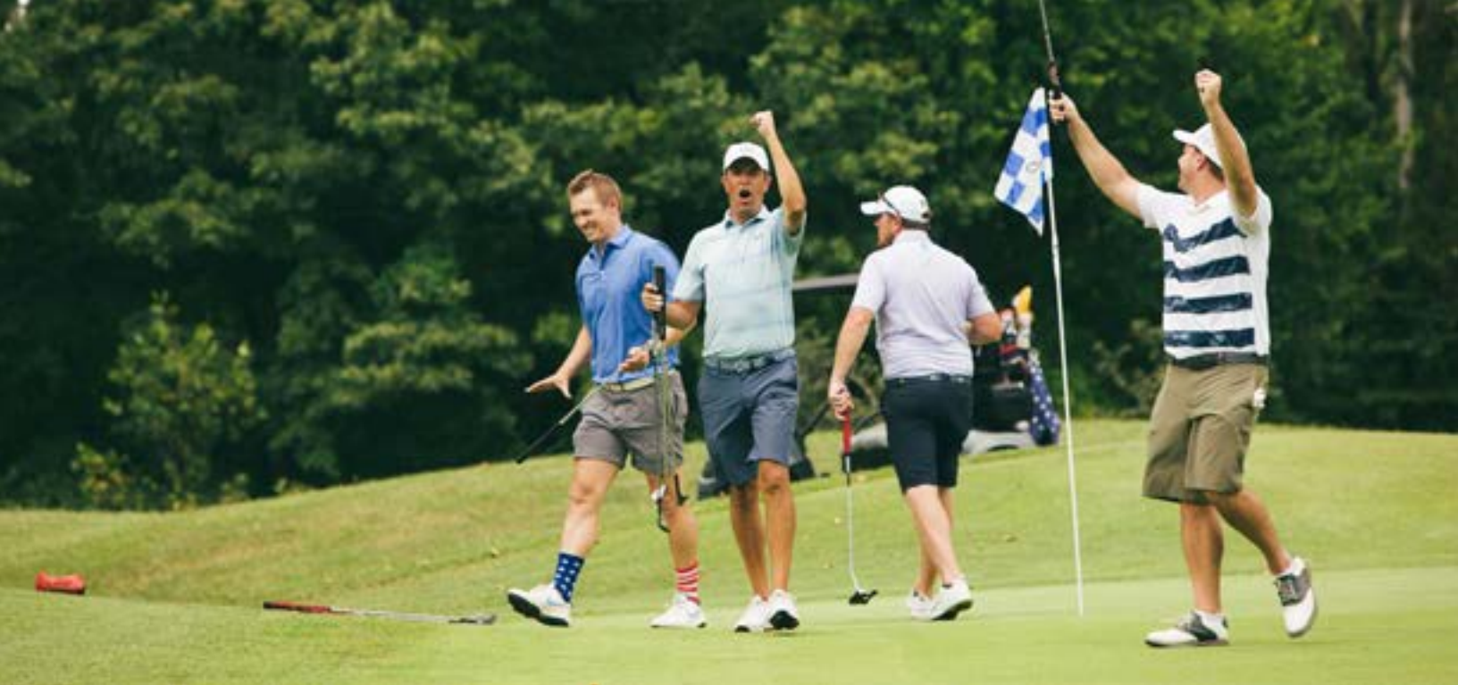
Swing For A Cure - St. Louis (August 2021)