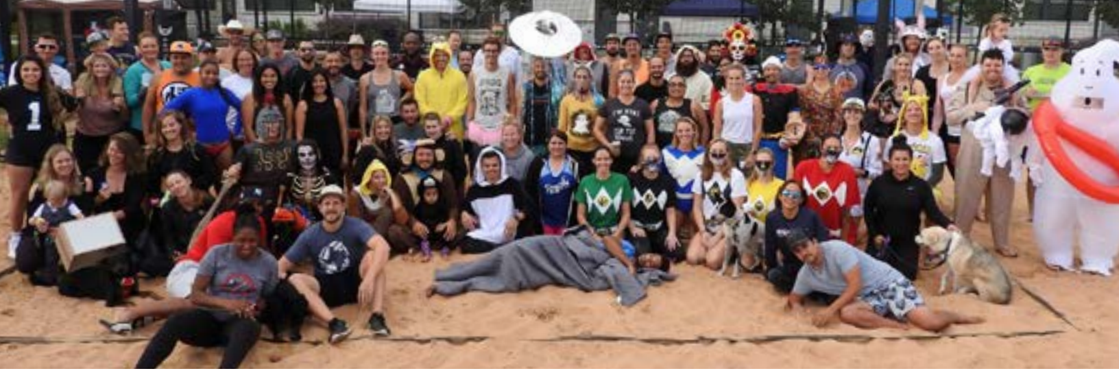
JoeStrong's Volleyball Tourney, Austin, TX (October 2021)