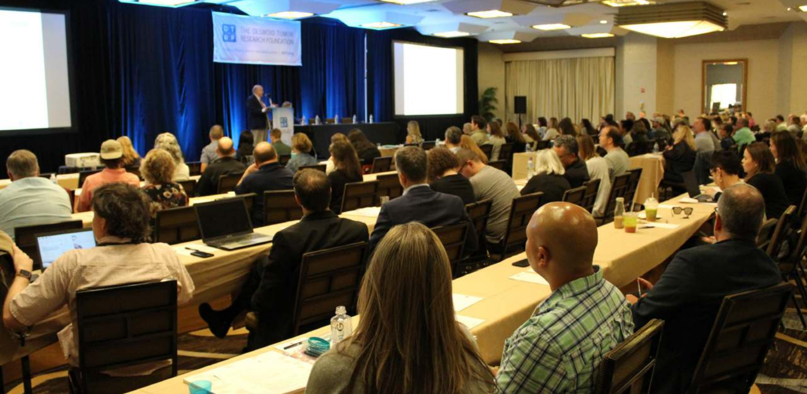
2019 Annual Patient Meeting in Philadelphia