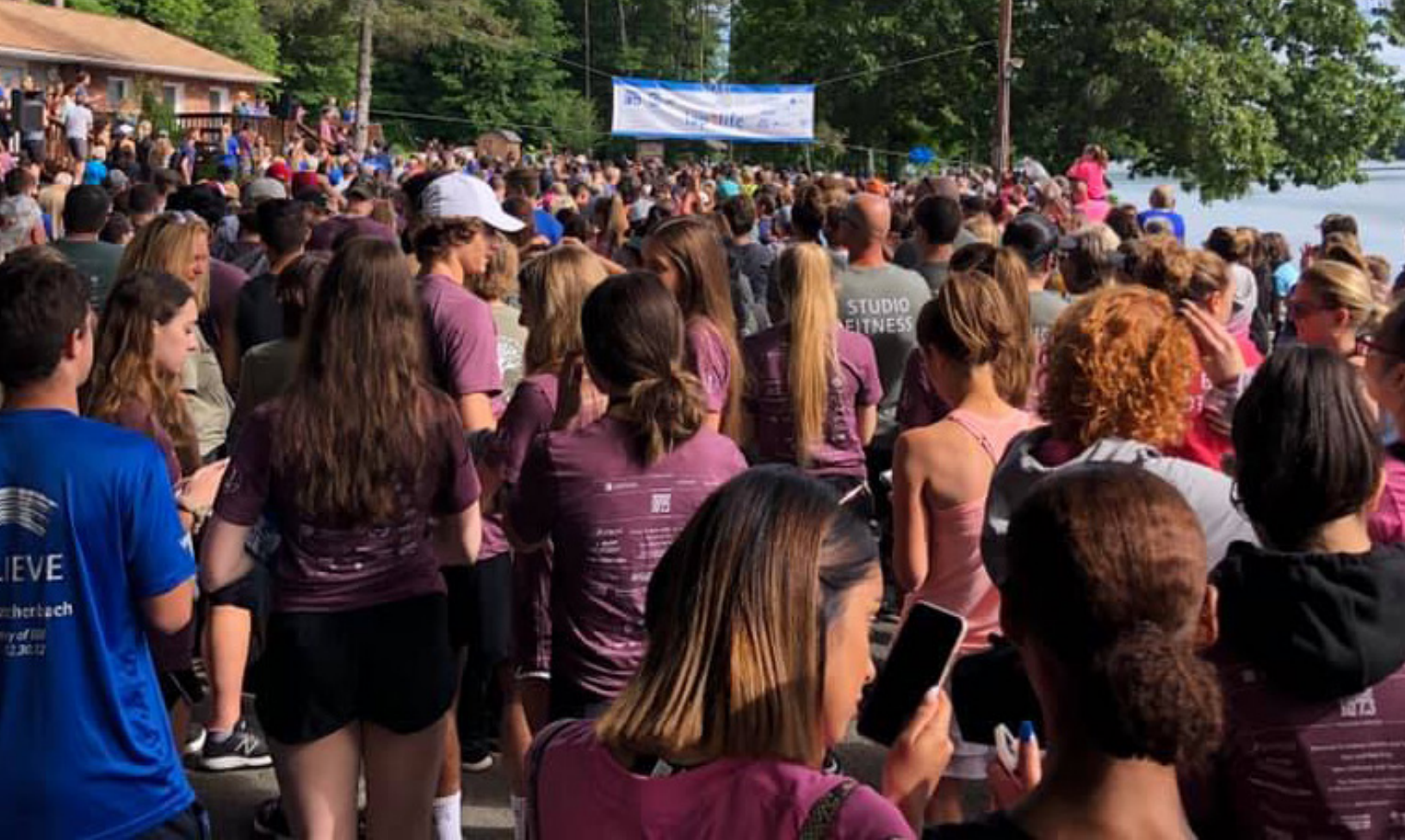
2019 Lap4Life Fundraiser in Newburgh, NY