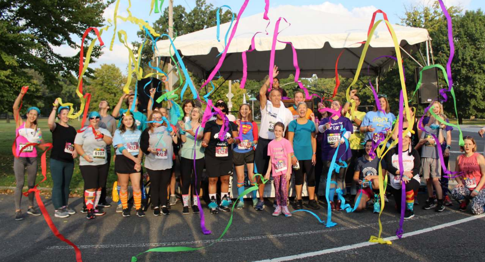
Patients celebrate Running for Answers' 10th anniversary in Philadelphia!