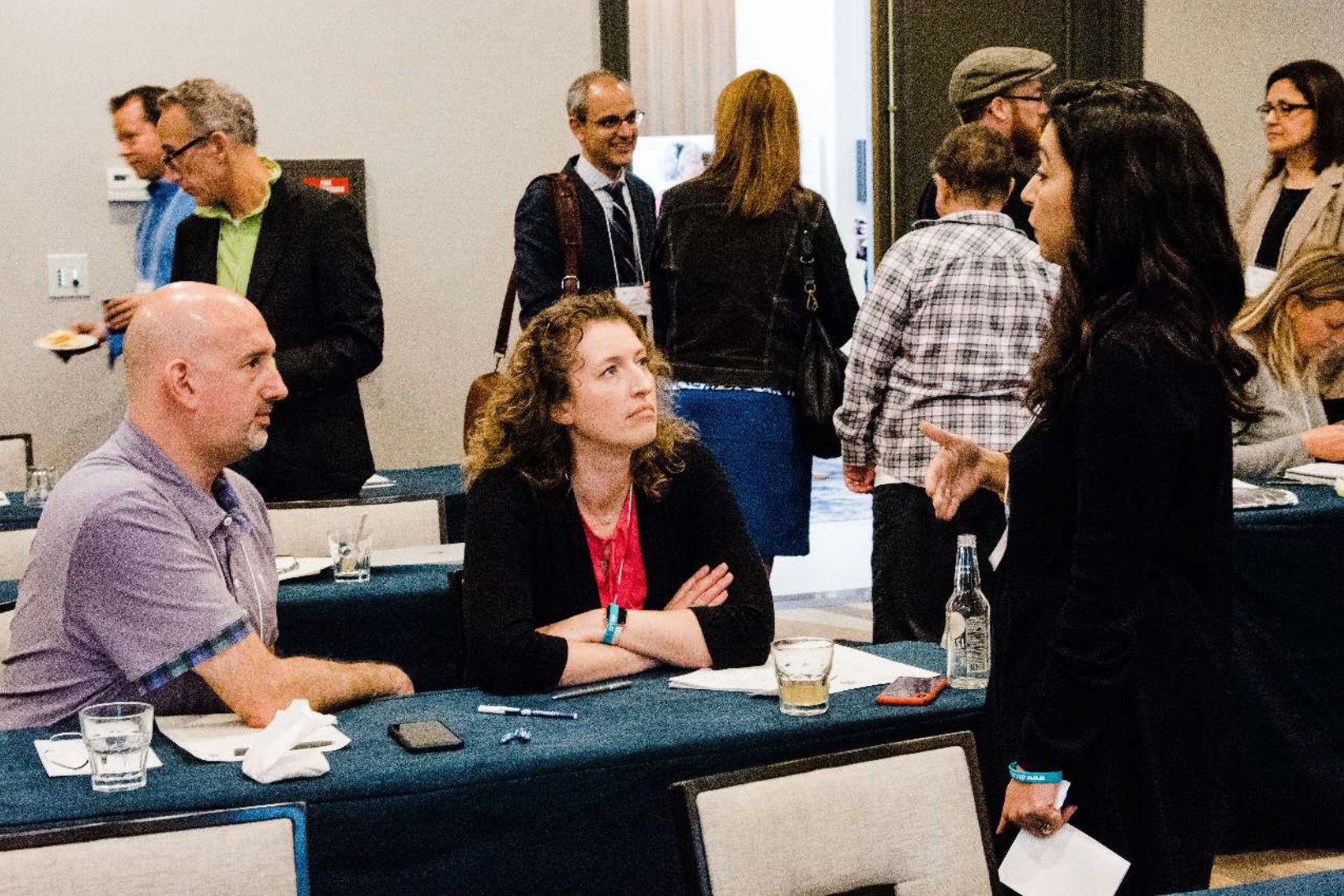
Patients mingle at the 2019 Regional Patient Meeting in South San Francisco