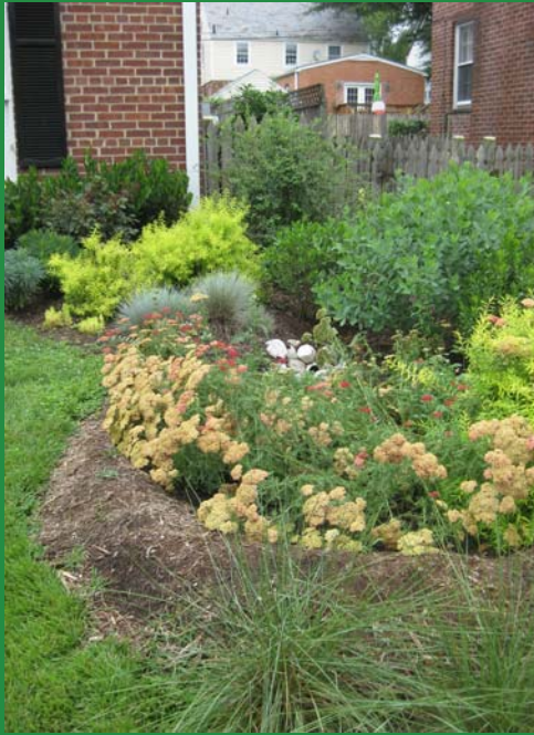
Mature rain garden