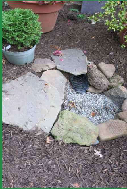
Downspout inlet to rain garden