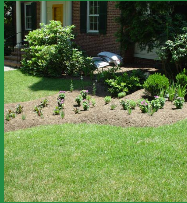
Newly-planted rain garden