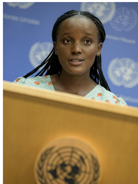
Ugandan climate activist and UNICEF Goodwill Ambassador Vanessa Nakate briefs reporters in New York on her recent trip to the Horn of Africa.

In other contexts, such as in the Pacific, planned relocation has become a last resort strategy to address current and projected climate impacts such as sea-level rise. 31 For example, the Fijian government identified over 40 low-lying coastal villages for planned relocation, 32 and the government of Kiribati purchased land in Fiji in anticipation of its population's future needs. In instances where communities relocate collectively, either in a forced or voluntary manner, women and men may have different experiences of relocation. Following the relocation of the Vunidogoloa community in Fiji to an area further inland, men, who were primarily engaged in agriculture, did not need to change their livelihoods; women, who used to fish, were now further away from the sea meaning that fishing would involve a longer time commitment. 33 This shows how gender roles influence patterns of mobility and relocation experiences.