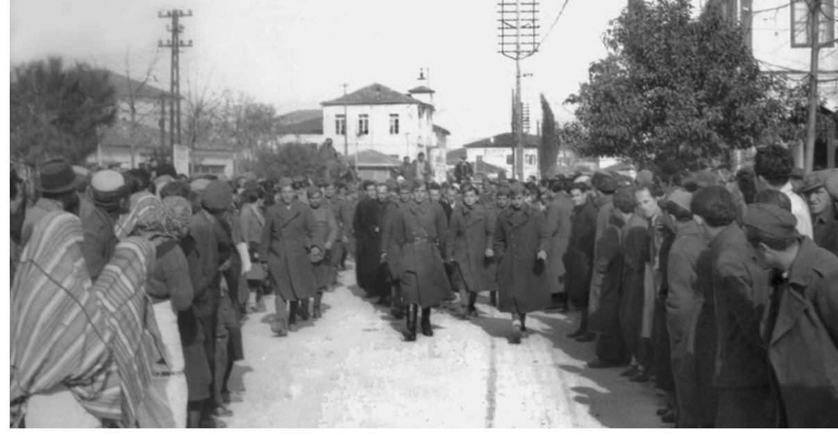
Catholic priests judged as members of the organization Bashkimi Shqiptar (Union of Albanians) heading the courtroom, Shkoder 1945.

they thus reconsidered their stance towards recognizing the Albanian government.