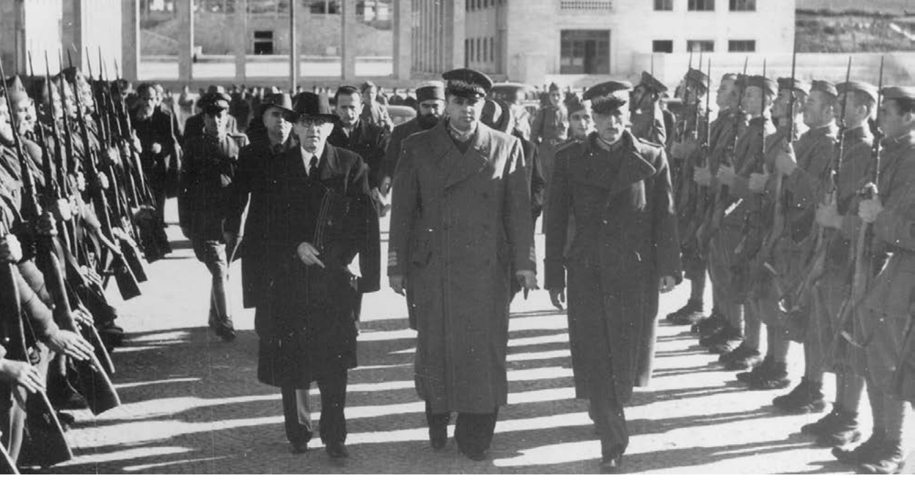
Enver Hoxha, Omer Nishani and Myslim Peza heading to the first meeting of Constituent Assembly, Tirana, January 10, 1946.

economic program, but freedom of property was recognized.<sup>49</sup>