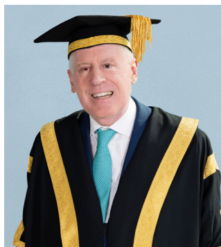
Mr Graeme Innes AM, LLB Syd , HonDUni Canberra , HonDSocSc RMIT , HonLLD UNSW , HonDUni ECU , FAICD

I'm delighted to join our graduands, their families, and their many supporters, on the occasion of their graduation. Today's milestone is one of life's great accomplishments and I warmly congratulate you all on this remarkable achievement. Graduation represents the culmination of years of hard work, perseverance, and dedication. While today may be a celebration of the end of this study journey it also marks the start of what will be a new journey of lifelong learning and discovery.