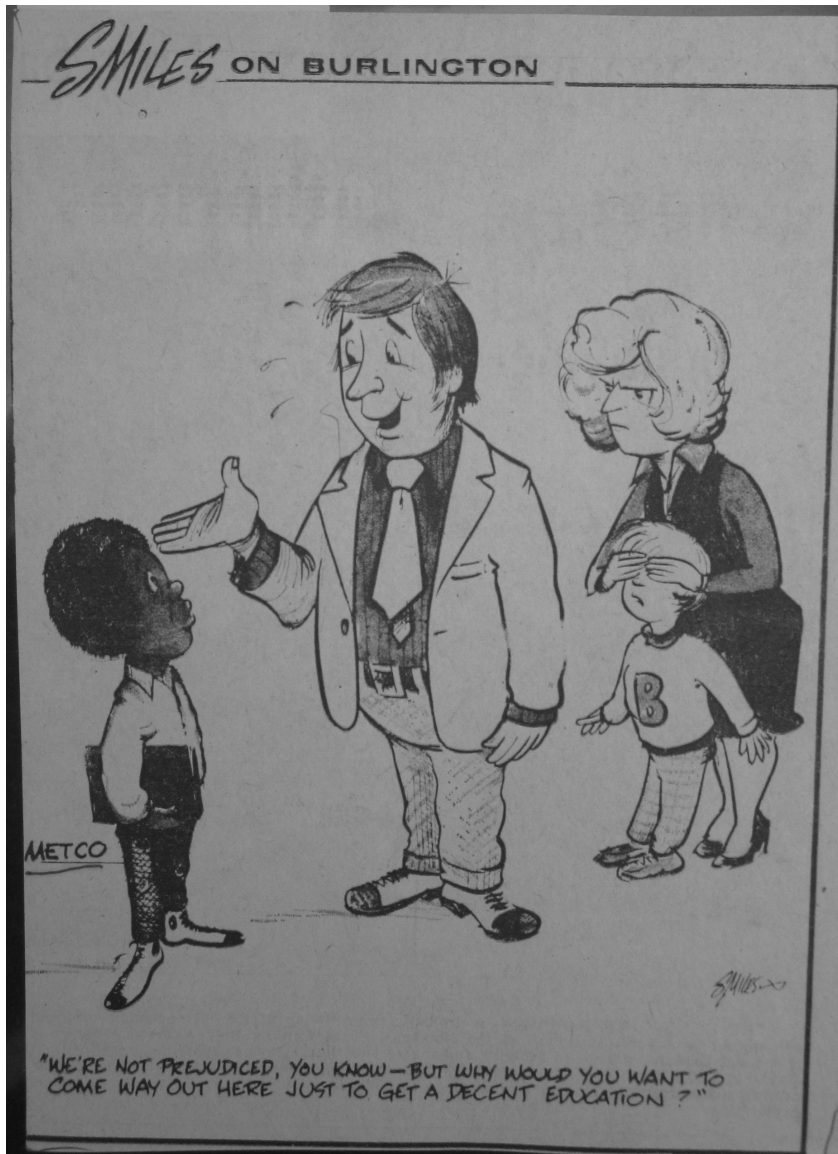
Figure 4 – “We’re not prejudiced, you know – but why would you want to come way out here just to get a decent education?” Woburn Times , December 6, 1974, Box 44, File 15, METCO Archives. Reproduced with permission from Woburn Times . This cartoon illustrates suburban resistance to METCO. The cartoonist mocks suburbanites’ insistence that they did not oppose the program for racist reasons, but rather because of the idea that a good education was not worth the hassle of being bused to the suburbs. Many suburban residents opposed METCO by arguing that the program’s long bus rides to unfamiliar neighborhoods placed unnecessary burden on urban students, yet this ignored the fact that students volunteered for the program.