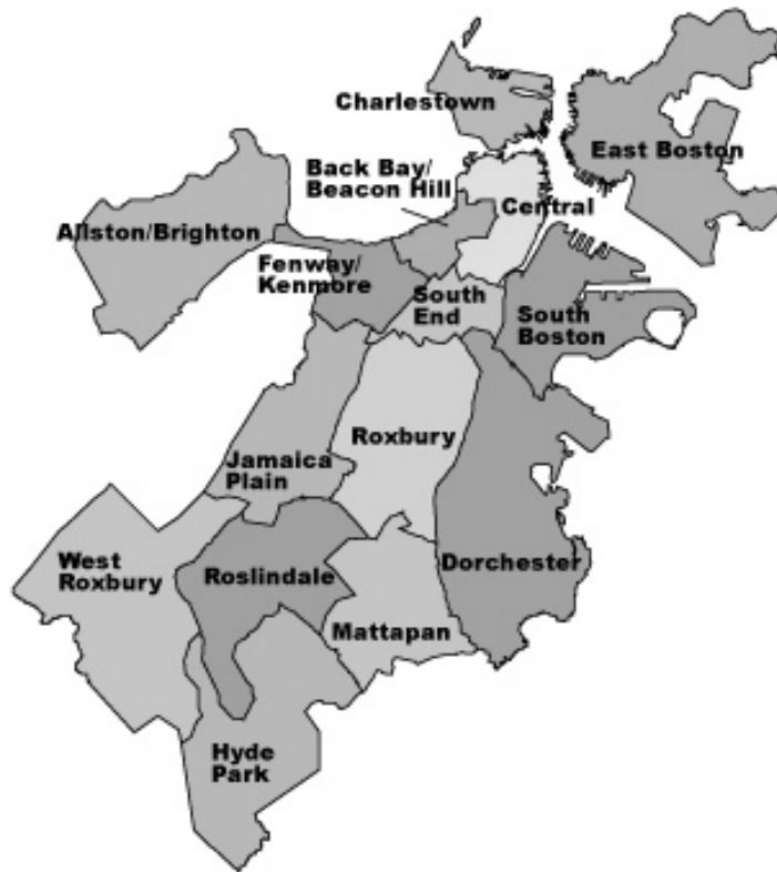
Figure 3 – Map of Boston neighborhoods, 2010, from the Official Website of the City of Boston, cityofboston.gov . In 1963 the city’s primarily black areas, or “black boomerang,” consisted of the South End, Roxbury, and Dorchester neighborhoods. Charlestown and South Boston were two with the most vocal populations who opposed busing for desegregation within the city.