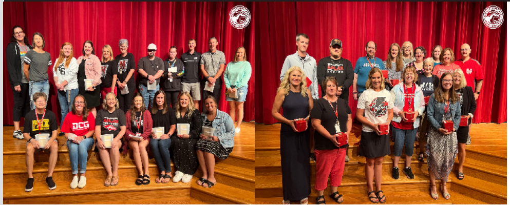
5 Years of Service at Dallas Center-Grimes CSD