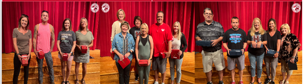
15 Years of Service at Dallas Center-Grimes CSD