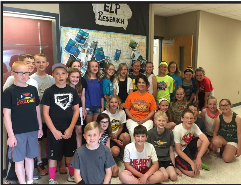
Below: Dallas Center Elementary 4th & 5th Grade ELP Research Group Presents Iowa: Points of Interest