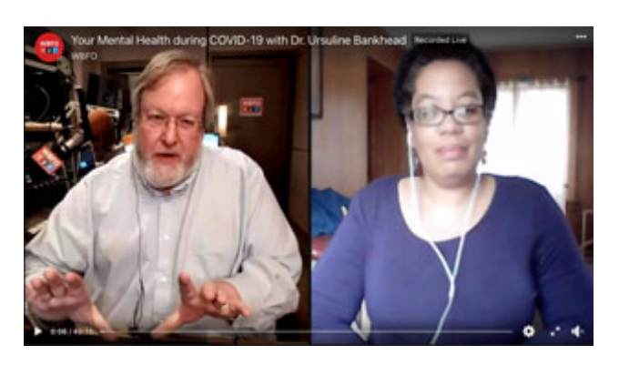
WBFO held a series of Facebook Live events with mental health professionals.

Buffalo Toronto Public Media is deeply engaged with our community. Our major projects explored the changes in our region's population, brought cultural performances to our community when they couldn't attend them in-person, supported the mental and physical health of our population, and provided events to help our young people and adults be informed and educated.