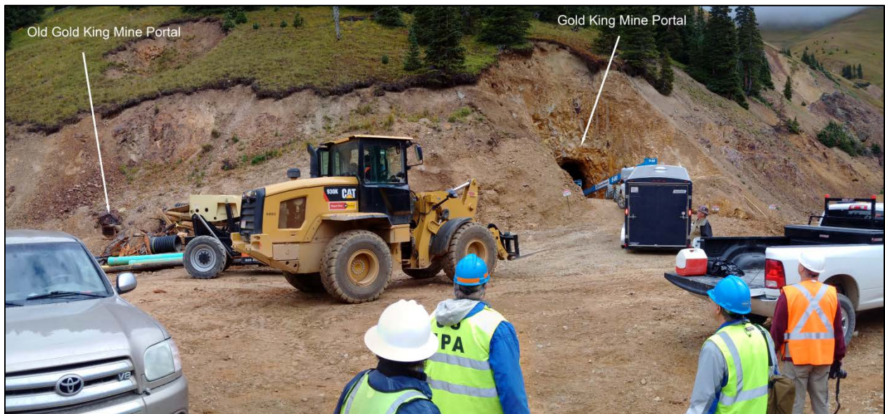
Figure 5 - Photo of the old and new Gold King Mine portals