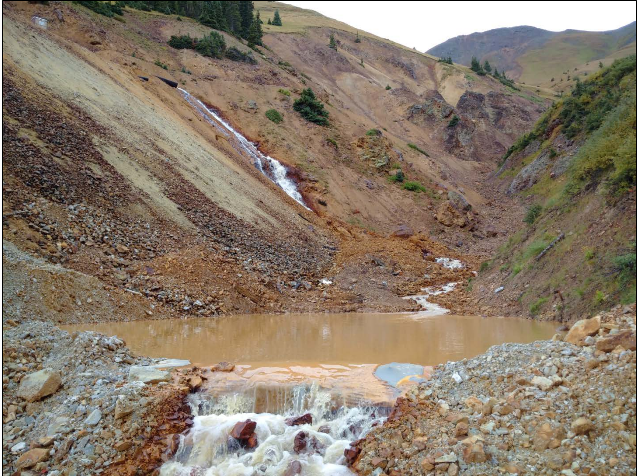
Figure 4 - Photo looking up near the Gold King Mine portal (off screen left), showing the discharge from the mine as of 3 September and a new settling pond.