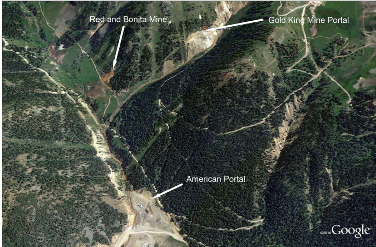
Figure 2 - Aerial View of the Gold King Mine Area