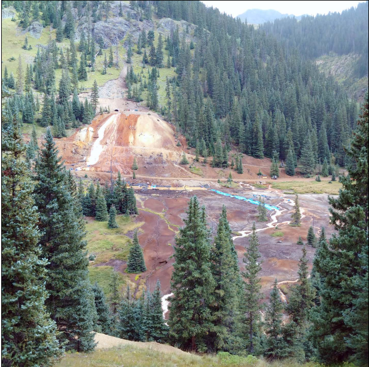
Figure 9 - Photo showing the Red and Bonita Mine portal. Some discharge from Gold King is now being piped over to the settling ponds beneath Red and Bonita.