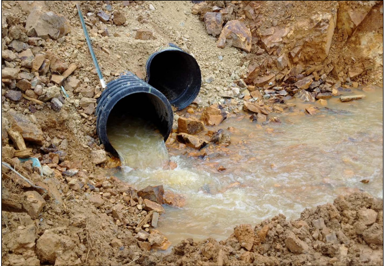
Figure 6 - Current discharge from Gold King Mine