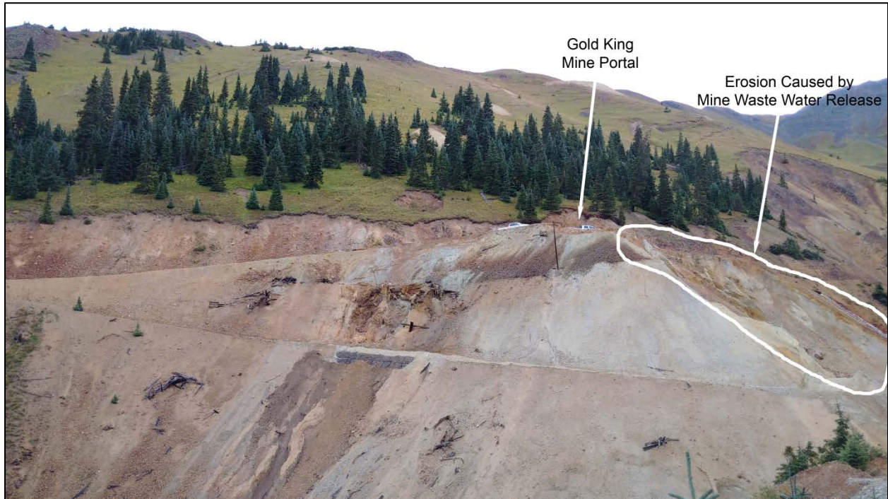
Figure 3 - Photo of the mine portal and the erosion caused by the mine waste water release