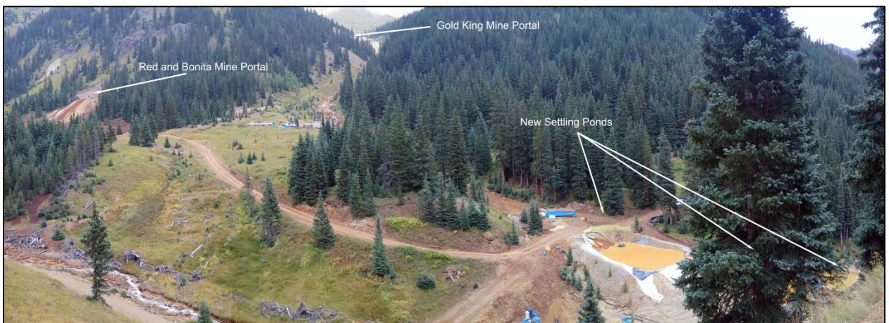
Figure 7 - Photo showing Cement Creek and the new settling pond complex