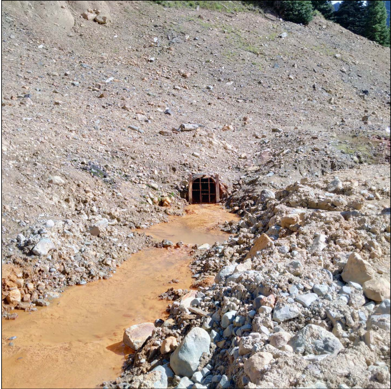
Figure 10 - Photo of the discharge coming out of the American portal of the Sunnyside Mine