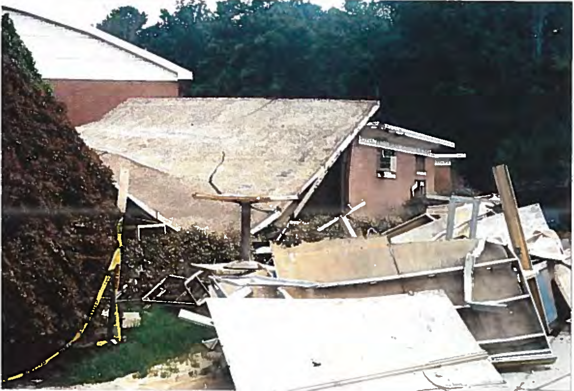
8. Building failure near gymnasium. 4-inch block wall faced with brick collapsed.