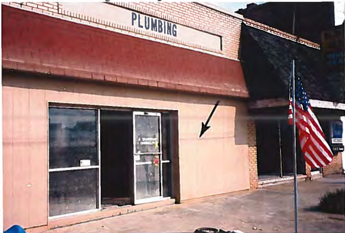
3. Plumbing business near Flint River. High water mark indicated by arrow.