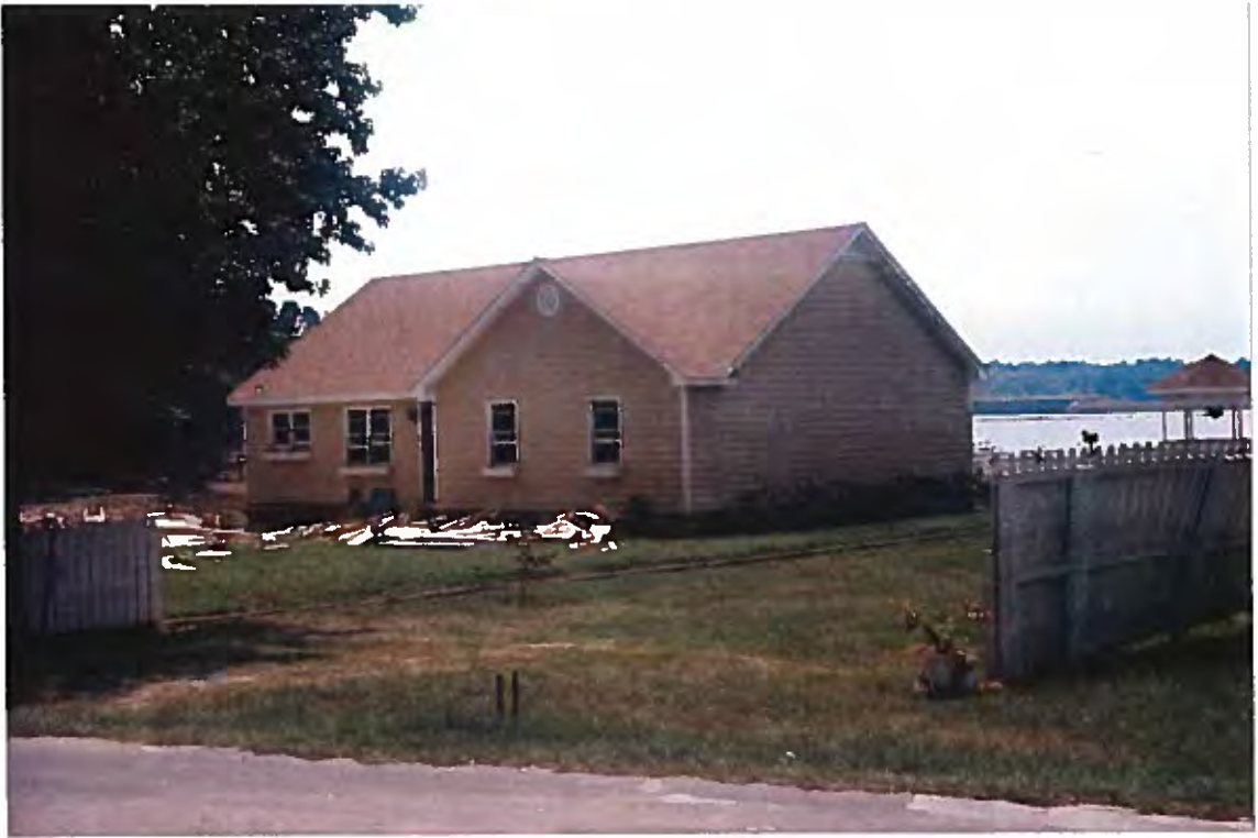
1. House on Lake Blackshear damaged by high water. Interior goods and furnishings damaged by floodwaters.