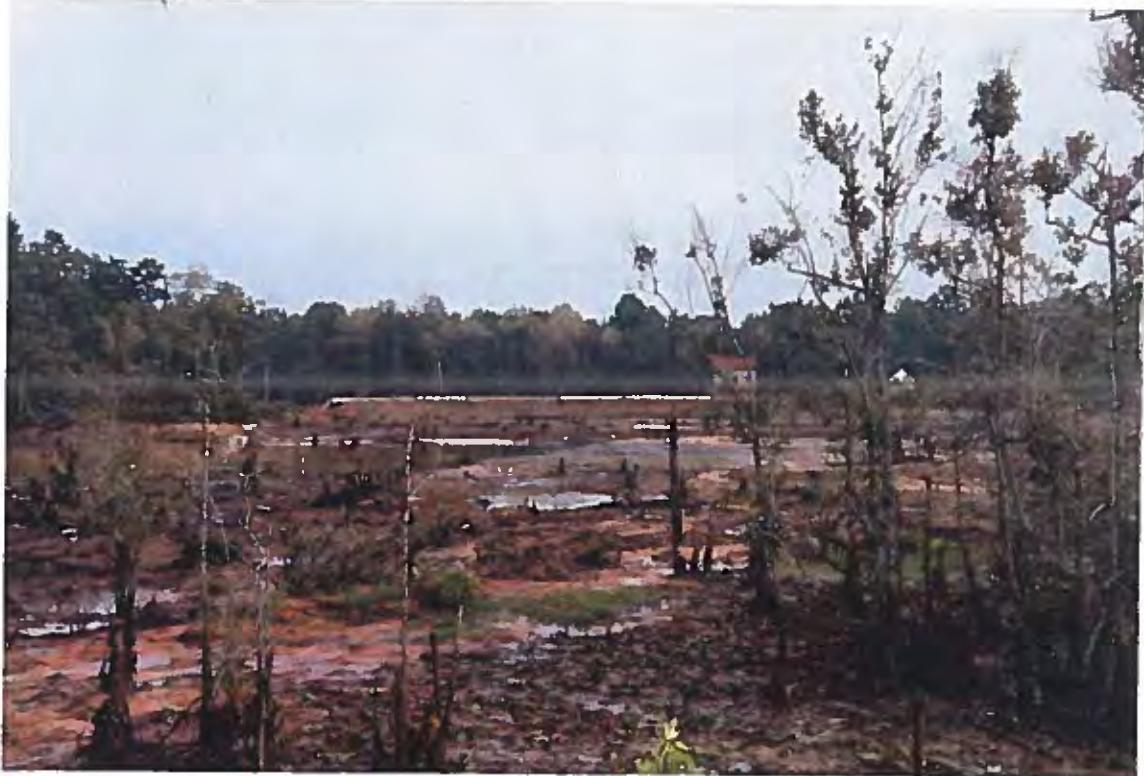
2. Lake area after loss of water