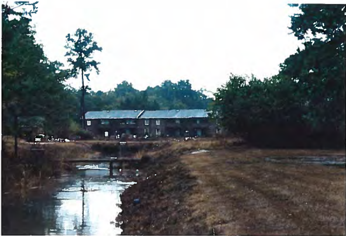
21. Jamestown Apartments. Lower level flooded. Interior goods and furnishings damaged.