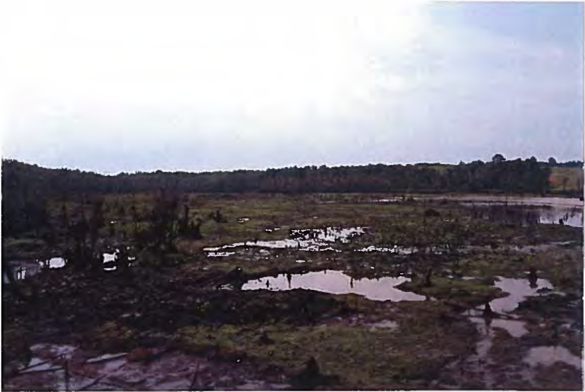
1. Lake area after loss of water