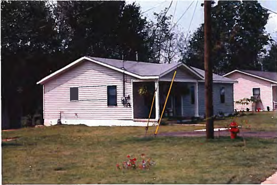
1. Success story. House built adjacent to but far enough away from creek.