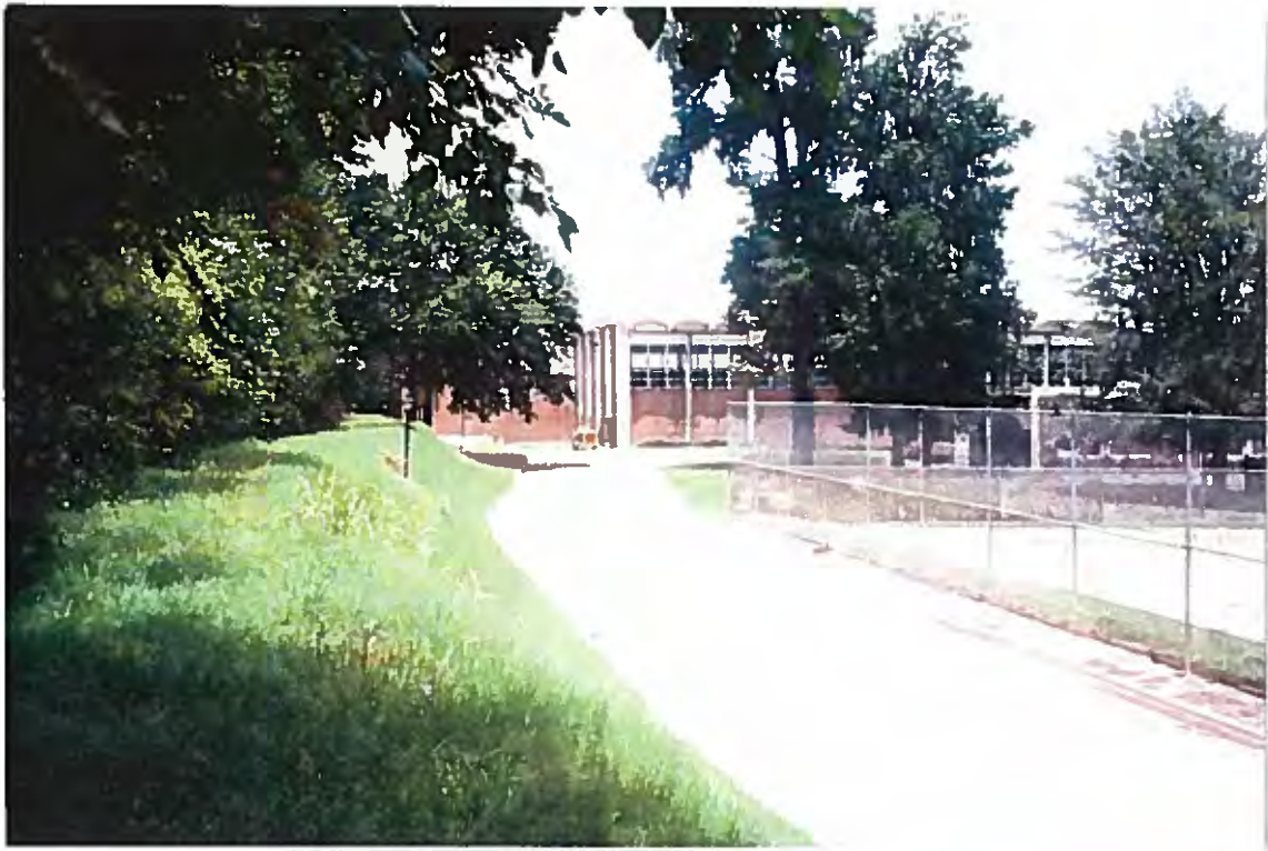
3. Looking toward gymnasium. Levee at left.