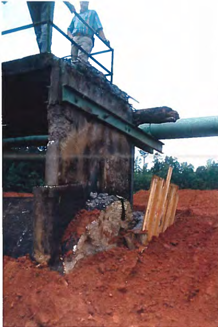
1. Dam breach area