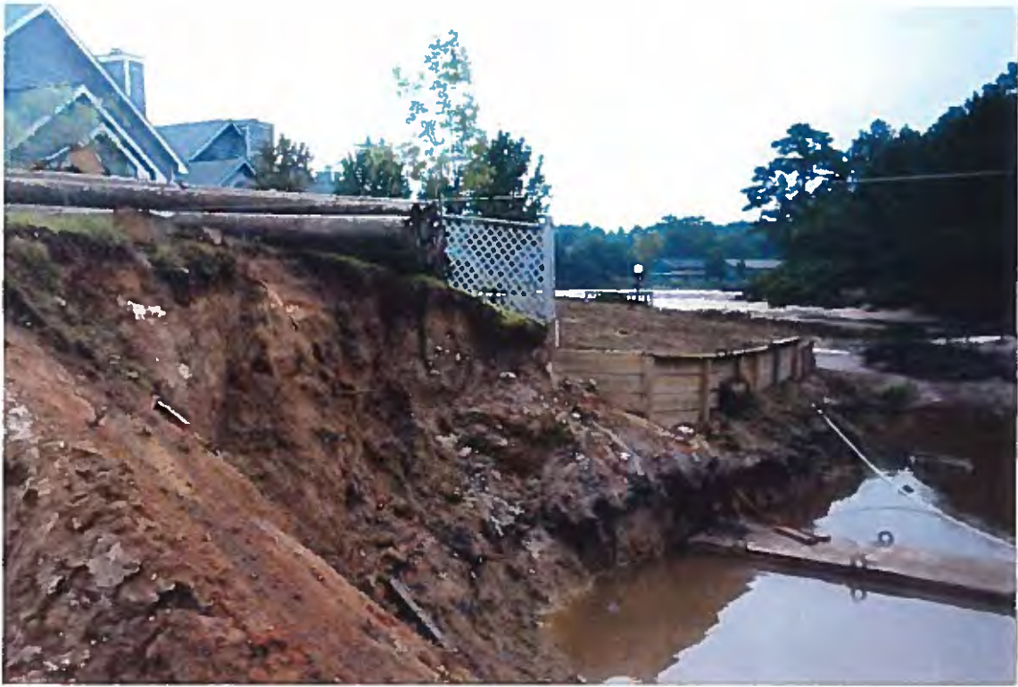
3. Failure area