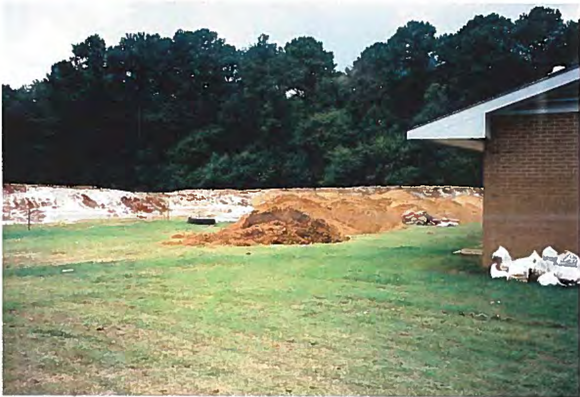
12. Temporary emergency levee at lower end of recreation field.