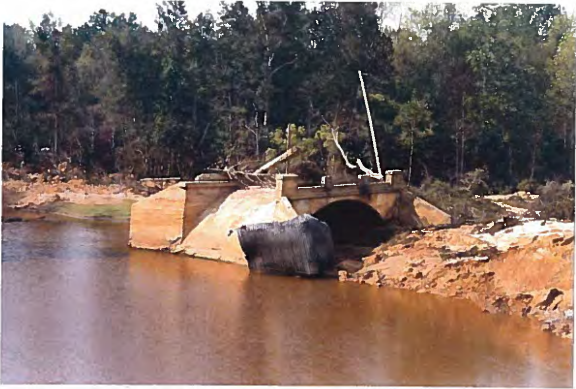
1. Site of breached dam