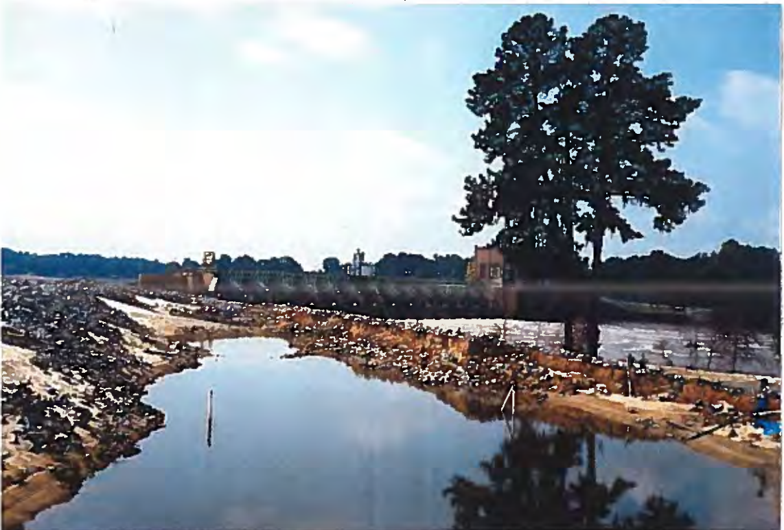
2. Looking upstream at dam across embankment failure area.