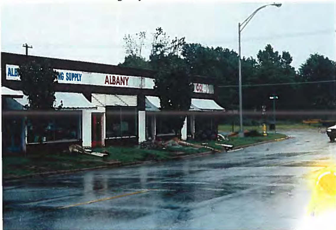
18. Commercial buildings at Flint Street and Front Street. Floodwaters reached depths of approximately 2 feet, damaging interior goods and furnishings.