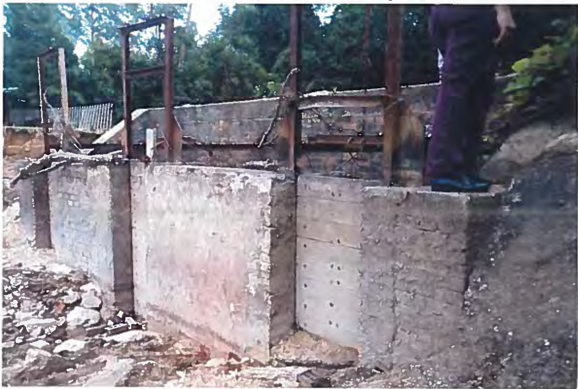
2. Front view of gates