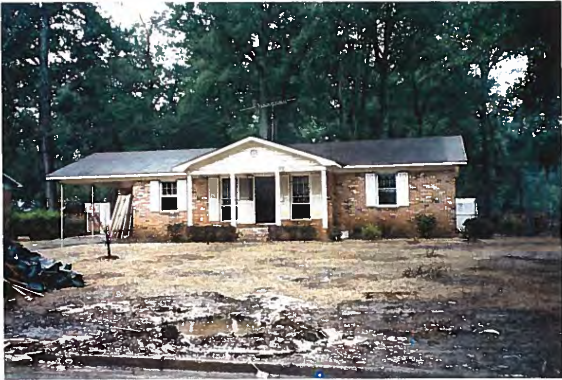
19. Single-family house on 10th Street. Interior goods and furnishings damaged by floodwaters.