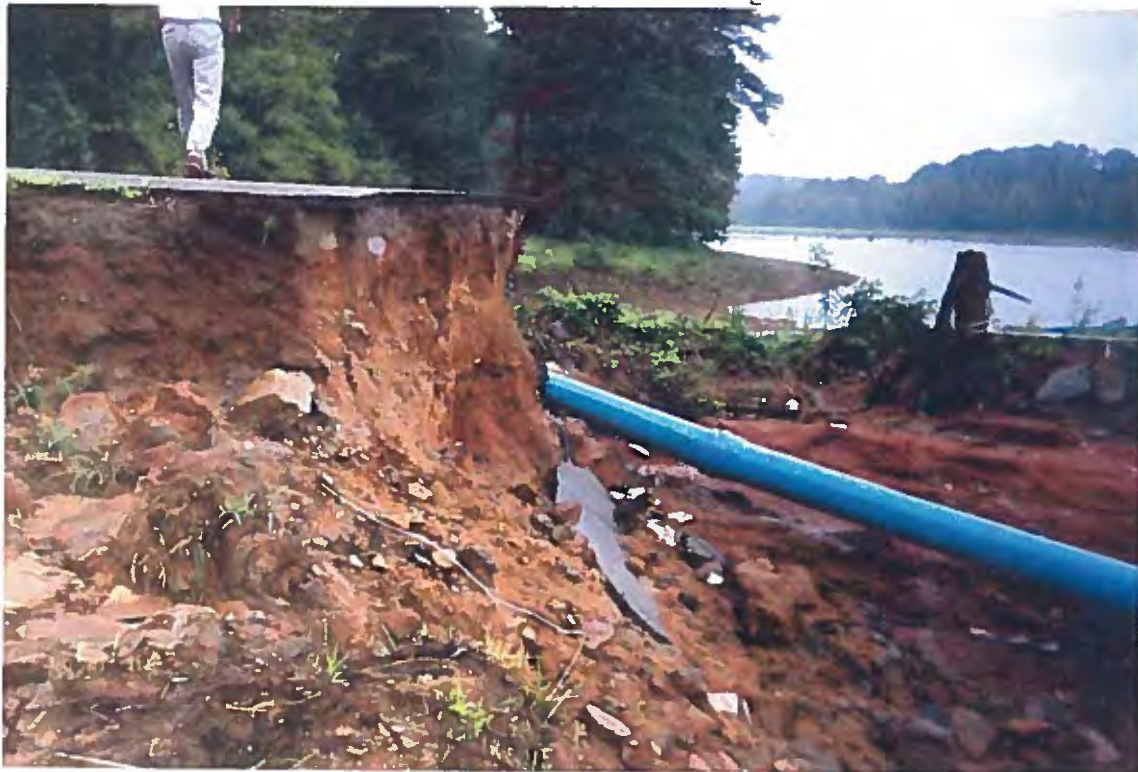
2. Closeup of breach area