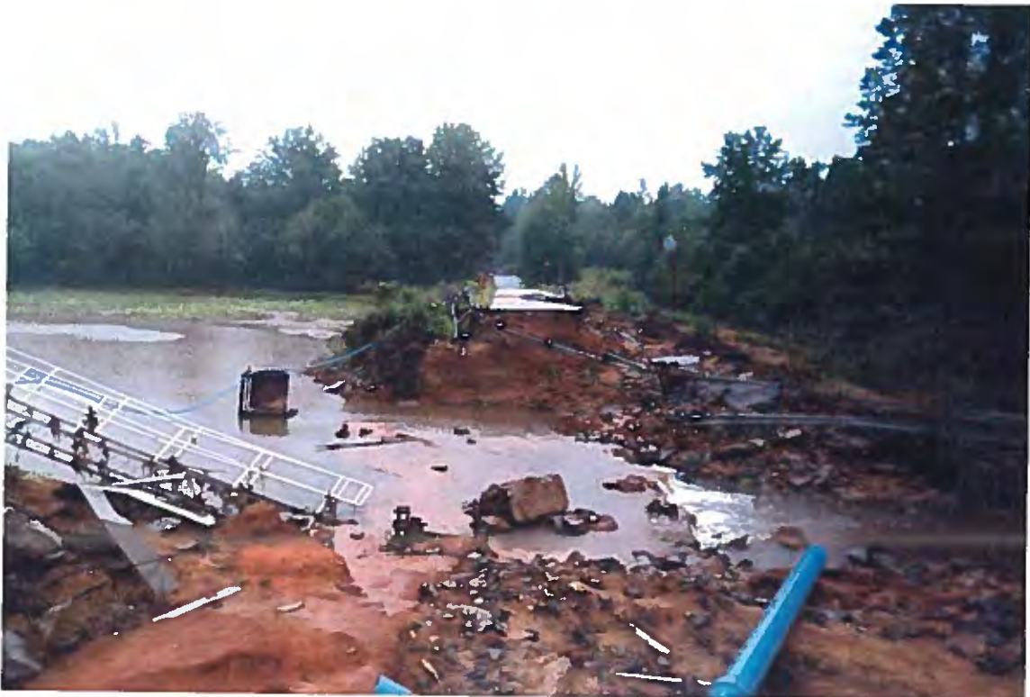
1. Breached section of dam and damaged road