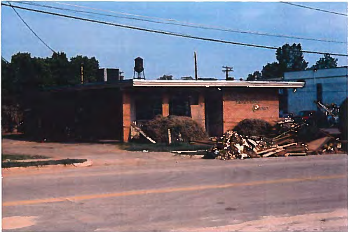
4. Cole insurance office next to Flint River. Loss of interior walls and furnishings.