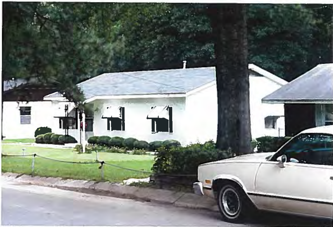
4. Single-family house on Spencer Circle. Minor water damage.