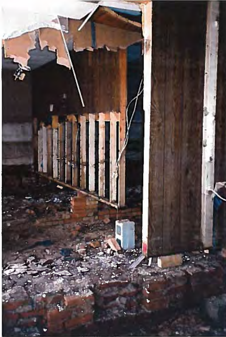
1. Robert's Law Office. Flooding caused extensive damage to timber subflooring and flooring.