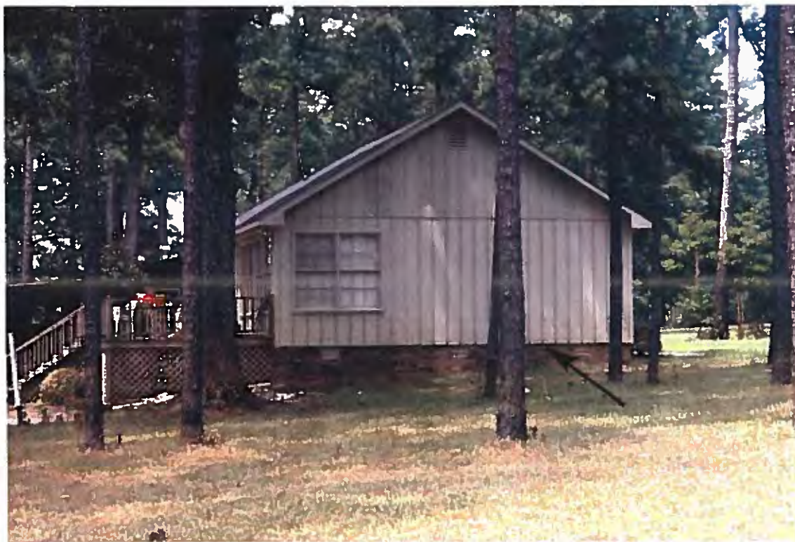
8. View of elevated house. Water mark below first floor level indicated by arrow.