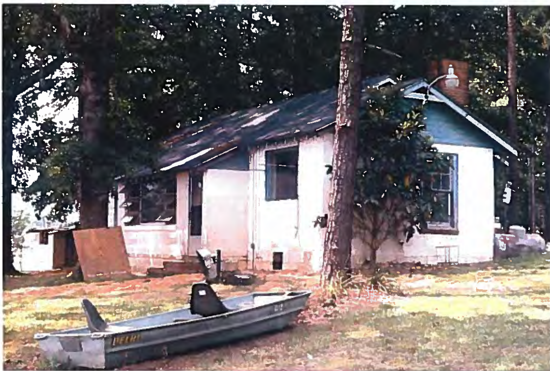
7. Walker House. Water rose above the eaves.