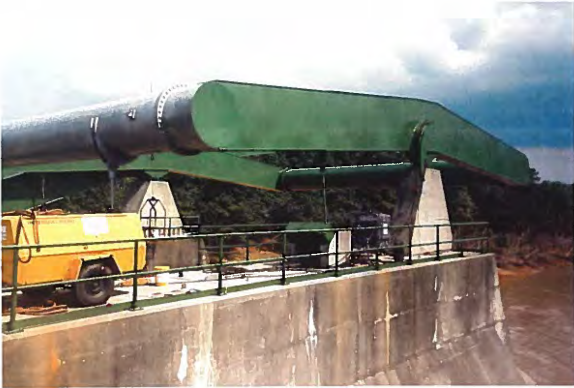
2. Gate counterweight