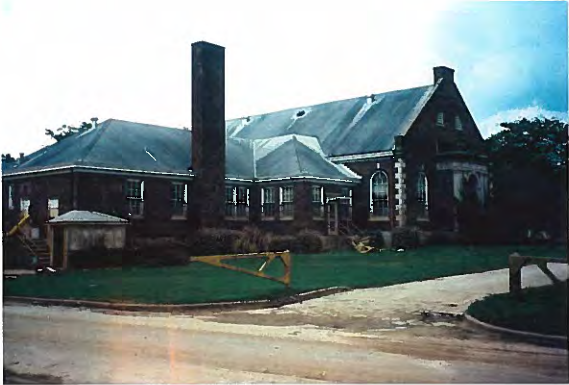
9. Classroom building next to dining hall. Interior goods and furnishings damaged by floodwaters.