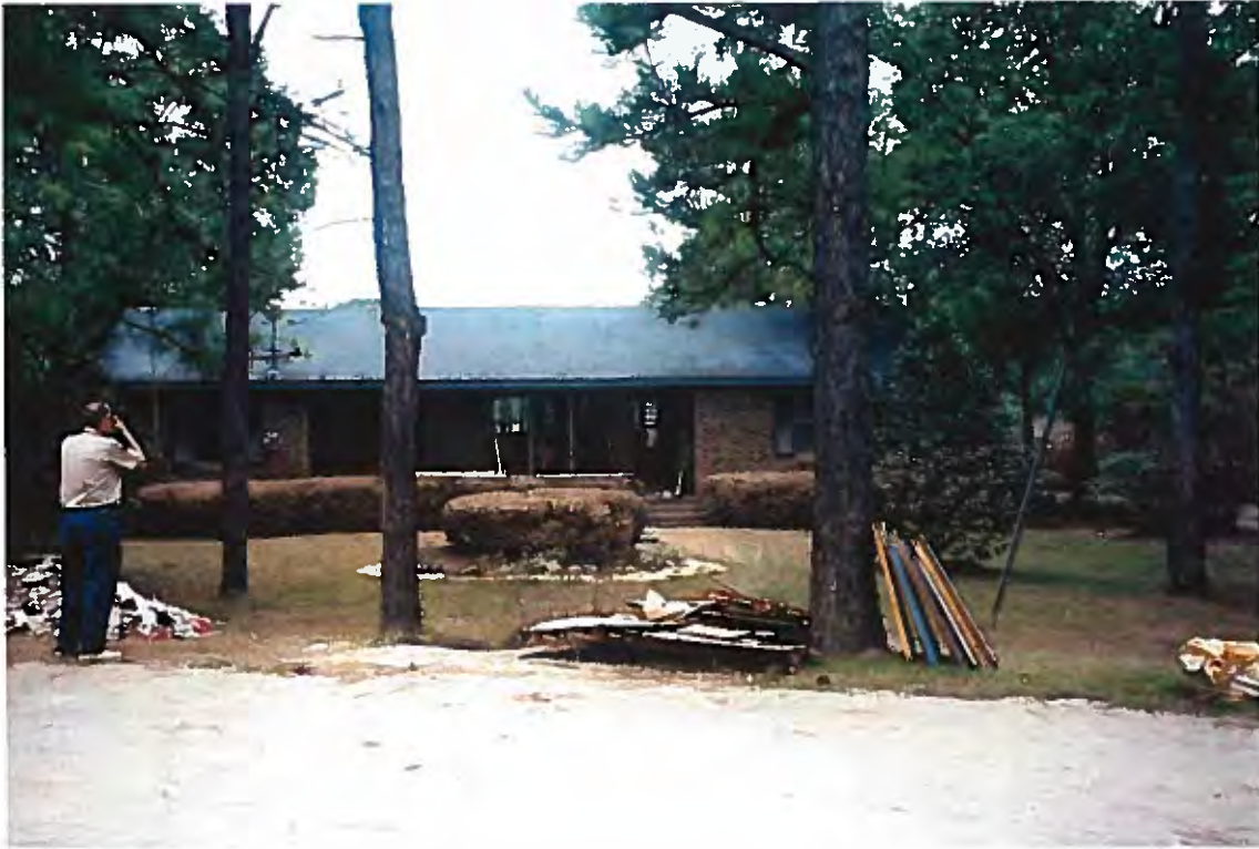
3. Cowart House on E. Parks Avenue under repair. Interior goods and furnishings damaged by floodwaters.