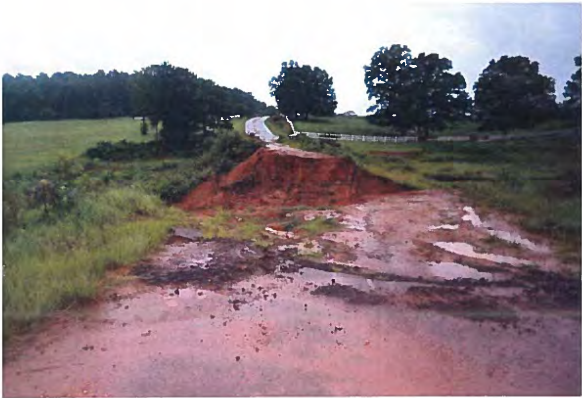
1. Failed section of dam and road