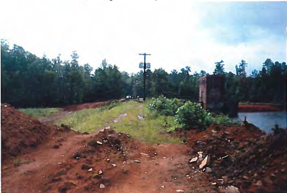
3. View along top of embankment showing vegetation