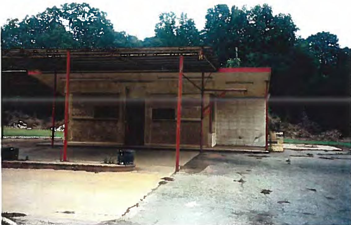
10. Abandoned commercial building on Main Street was completely inundated.