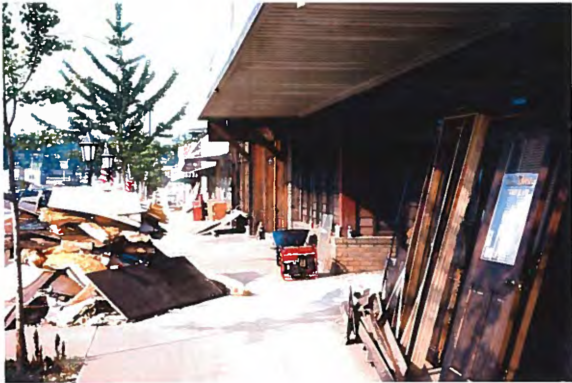
2. Looking toward Flint River along S. Dooly Street. Damaged furnishings.