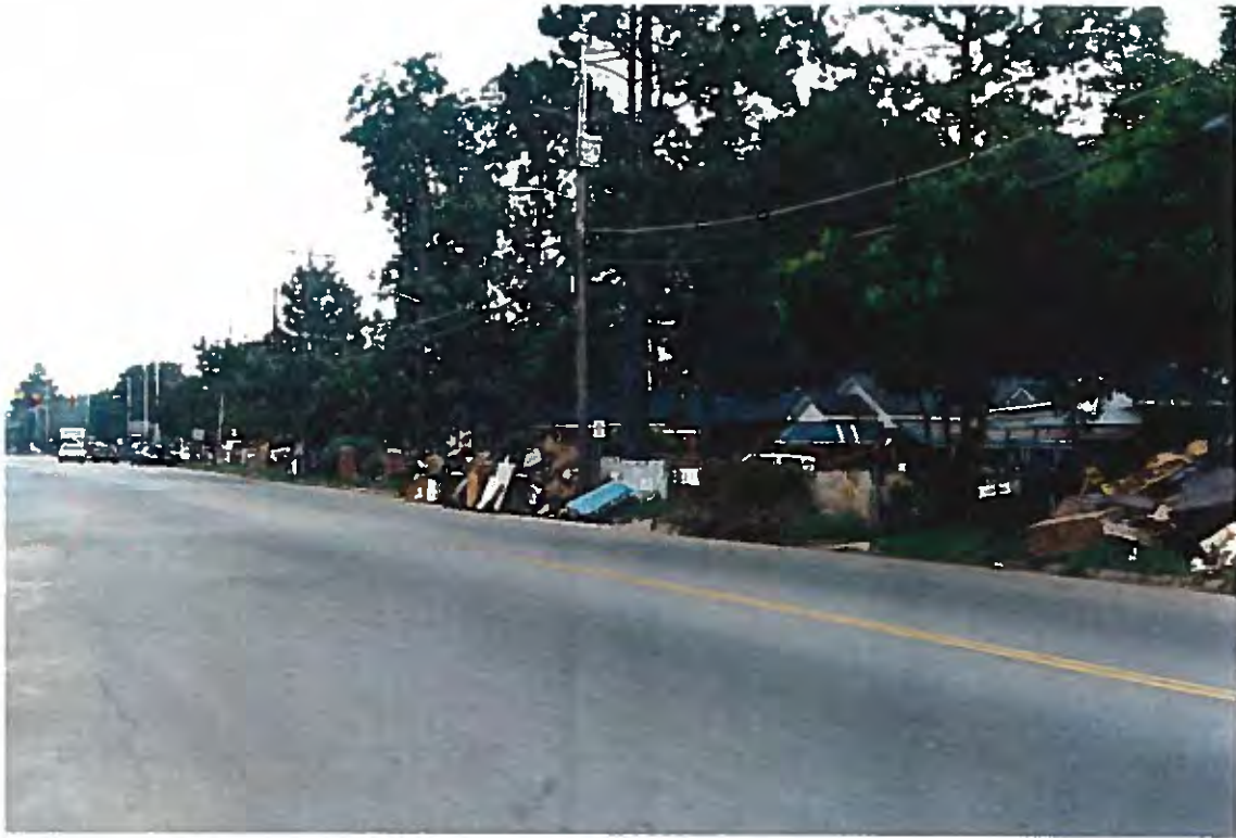
13. Single-family houses on King Drive near Gains Avenue. Interior goods and furnishings damaged by floodwaters.