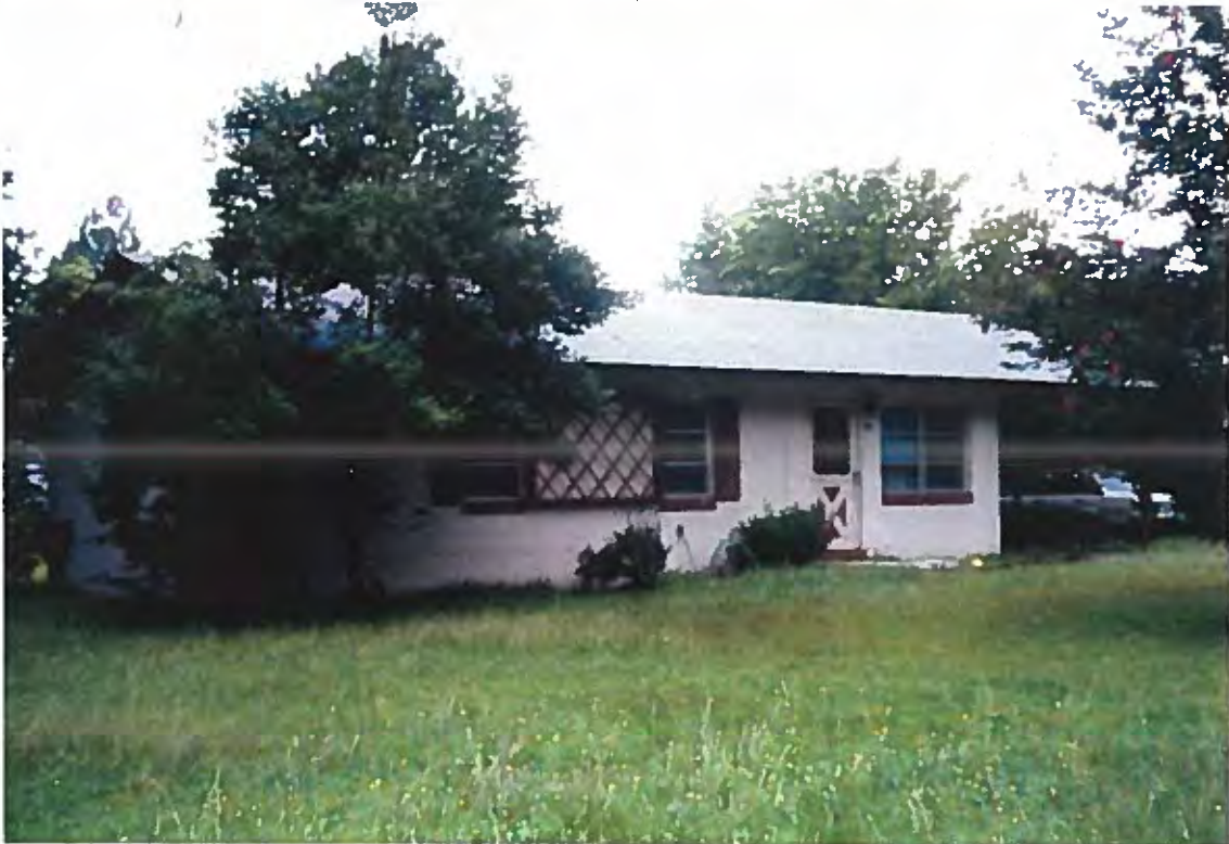
7. 4509 Pinedale. Minor water damage.