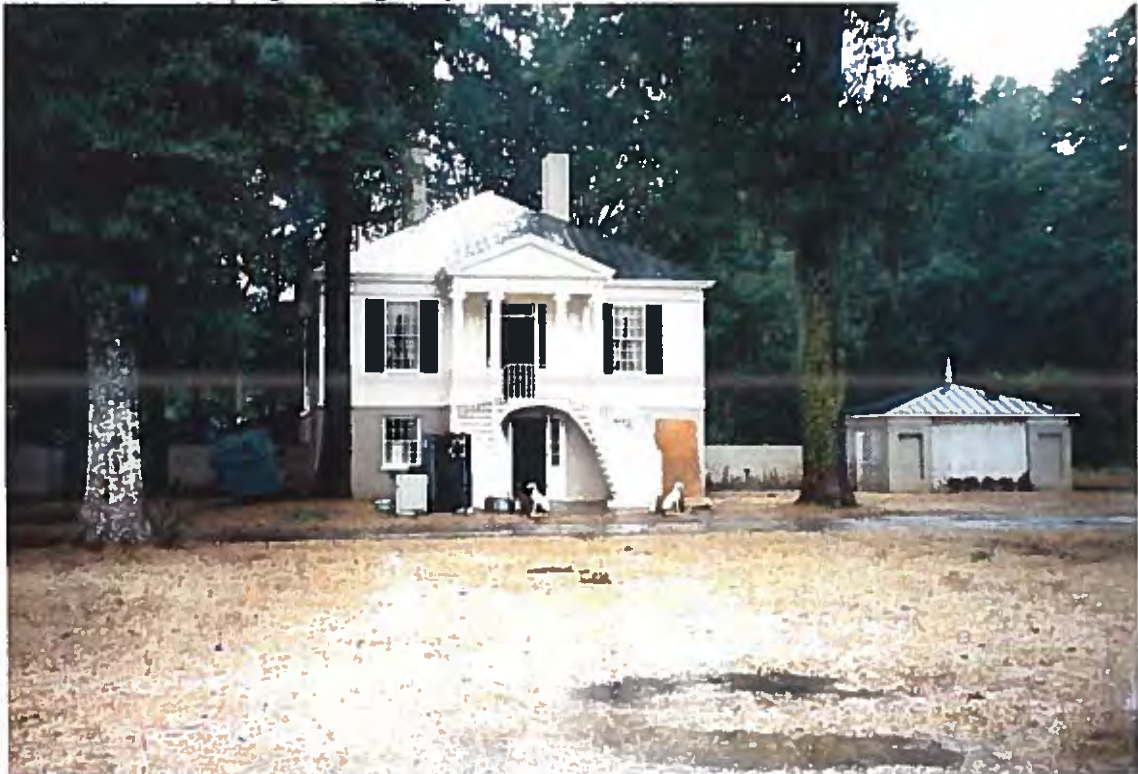
24. Single-family residence on Valley Street. Lower level flooded