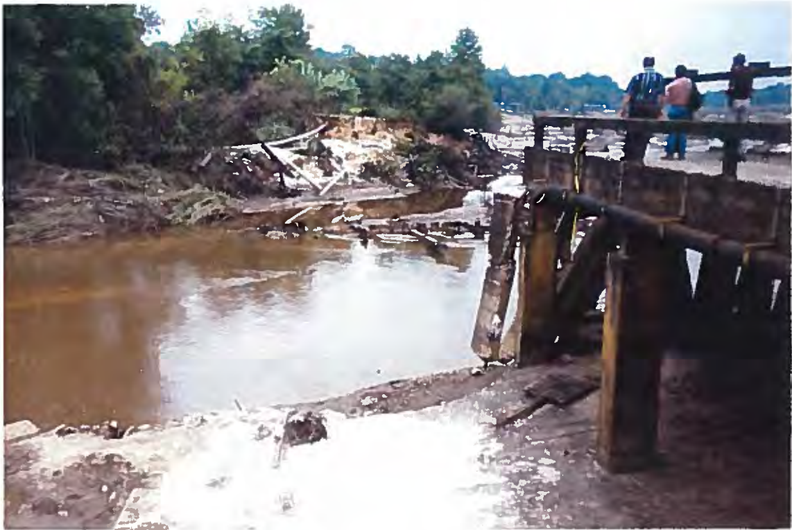
3. View of failure area on opposite bank