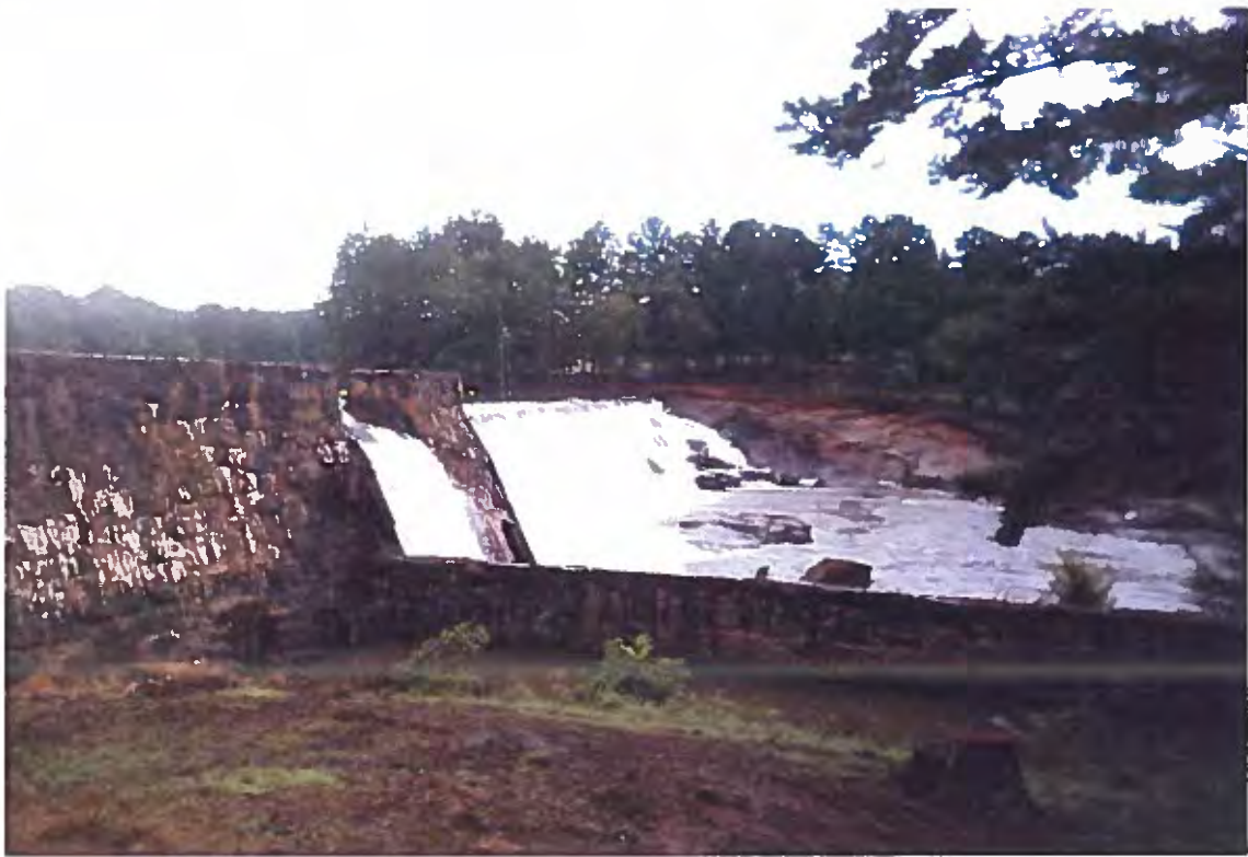
1. Dam remained intact; erosion at dam abutment