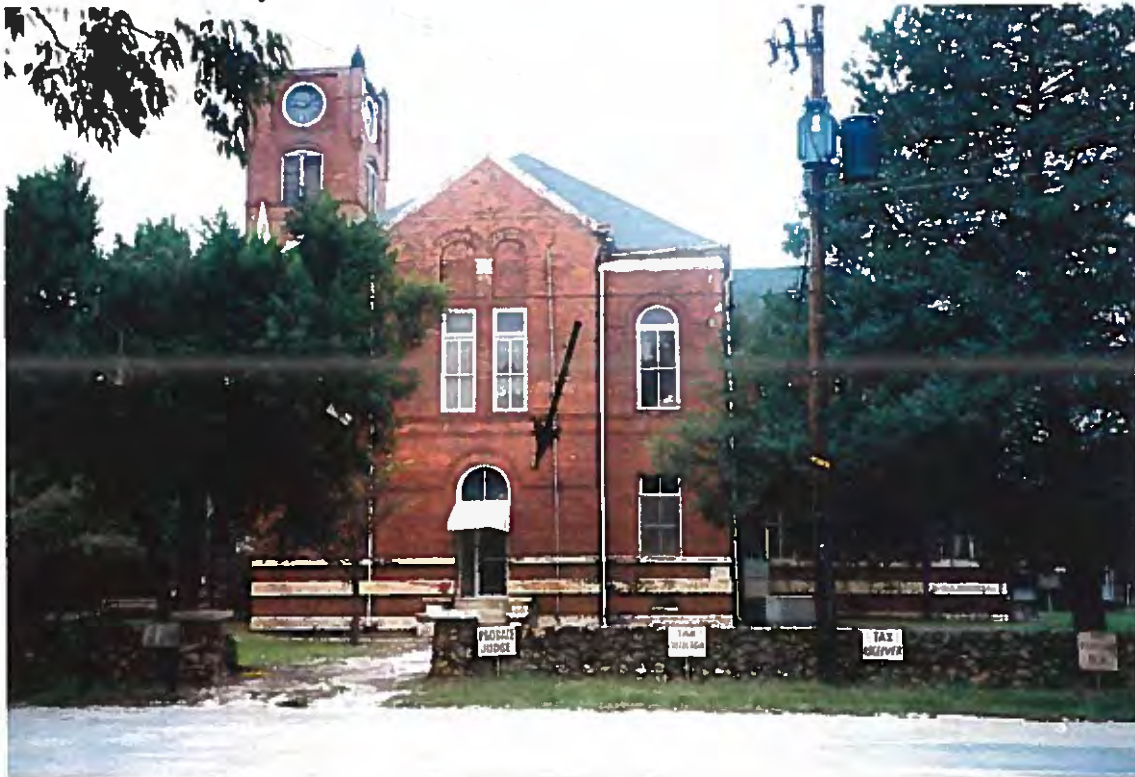
6. Courthouse. High water mark indicated by arrow.