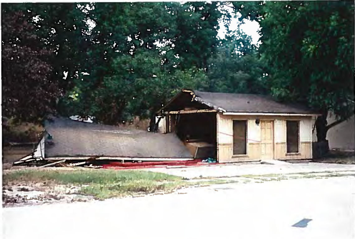
11. House failure on Broad Street (frame construction). Collapse likely due to floodwaters floating the structure off its foundation.