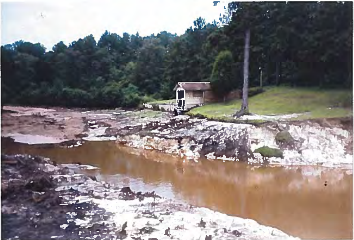
4. Failure area, opposite view