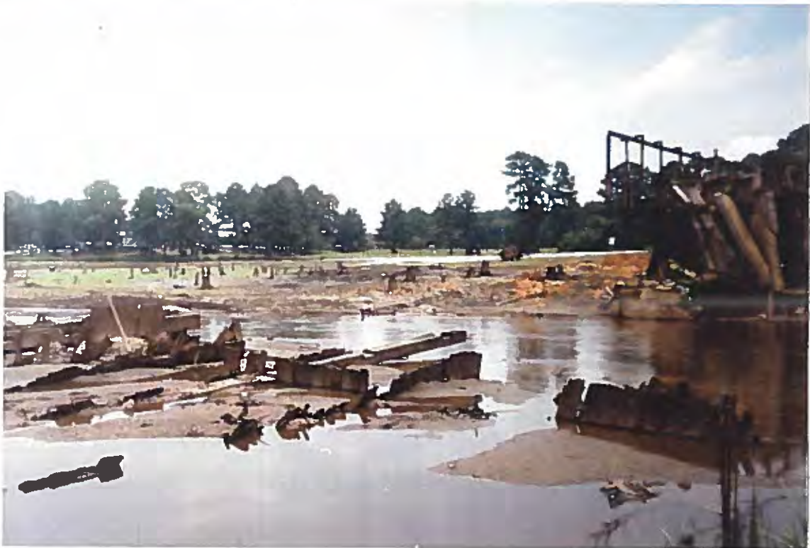
2. Looking upstream across failure area; purpose of wood piles unknown