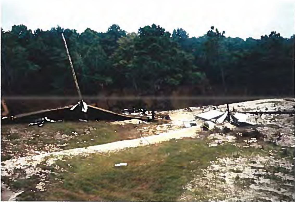
15. Remains of Rivertrace Restaurant along bank of Flint River at State Route 37 Bridge