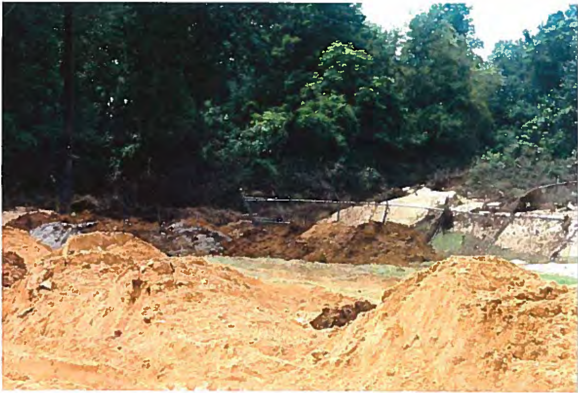
11. Breach in levee near end of recreation field.