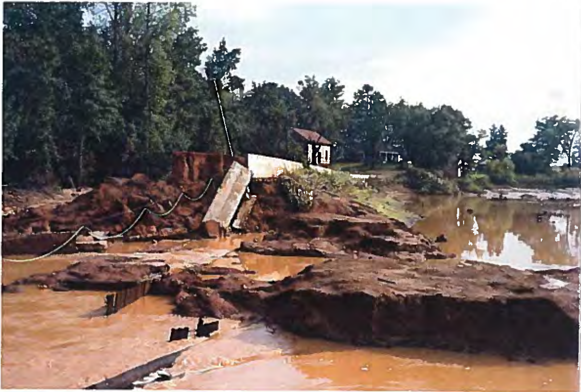
1. Breached dam; purpose of timber pilings near bottom of photo unknown (possibly cofferdam)