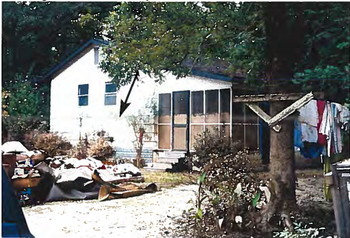
2. House on E. Parks Avenue. High water mark indicated by arrow.