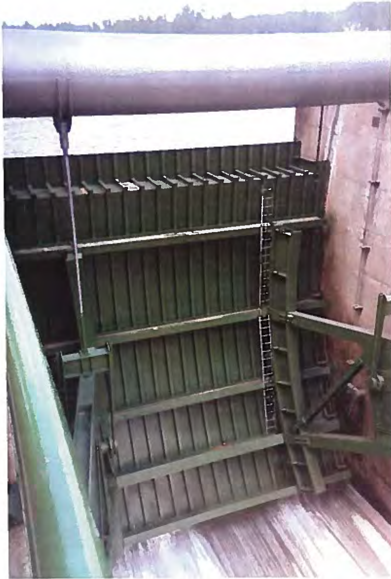
1. Electronic gate system did not work; mechanism had to be operated manually