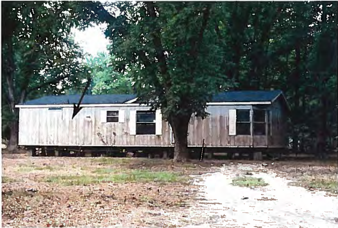
1. Flooded mobile home at intersection of W. Springdale and N. Springdale. High water mark indicated by arrow.