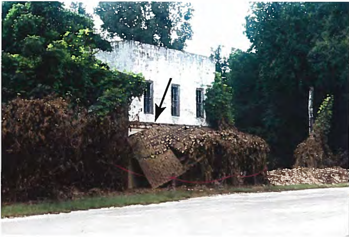
9. Abandoned commercial building at Hall and S. Water Street. High water mark indicated by arrow.