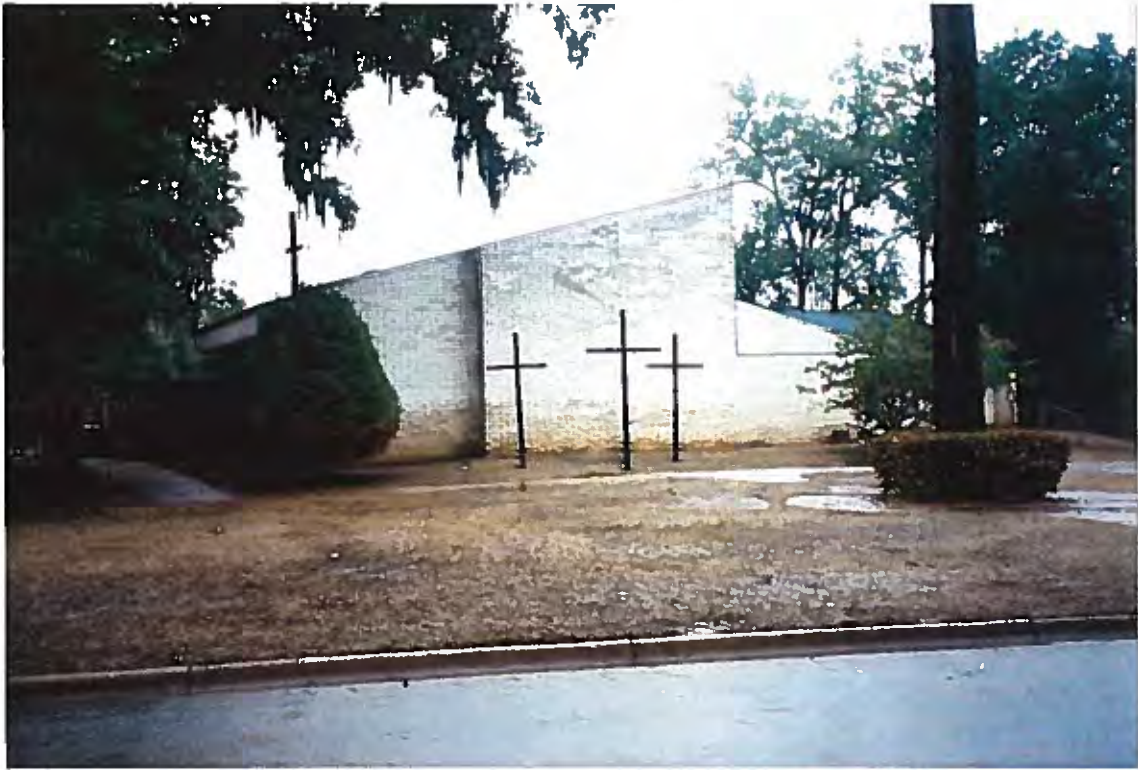
23. Church near Whispering Pines at Edgewood Drive. Interior goods and furnishings damaged by floodwaters.