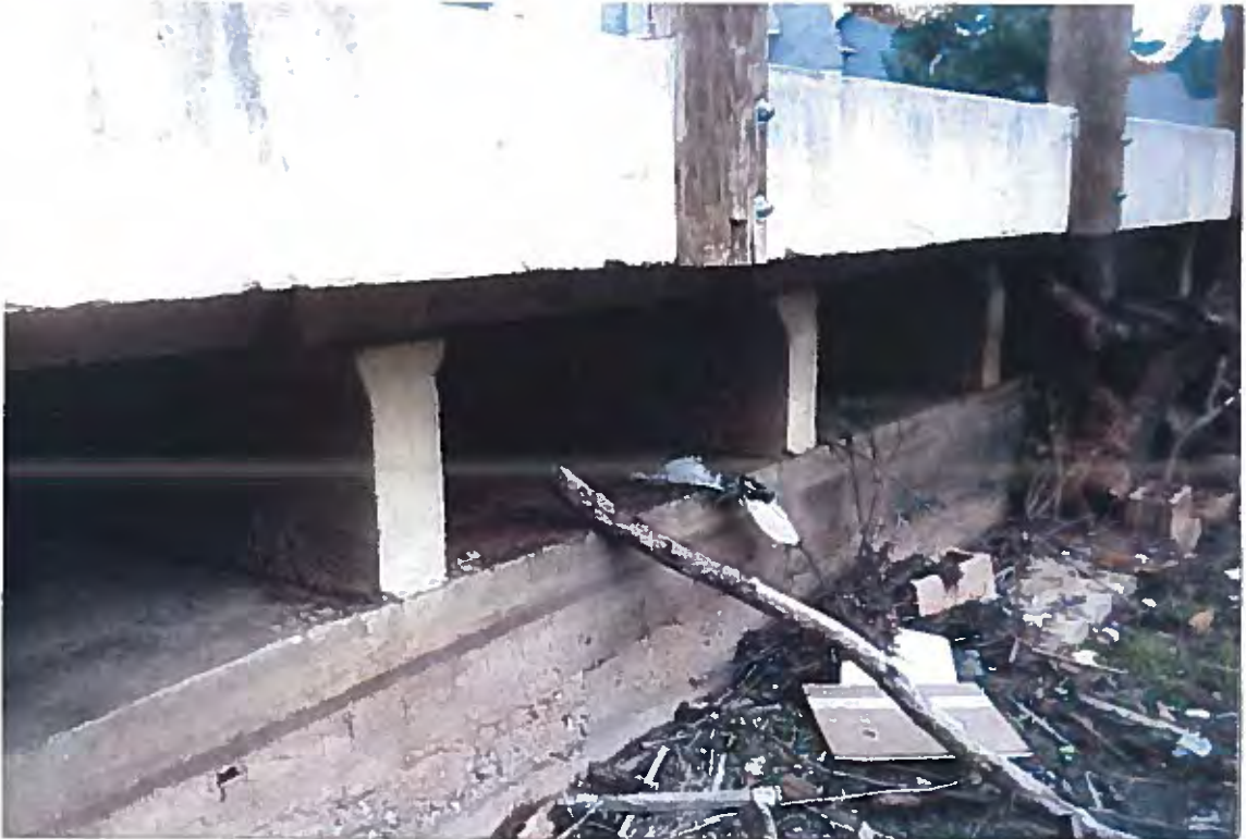
2. Closeup of control structure showing clogged openings