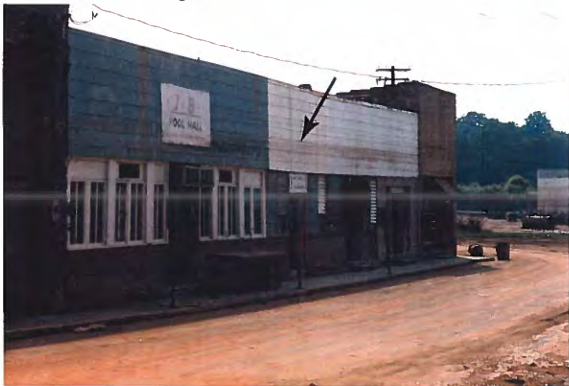
5. 1946 structure with original exterior brick walls. Interior updated with pre-engineered steel columns. High water mark indicated by arrow.