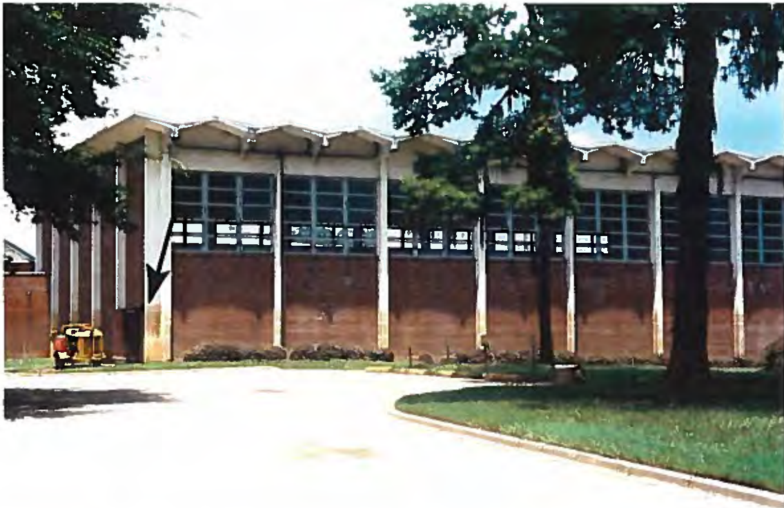
5. Sanford Hall gymnasium and pool. High water mark indicated by arrow.