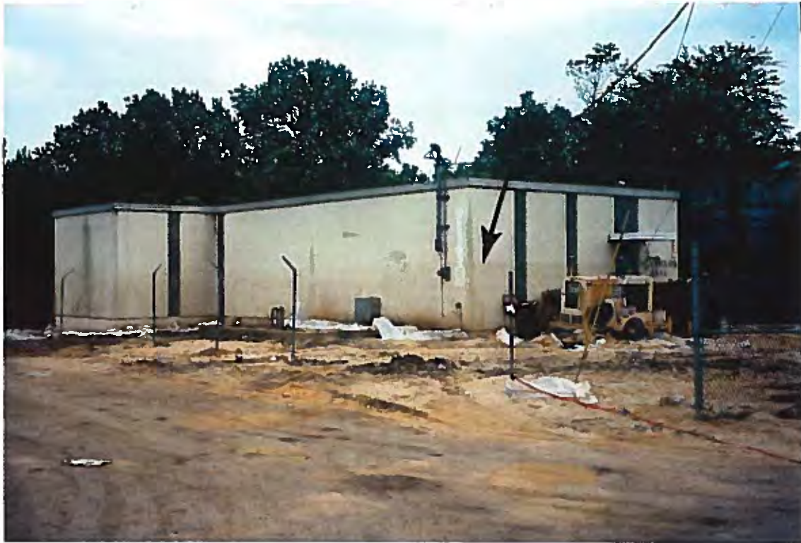
5. Southern Bell Facility at E. Phipps and Water Street. High water mark indicated by arrow.