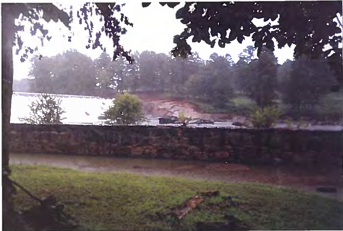
2. Erosion at dam abutment