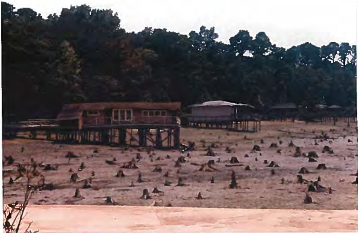
5. View of house on pilings. House damaged by floodwaters that rose high enough to float the structure.