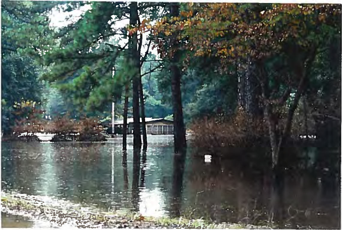
14. House on Clear Water Street still flooded.