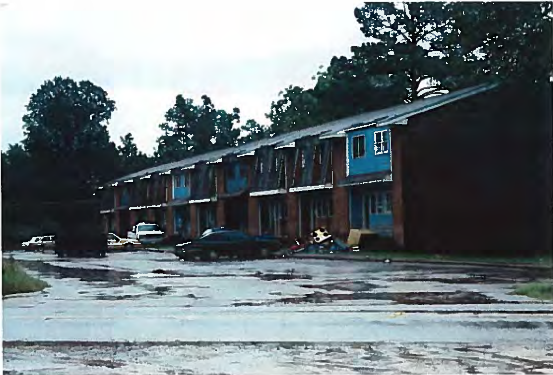
17. Two-story housing on Habersham Street. Interior goods and furnishings on lower level damaged by floodwaters.