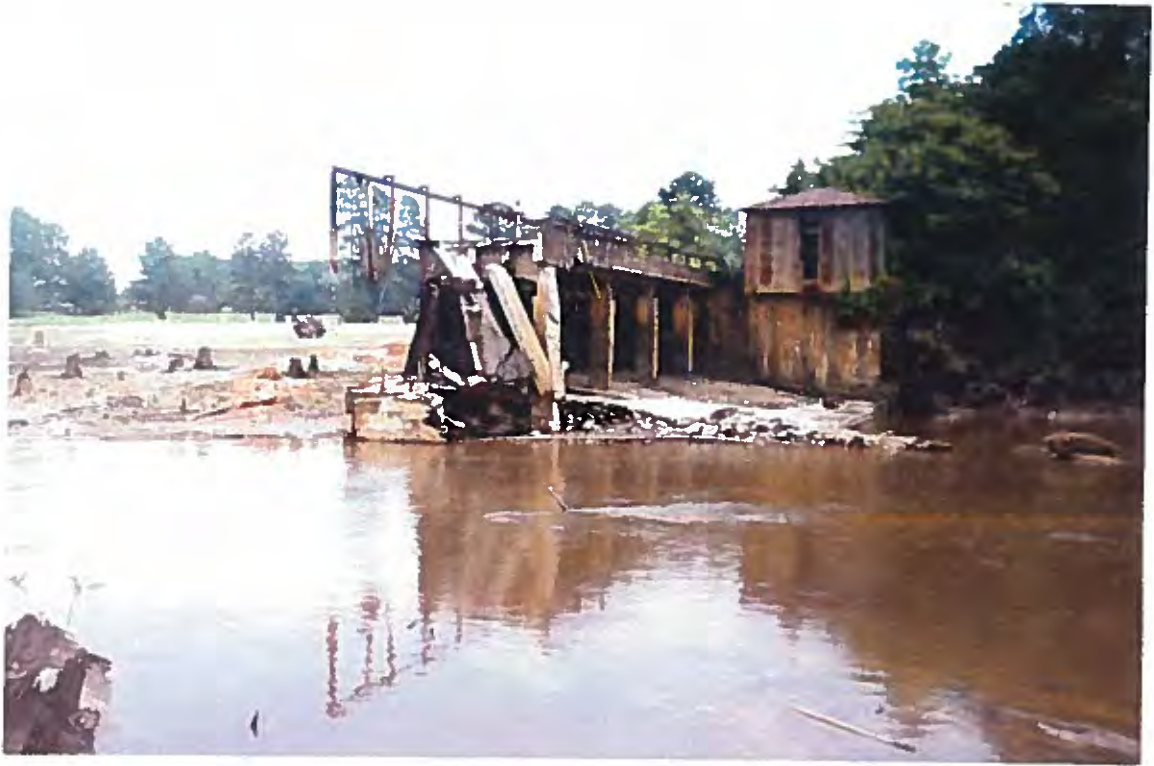
1. Failed dam structure