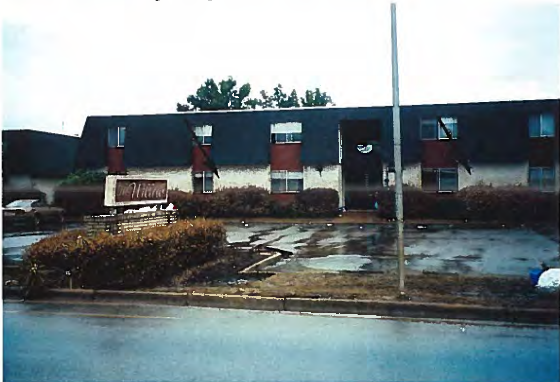
22. Willows Apartments. High water mark indicated by arrows.