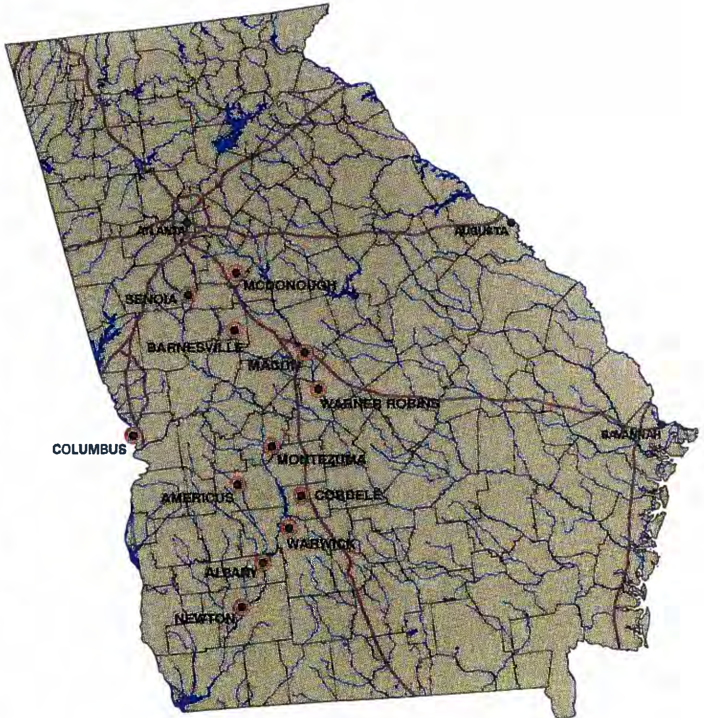
FIGURE 2. CITIES VISITED BY THE BPAT AND DPAT (SHOWN IN RED)