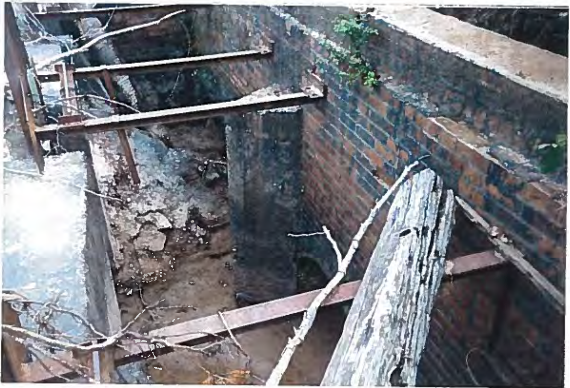
1. Top view of gates that failed to open