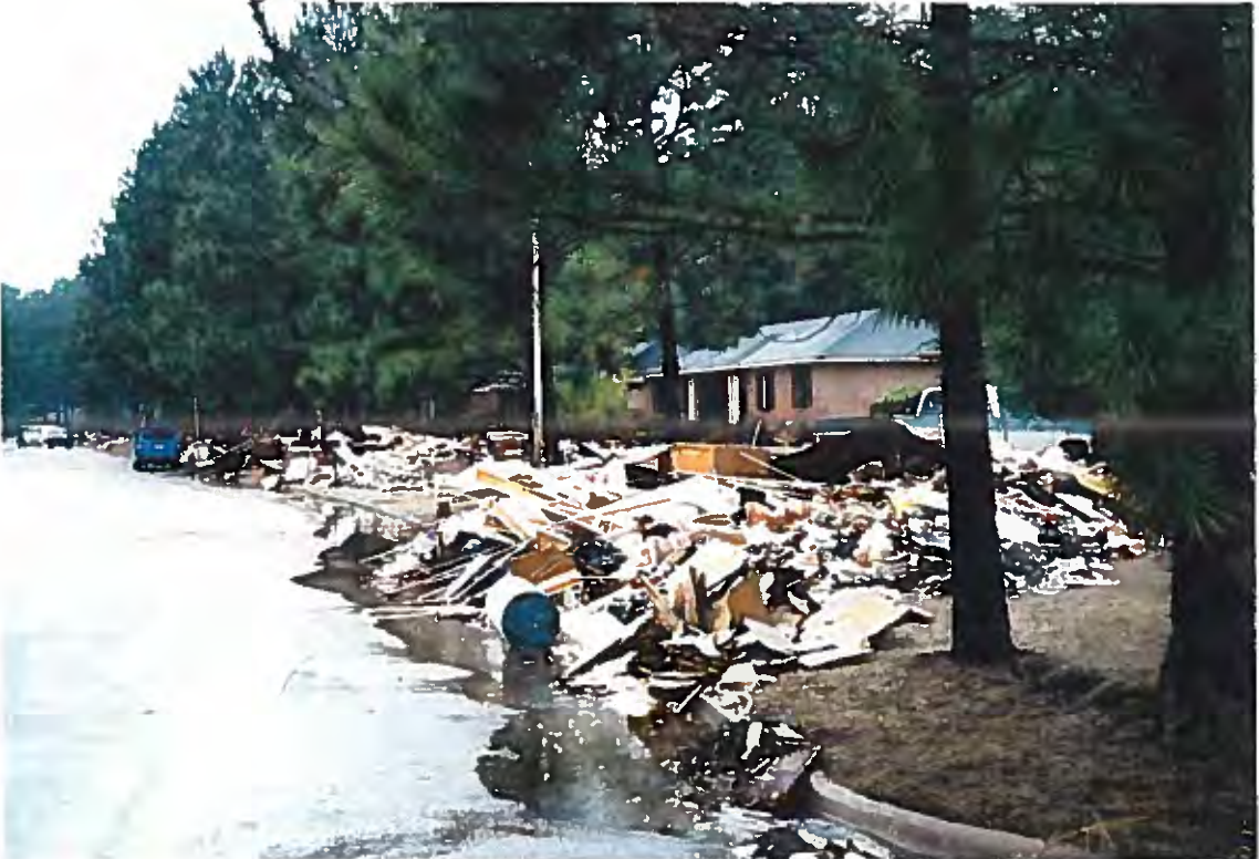
20. Single-family houses on 10th Street. Interior goods and furnishings damaged by floodwaters.