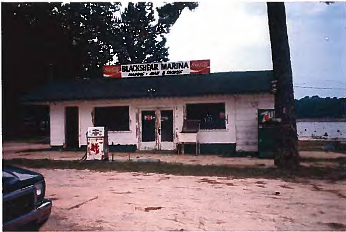
9. Blackshear Marina at State Route 300. Interior goods and furnishings damaged by floodwaters.