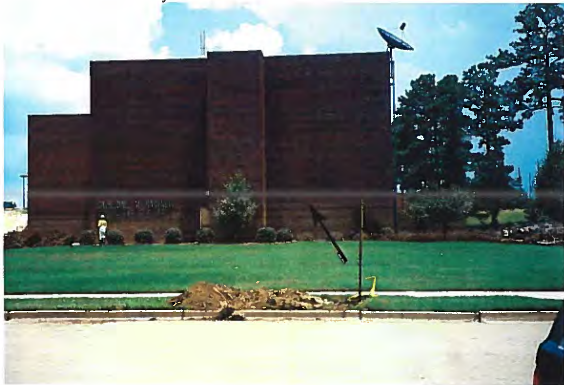
2. Hartnett Criminal Justice Building. High water mark indicated by arrow.