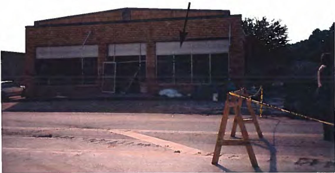
6. View down side street. High water mark indicated by arrow.