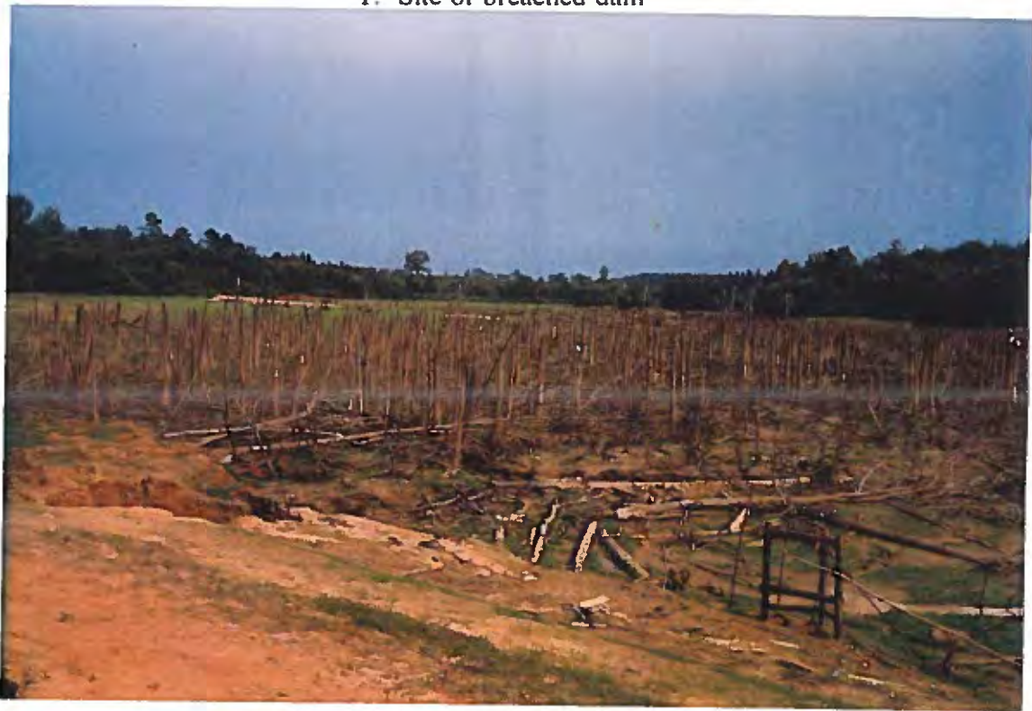
2. Lake area after loss of water