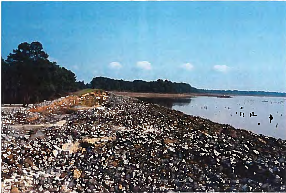
3. View along embankment showing failure area (foreground) and remaining embankment (background).