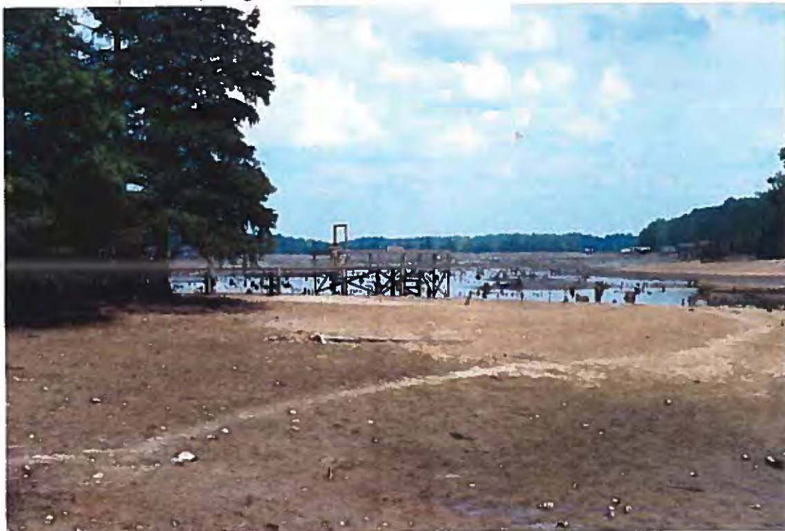
4. Lake area after loss of water; dock indicates original water level.