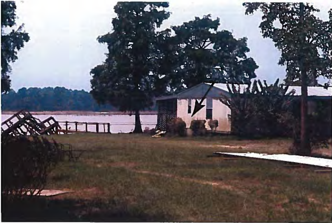
3. House on Lake Blackshear damaged by high water. High water mark indicted by arrow.