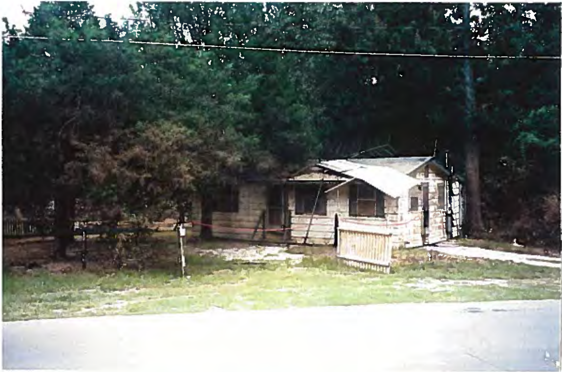
12. Main Street. Frame house floated off foundation and moved 20-30 feet.