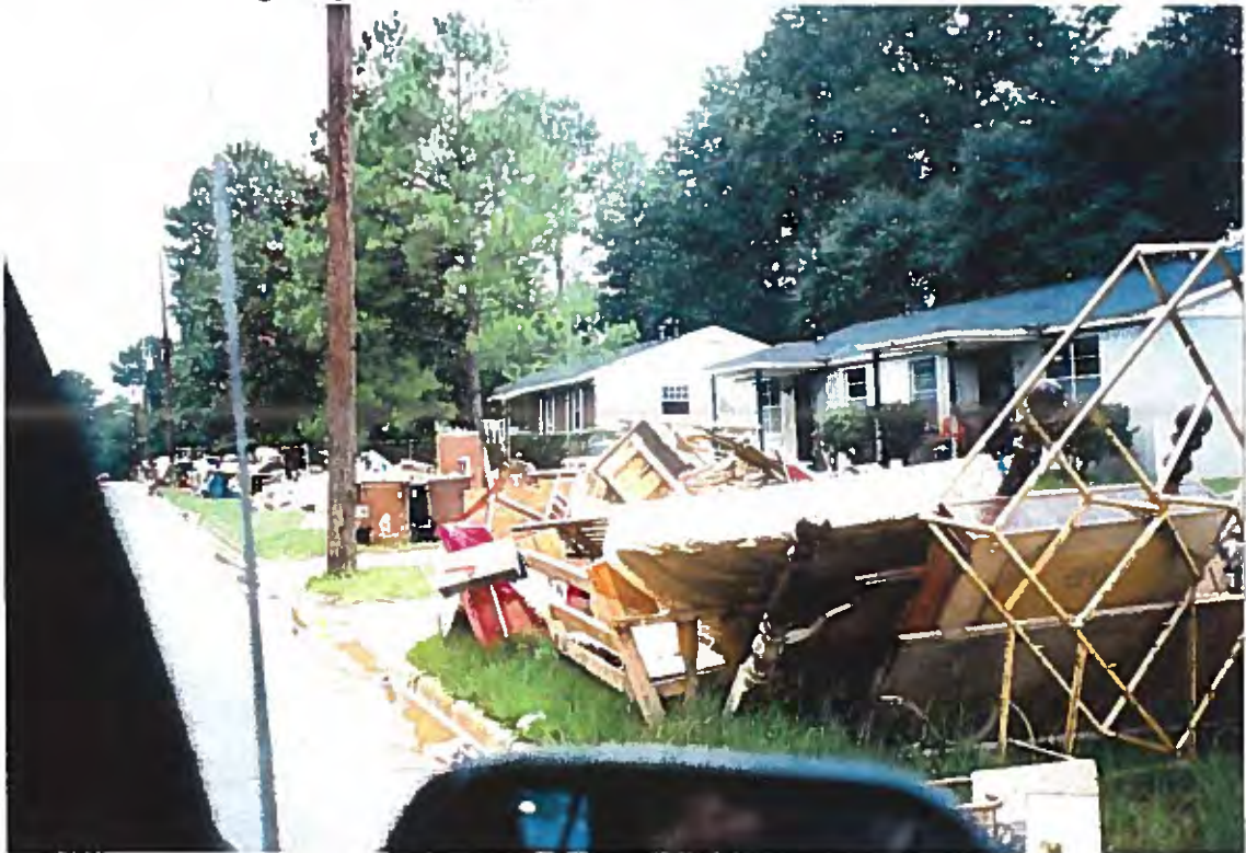
16. Single-family house on Wadkins Street. Interior goods and furnishings damaged by floodwaters.