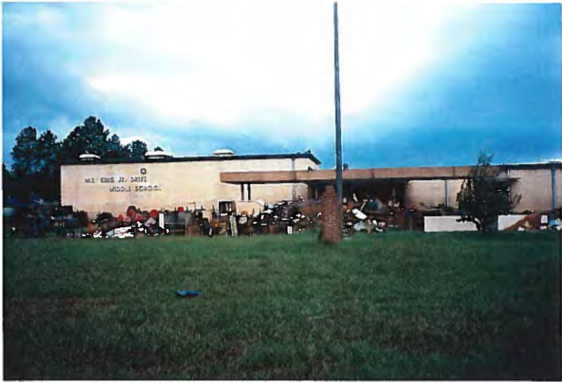
15. Martin Luther King Middle School. Interior goods and furnishings damaged by floodwaters.