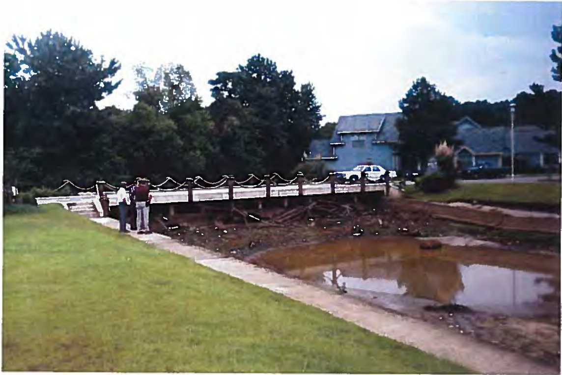
1. Control structure on one arm of lake