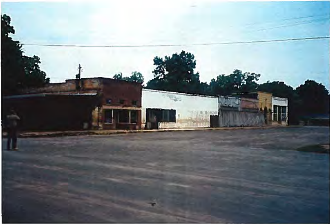
7. Commercial buildings across from courthouse. All goods and furnishings damaged by floodwaters.