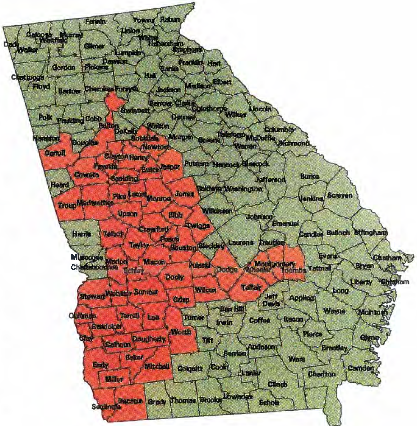
FIGURE 1. COUNTIES INCLUDED IN DISASTER DECLARATION (SHOWN IN RED)