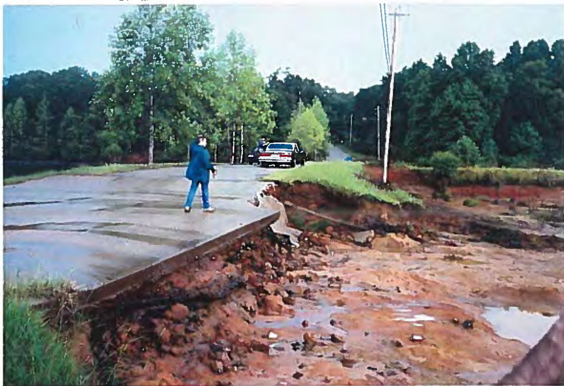
2. Eroded embankment, damaged road, and small failed pond on right.