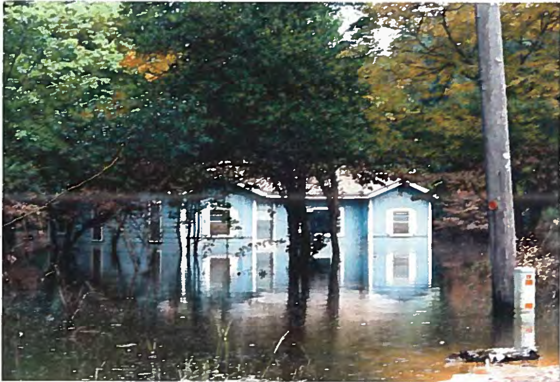
13. House on Clear Water Street still flooded.