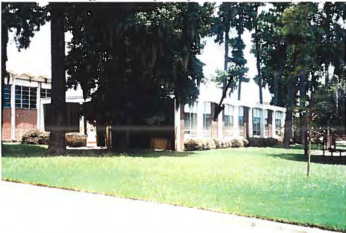
6. Hattie Malone Infirmary. High water mark indicated by arrow.