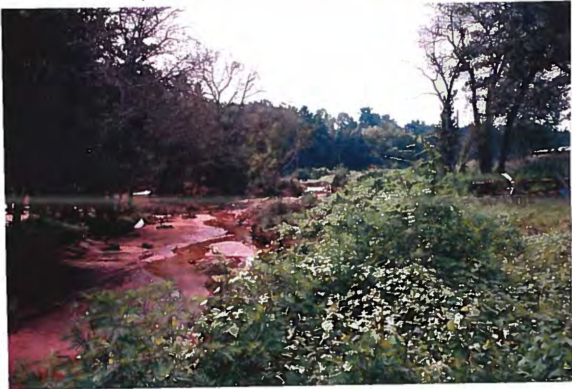
2. Looking down tributary of Town Creek from railroad tracks. House in photo 1 above located just to the left of creek.