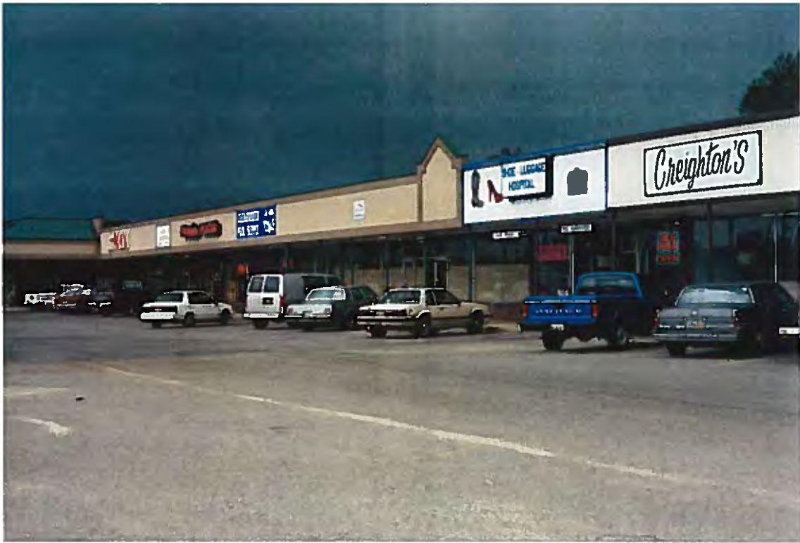
6. Pio Nono Plaza. Minor flood damage to interior goods and furnishings.