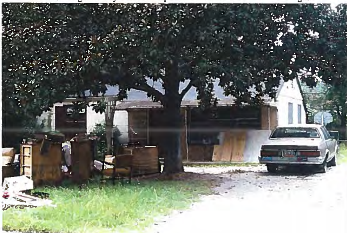
5. Single-family house on St. Charles Place. Minor water damage to interior goods and furnishings.