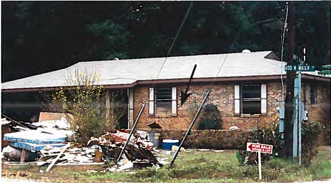
4. House at E. Parks and Water Street. High water mark indicated by arrow.