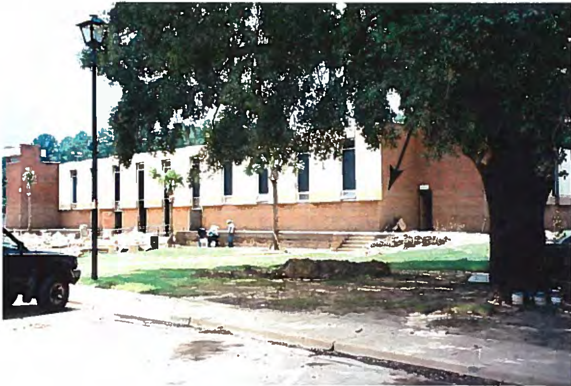
1. Blaylock Dormitory at Albany State College. High water mark indicated by arrow.