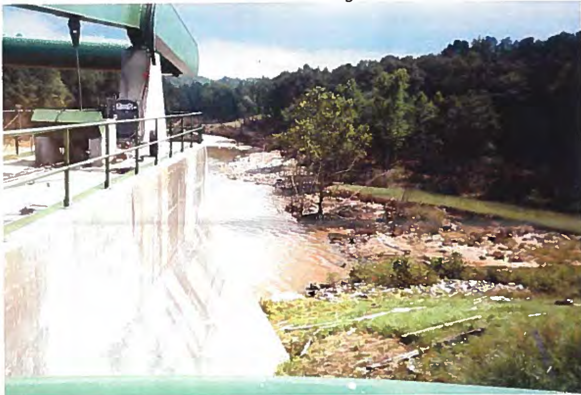
3. Downstream erosion