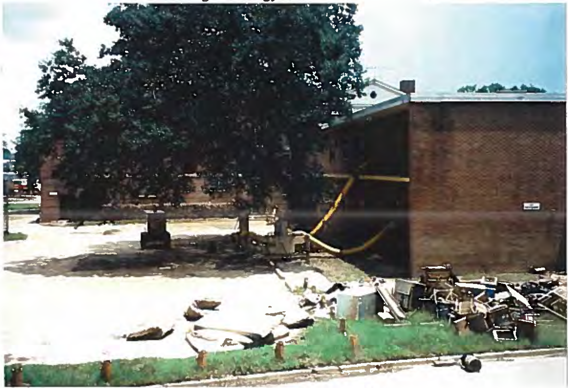
4. Dormitory adjacent to Blaylock Dormitory. Interior goods and furnishings damaged by floodwaters.