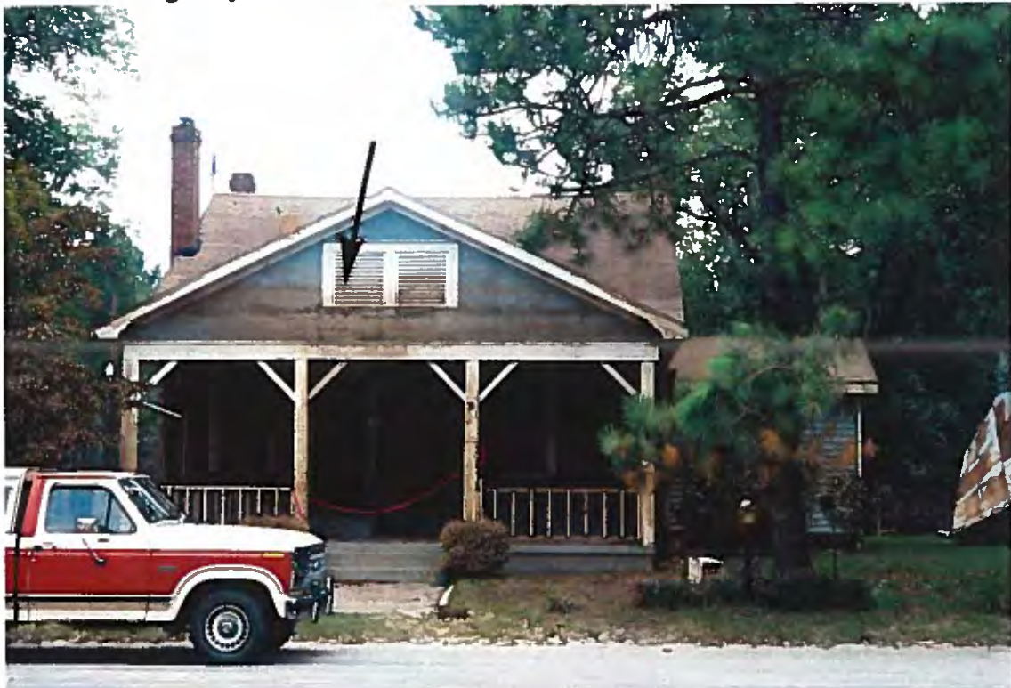
8. House across from courthouse. High water mark indicated by arrow.