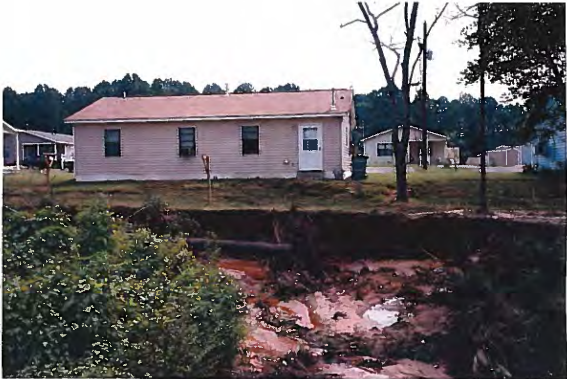
3. Eroded banks along tributary. Proximity of house to creek channel shows danger of siting too close to a waterway.