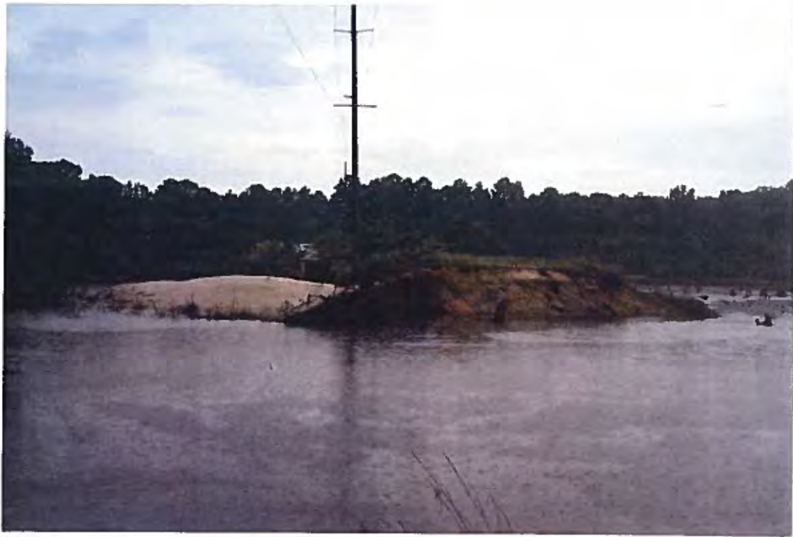
1. Looking upstream at dam breach area