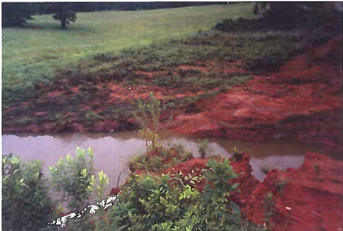
2. Closeup of dam breach area