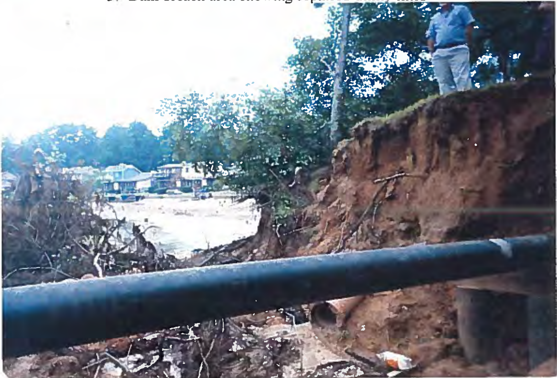
4. Closeup of embankment at breach