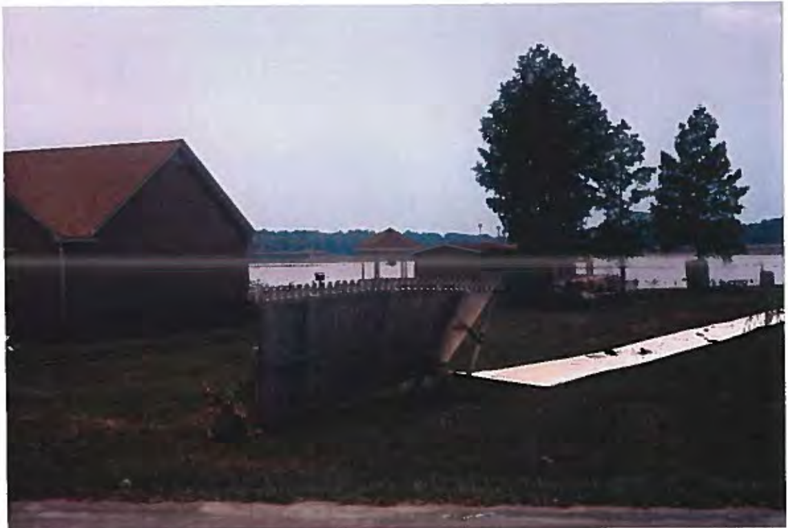
2. House on Lake Blackshear. Fence damaged by floodwaters.