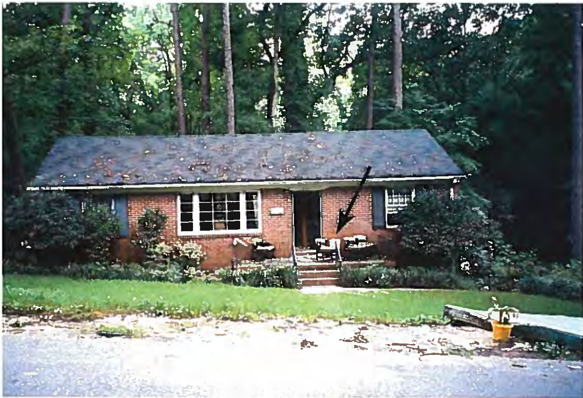
1. Single-family residence at 2595 N. Nancelot Circle. High water mark indicated by arrow.