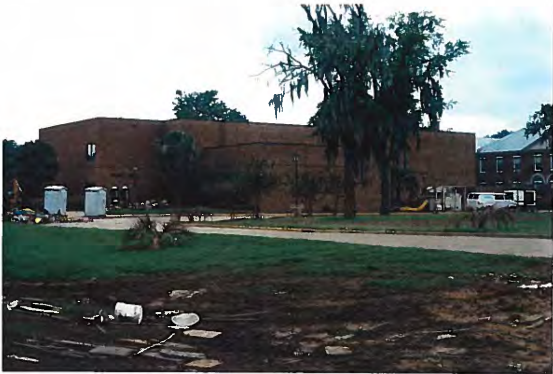
7. Peace Hall. Interior goods and furnishings damaged by floodwaters.