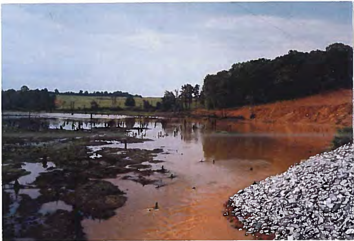
2. Lake area after loss of water