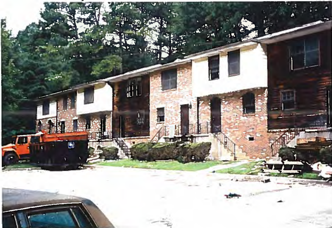
2. Bowman Creek Apartments on Pierce Avenue. Lower level flooded. Interior goods and furnishings damaged.