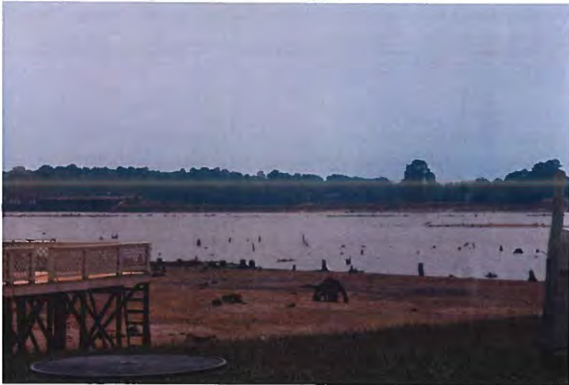
4. View of dam and breach.