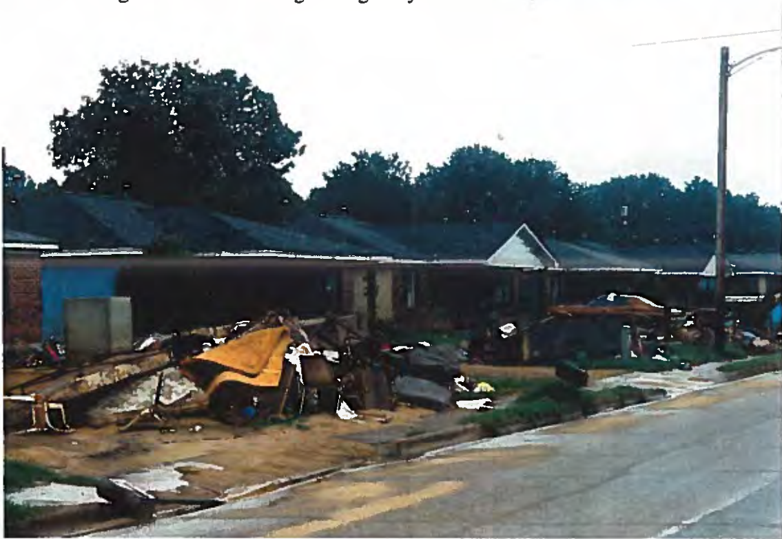
14. Single-family houses on Flintside Drive. Flood depths reached 5 to 6 feet. All interior goods and furnishings damaged by floodwaters.