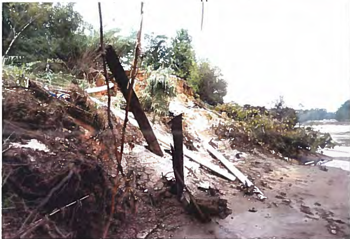
4. Closeup of opposite bank failure; purpose of wood pilings unknown