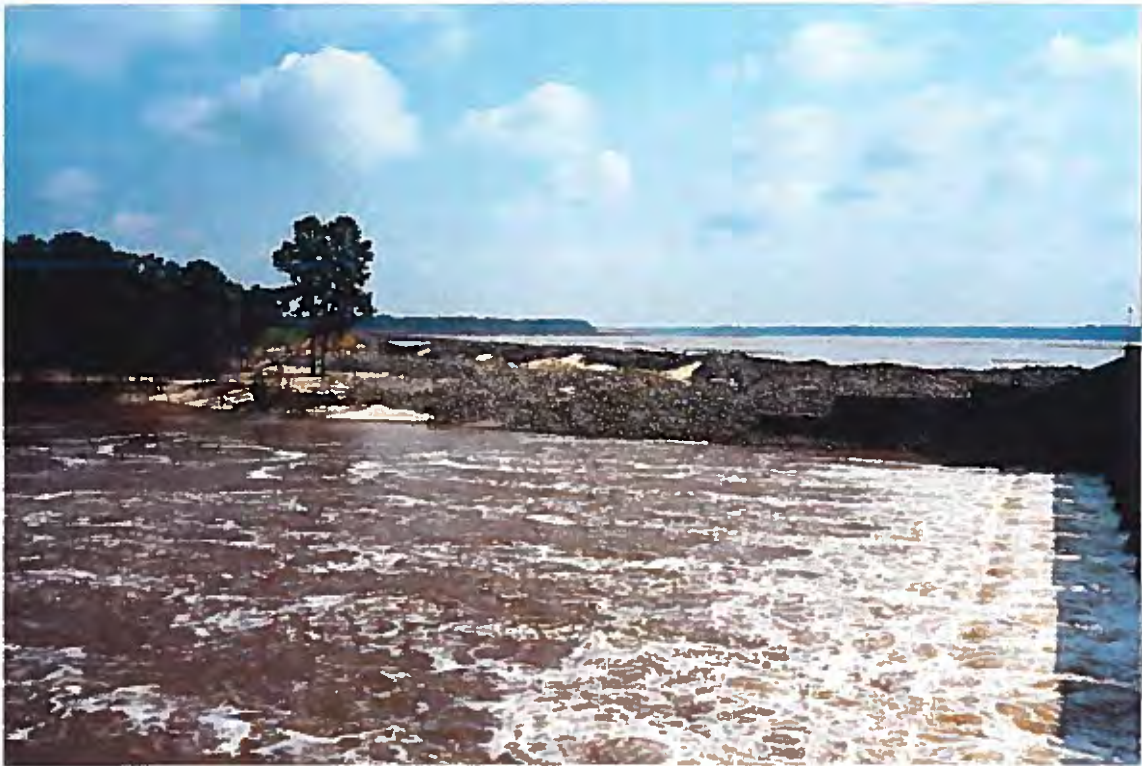
1. Downstream side of dam showing riprap embankment failure area.