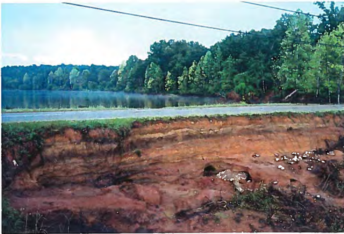
1. Eroded embankment on downstream dam face.