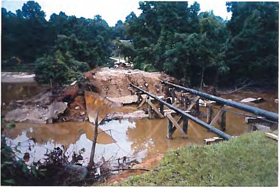
3. Dam breach area showing replaced utility lines