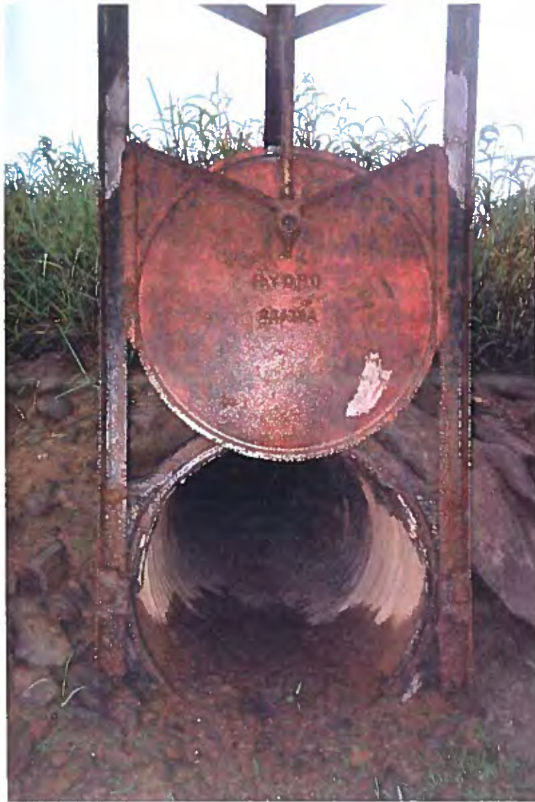
3. Undersized outlet