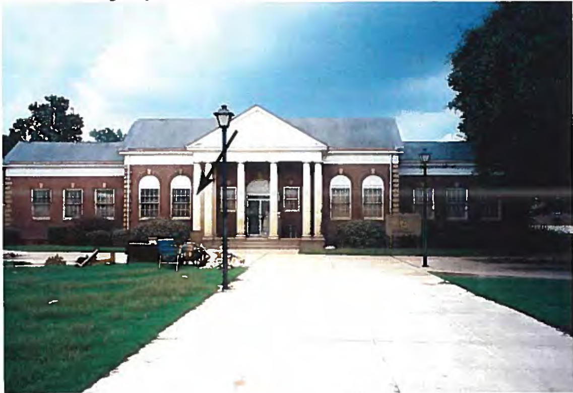
10. ROTC building. High water mark indicated by arrow.