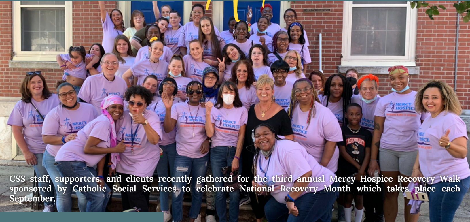
CSS staff, supporters, and clients recently gathered for the third annual Mercy Hospice Recovery Walk sponsored by Catholic Social Services to celebrate National Recovery Month which takes place each September.