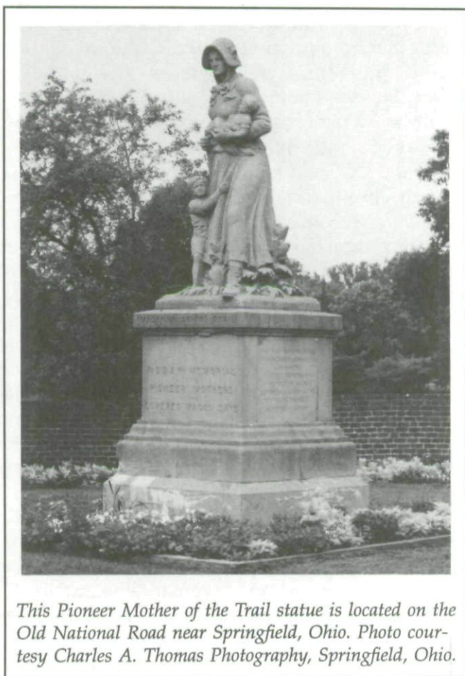
This Pioneer Mother of the Trail statue is located on the Old National Road near Springfield, Ohio.

ANOTHER FACTOR in the DAR's growth in Iowa was the DAR's engagement in a wide range of nonhistorical activities under the broad rubric of promoting patriotism. These various projects, like the promotion of the history of white settlement of the West, did not require the presence of Revolutionary landmarks.